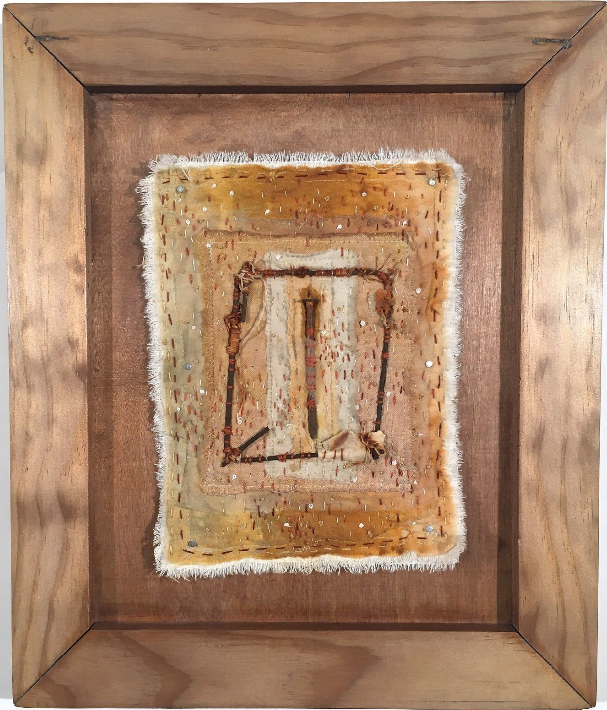
Figure 8: Shrine V: So Long/Farewell/Goodbye