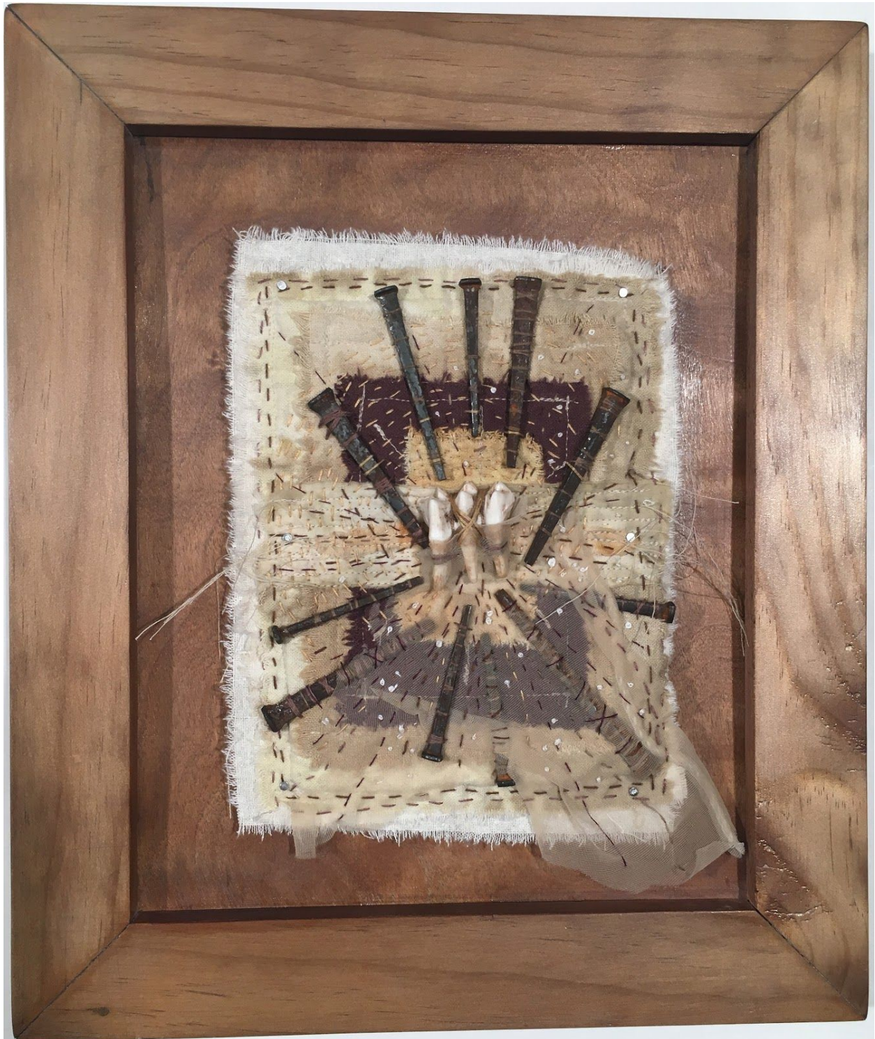
Figure 7: Shrine IV: I Didn't Mean To Bite You (Sorry)