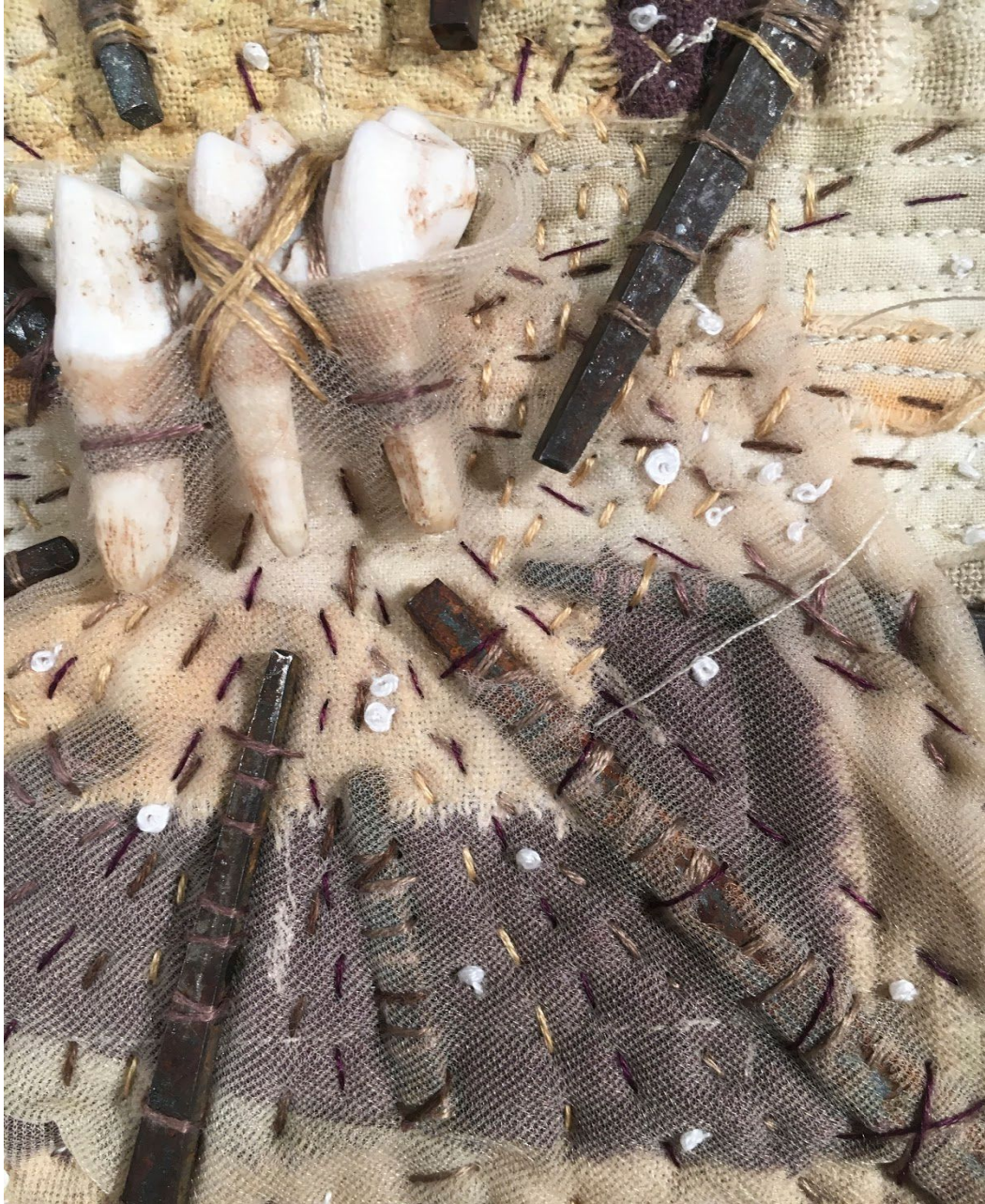
Figure 1: Shrine IV: I Didn't Mean to Bite You (Sorry) , detail