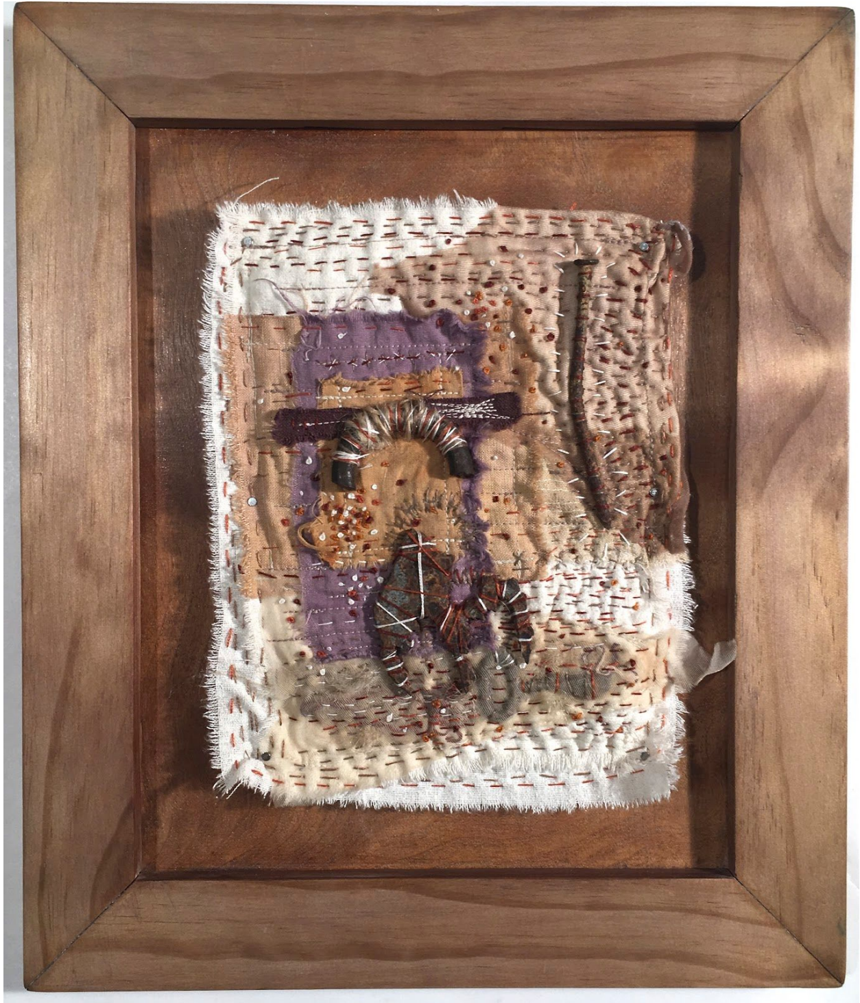
Figure 6: Shrine III: Beginning/End/Best of It