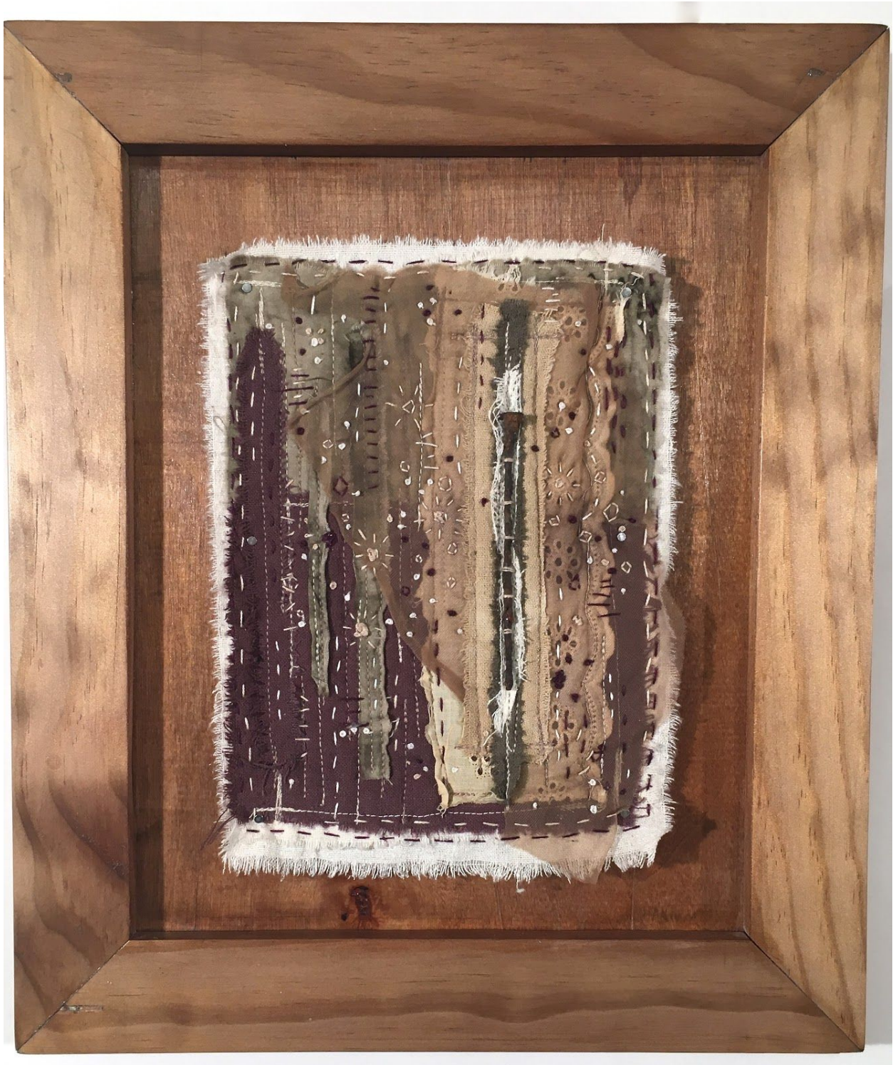
Figure 5: Shrine II: Tit for Tat (Like That For This)