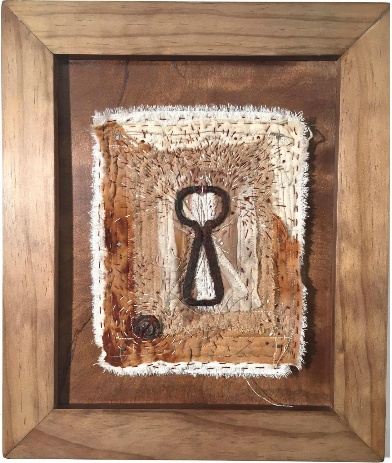
Figure 4: Shrine I: Oh What's The Use (Mechanical Sacrificial Calf)