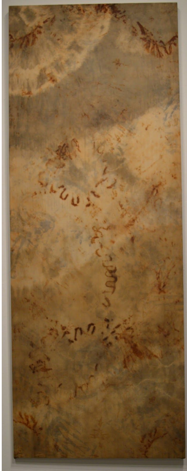
Figure 11: Stubborn Beauty: I