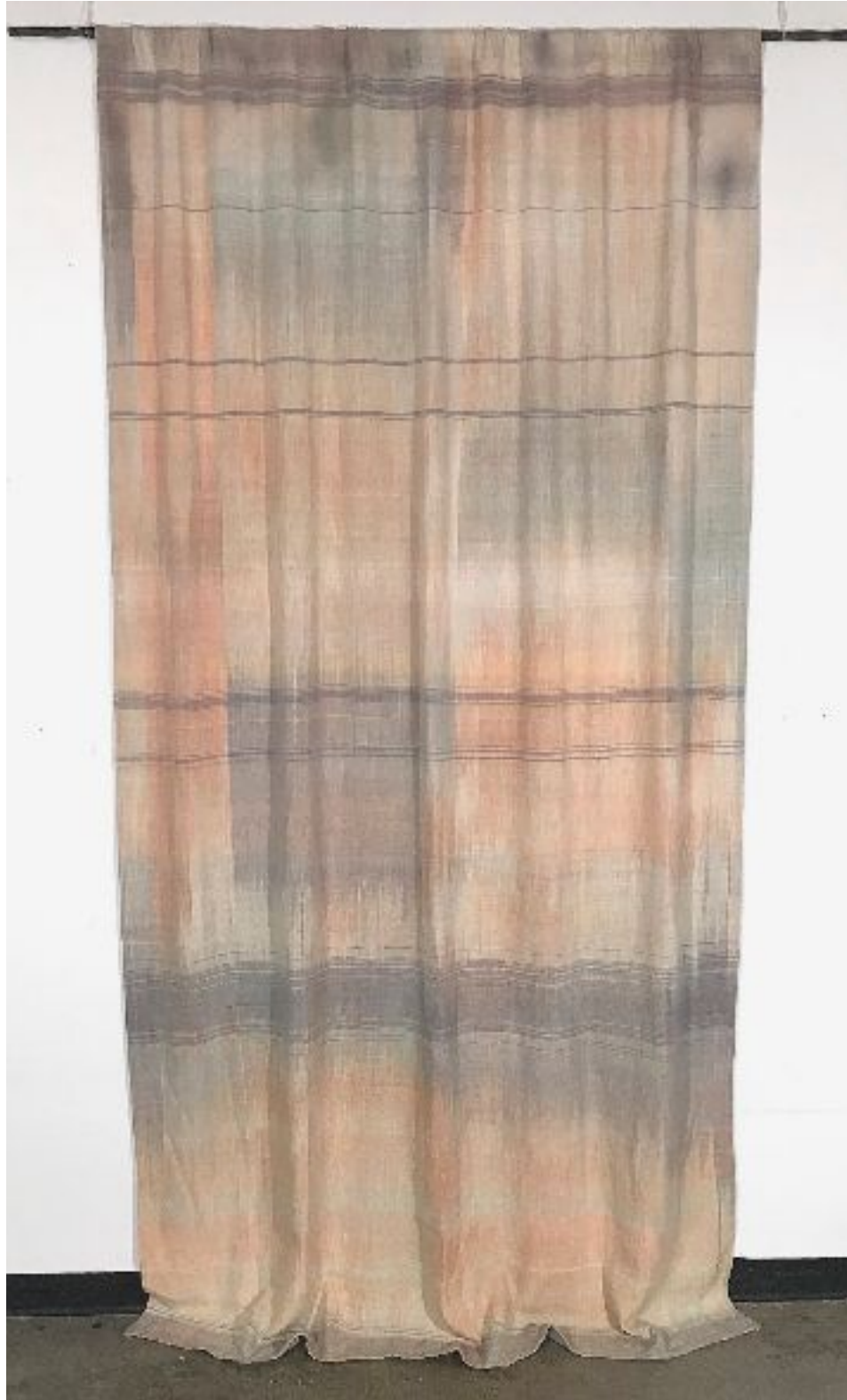
Figure 2: Traveling Swallowing Dramamine