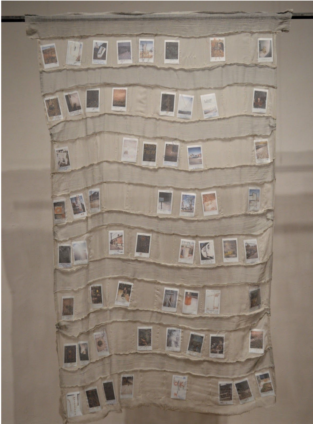
Figure 9: Out of the Context (And Into What You Meant)