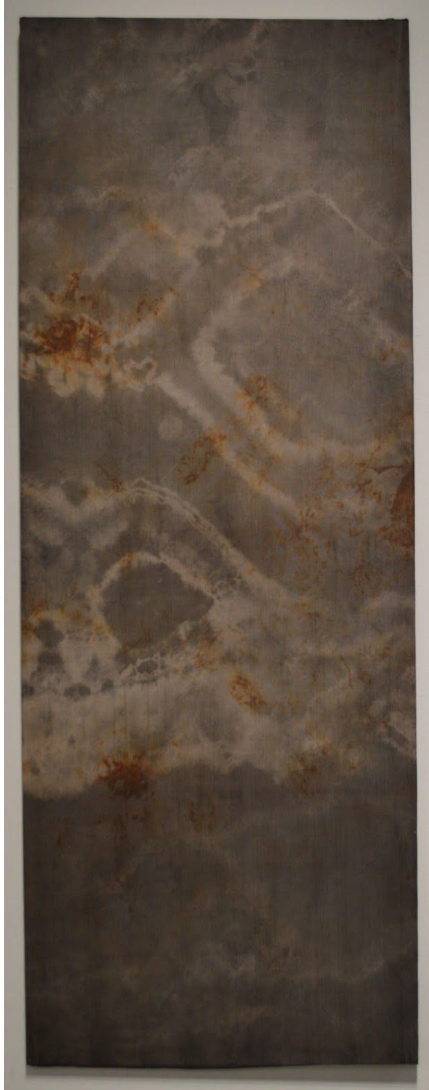
Figure 12: Stubborn Beauty: II