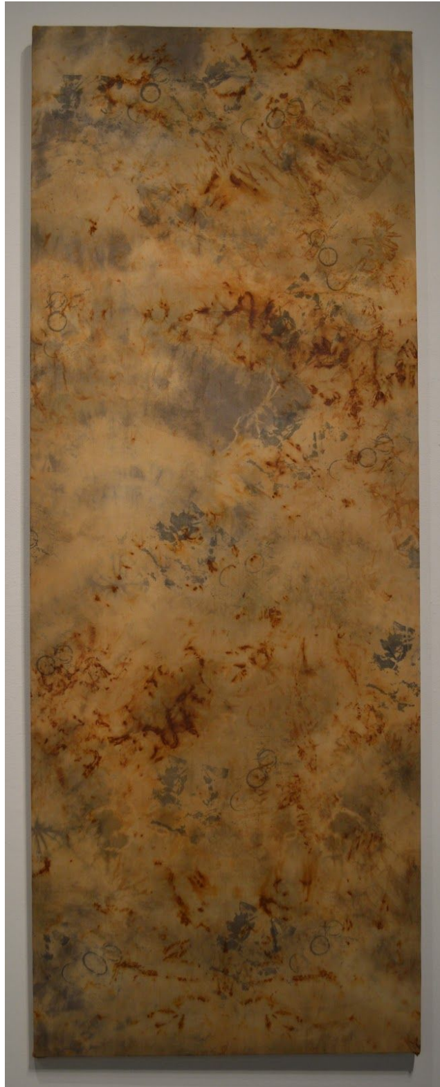
Figure 13: Stubborn Beauty: III