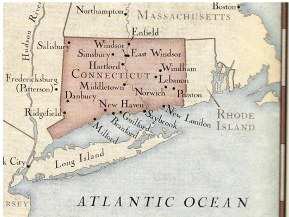
Figure 6: Map of Colonial Connecticut

It is worth noting that in the following events, the colonial court records employ the old style of dating in which the new year began March 25, not in January. This style of dating was used until 1752. For the purposes of this work the years follow the new style of dating with the year changing in January.