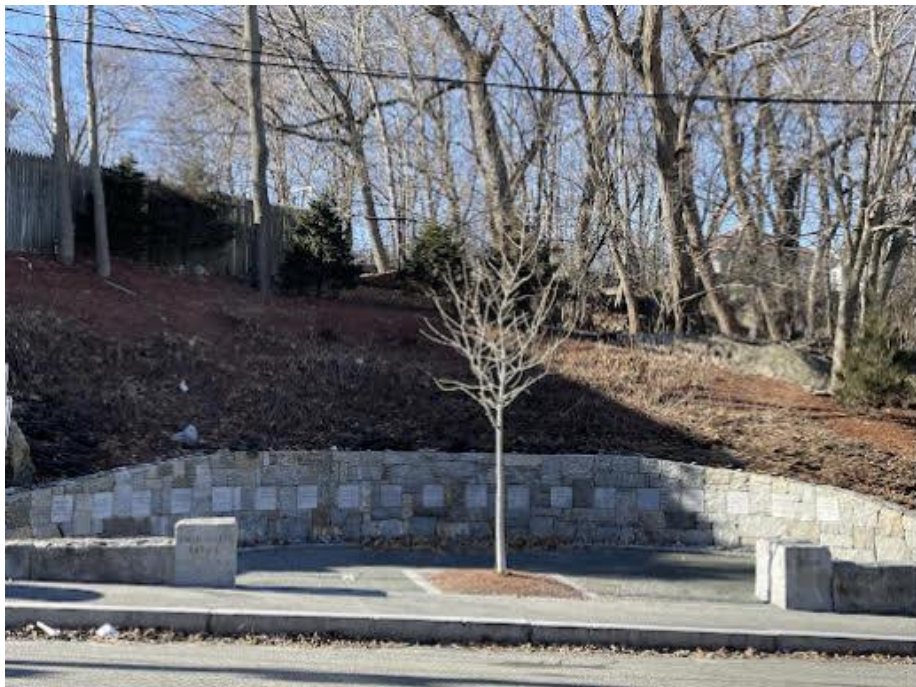
Figure 13: Proctor's Ledge Memorial