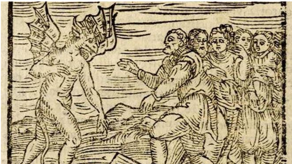
Figure 1: Compendium maleficarum : Devil and witches trampling a cross. From Compendium maleficarum by Francesco Maria Guazzo, 1608.

focuses on Connecticut and Massachusetts, though outbreaks of witchcraft accusations occurred in New Hampshire as well. These witch hunts-represented a desperate attempt by the colonists to make sense of the difficult New World and the failure of the Old-World in preparing for its challenges. Witch hunts only emerged in New England after colonists realized the impossibility of taming the New World to reflect what they experienced in England and Continental Europe. Chapter three of this thesis relies heavily on primary sources to discuss the events that unfolded in colonial Connecticut, New Hampshire, and Massachusetts during the witch trials.