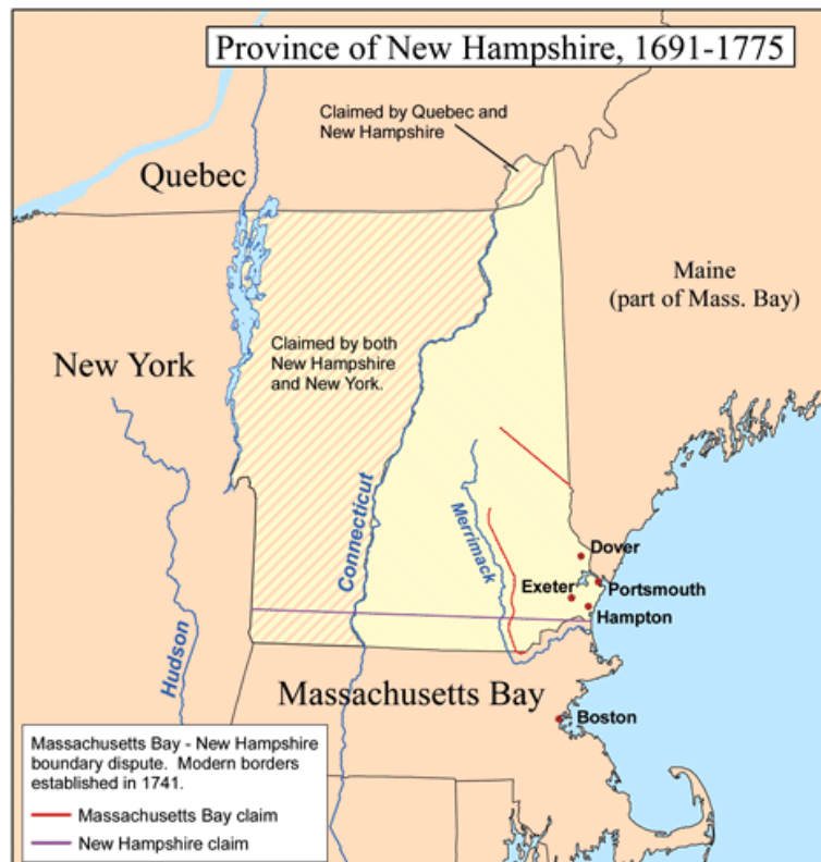
Figure 8: Map of New Hampshire

Individuals also grew suspicious of the fact that no other individuals were afflicted in the way Branch was, which further separates this instance of witch hunting in Connecticut from the one occurring in Salem, Massachusetts. 173