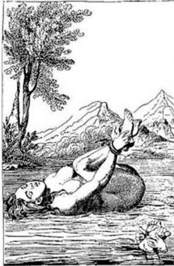
Figure 4: "The witch swims!" Illustration from Montague Summers' The Discovery of Witches: A Study of Master Matthew Hopkins, Commonly Call'd Witch Flnder Generall , Published by Cayme Press, London, 1928.

newborn children in which they would observe if a child could float on the Rhine to prove legitimacy. 53