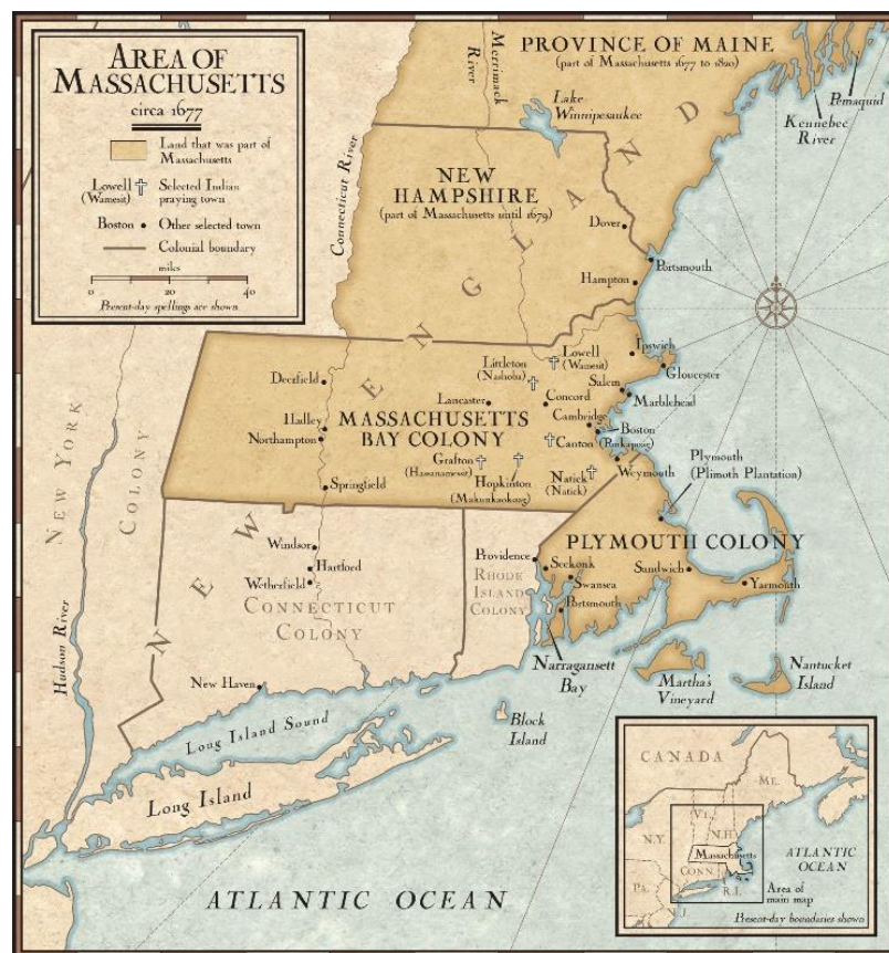
Figure 9: Map of Massachusetts, ca. 1677.