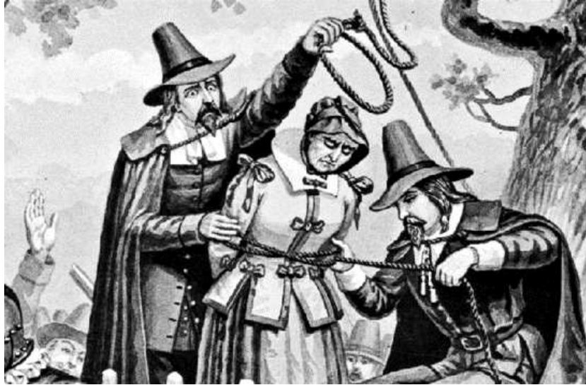
Figure 12: The Execution of Bridget Bishop (ca. 1632-1692), the first woman execution on charges of witchcraft at Salem 1692