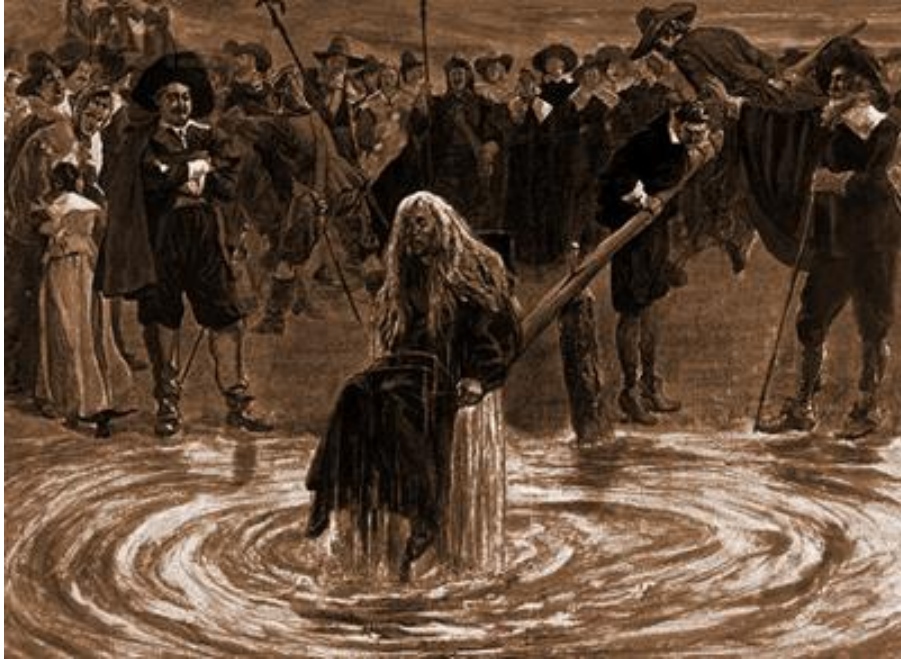
Figure 7: The Duckingstool by Charles Stanley Reinhart, 1900

The question of what to do with the accused lingered in the minds of Stamford townsfolk as the witch hunt continued in September of 1692 when news arrived of girls and young women in a small town outside of Boston, named Salem, being afflicted with fits similar to those of Katherine Branch. Because there were no colonial newspapers at the time, letters and travelers slowly spread information from one end of New England to the other meaning that by the time word got to Stamford about the Salem Witch Trials, Massachusetts had already arrested, convicted, and executed accused individuals. 169 The grand jury of the court of oyer and terminer that met on September 14, 1692, indicted both Clawson and Disborough. They also declared there was sufficient evidence to try Marty Staples and the Harveys, though magistrates did not