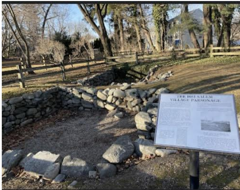
Figure 10: Site of the Salem Village Parsonage

Osburn were accused by the afflicted girls of causing their illnesses and visiting them in spectral forms. By the end of February 1692, the Putnam family sought the help of Salem magistrates Jonathan Corwin and John Hathorne, who began an official inquiry into the accusations. 184