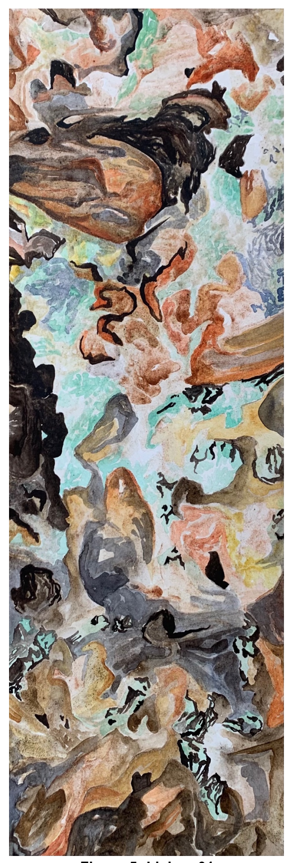
Figure 5: Lichen 01