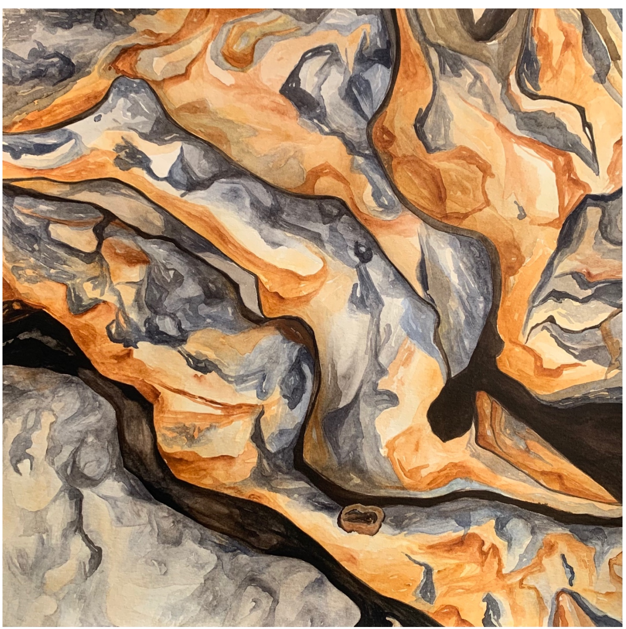
Figure 3: Into the Abyss