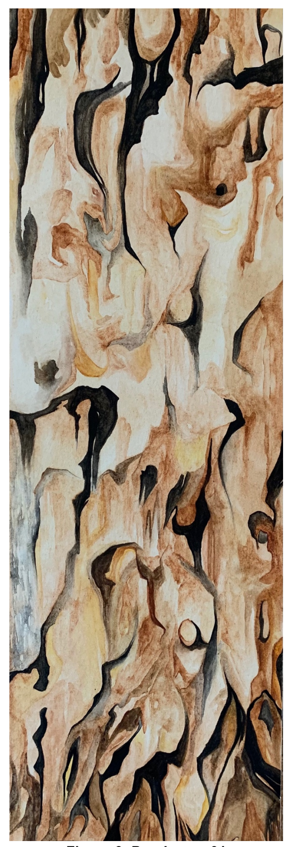
Figure 6: Ponderosa 01