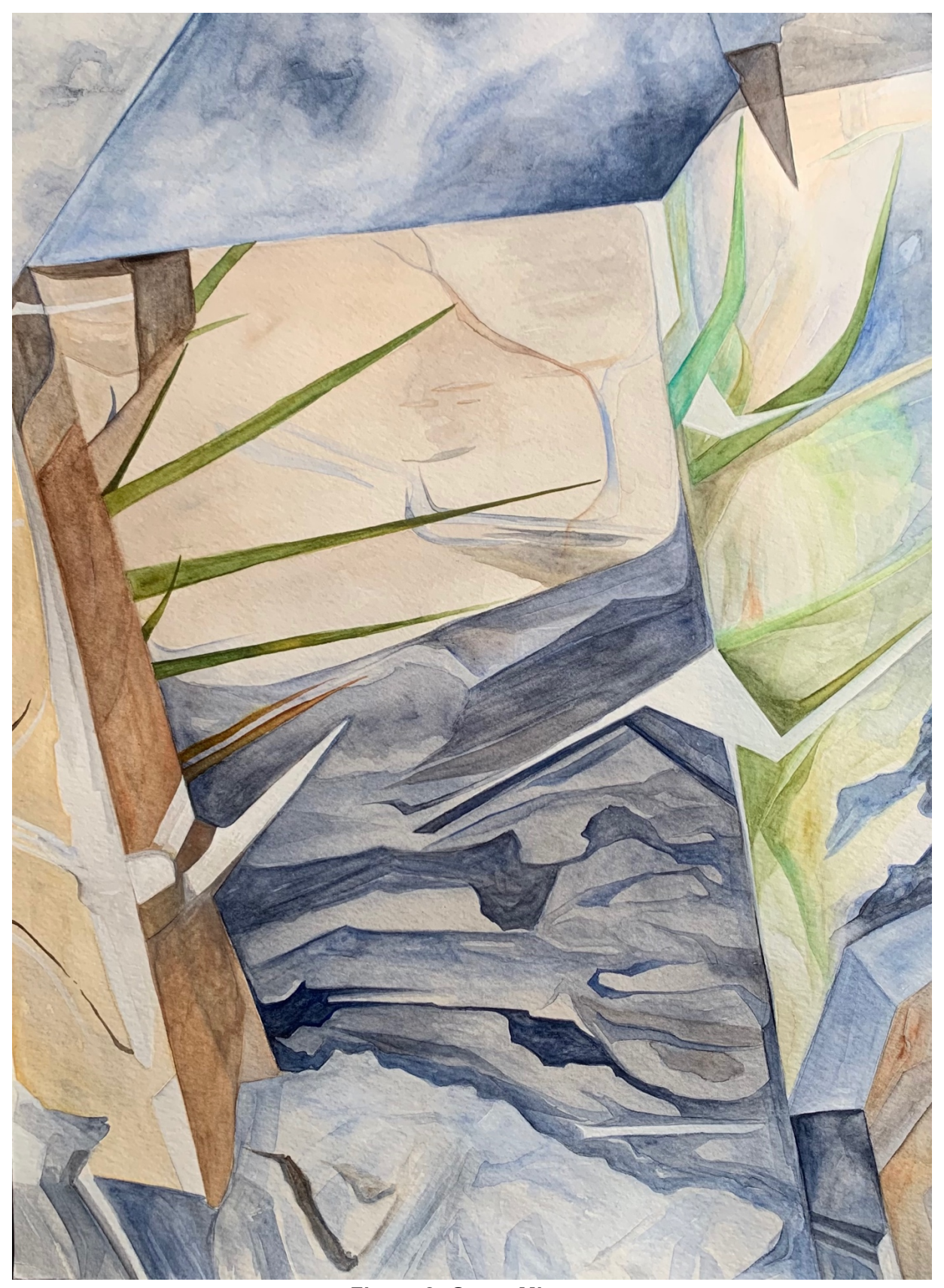
Figure 2: Grass Mirrors