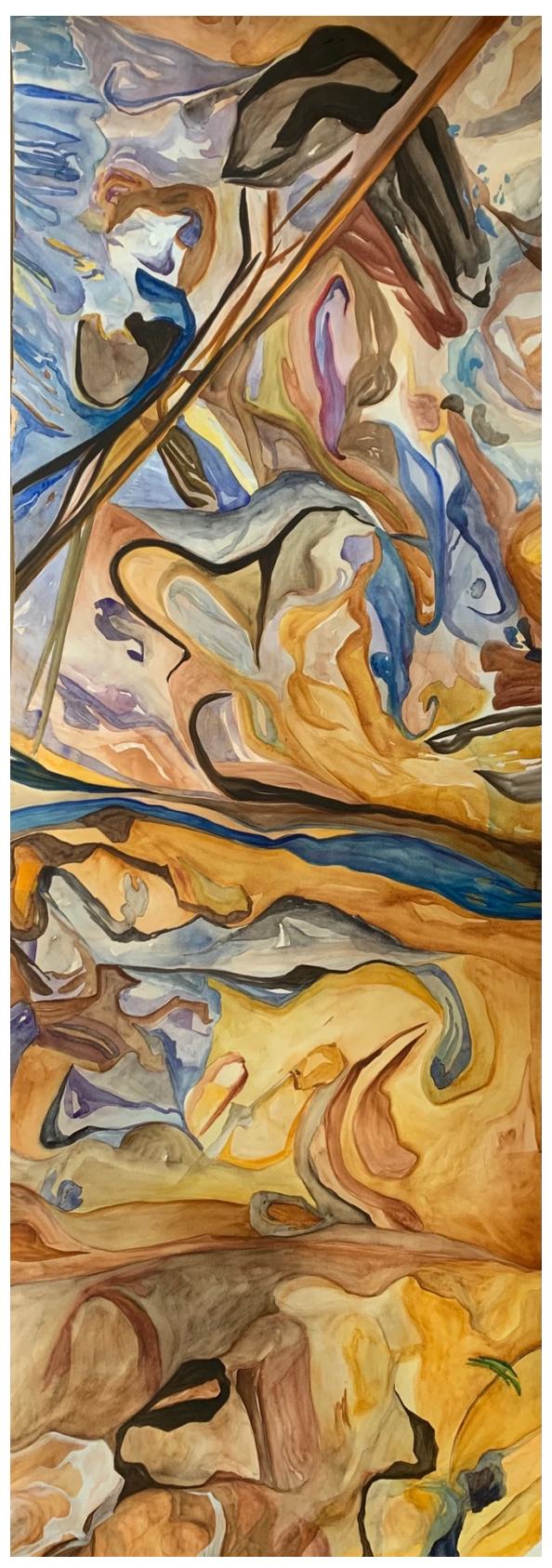
Figure 4: Iron Reflections