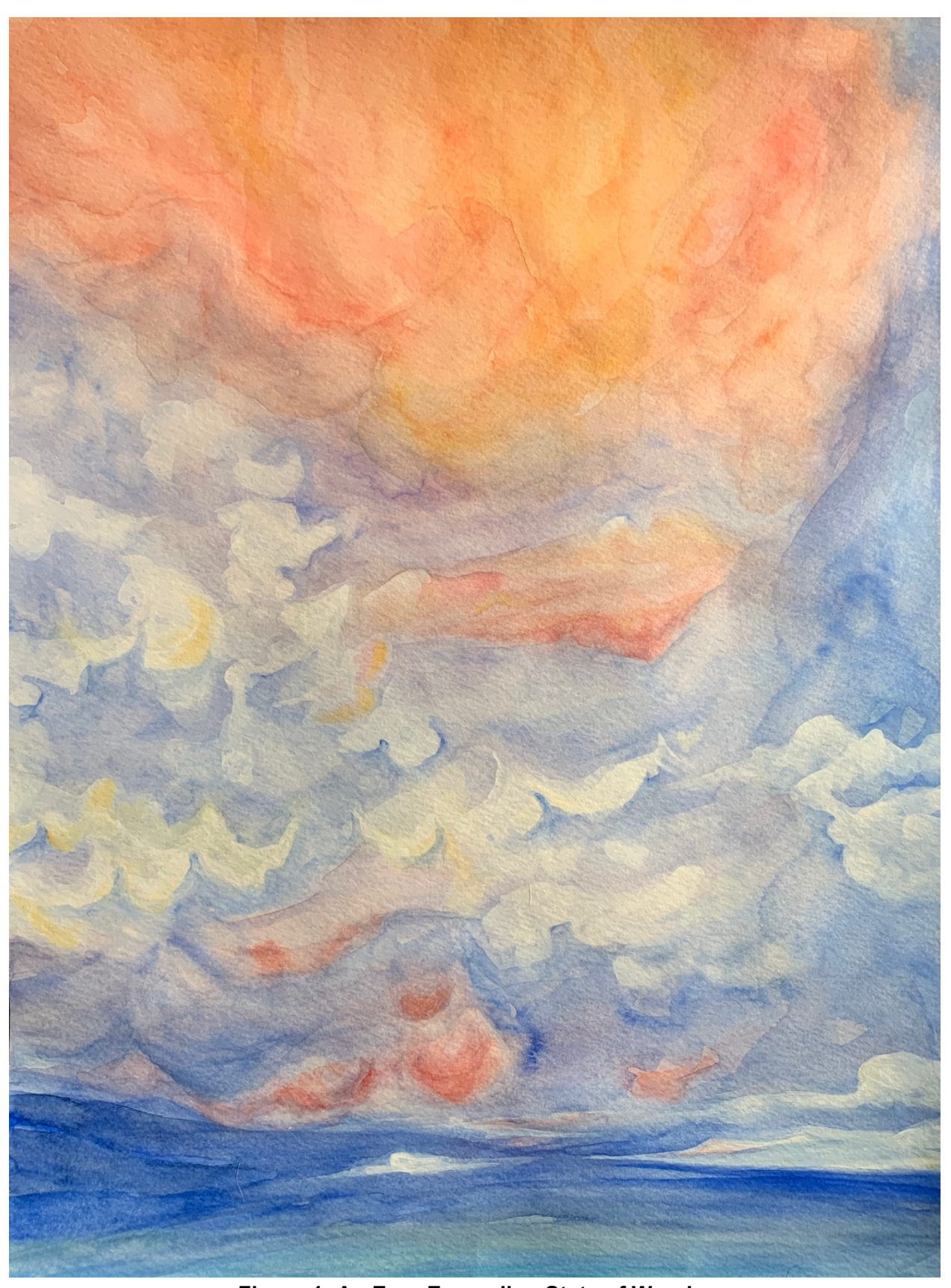
Figure 1: An Ever-Expanding State of Wonder