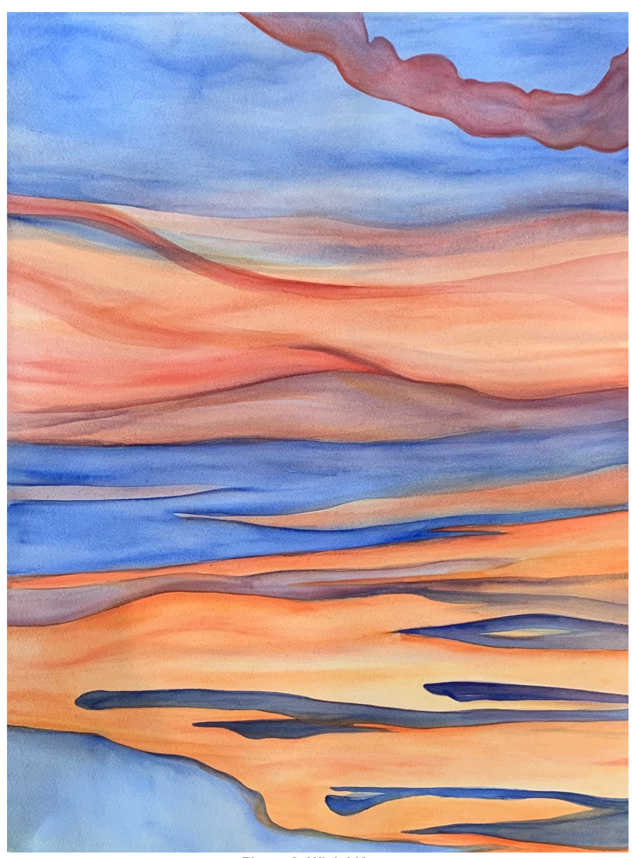
Figure 8: Wish I Knew