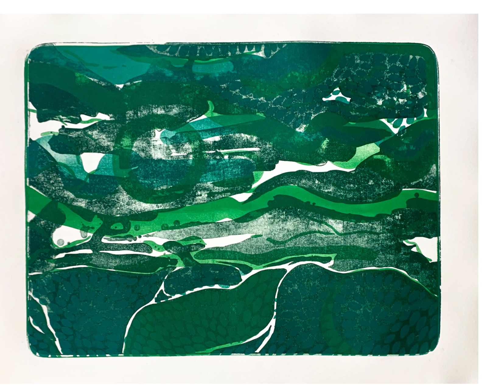
Figure 3: Heart