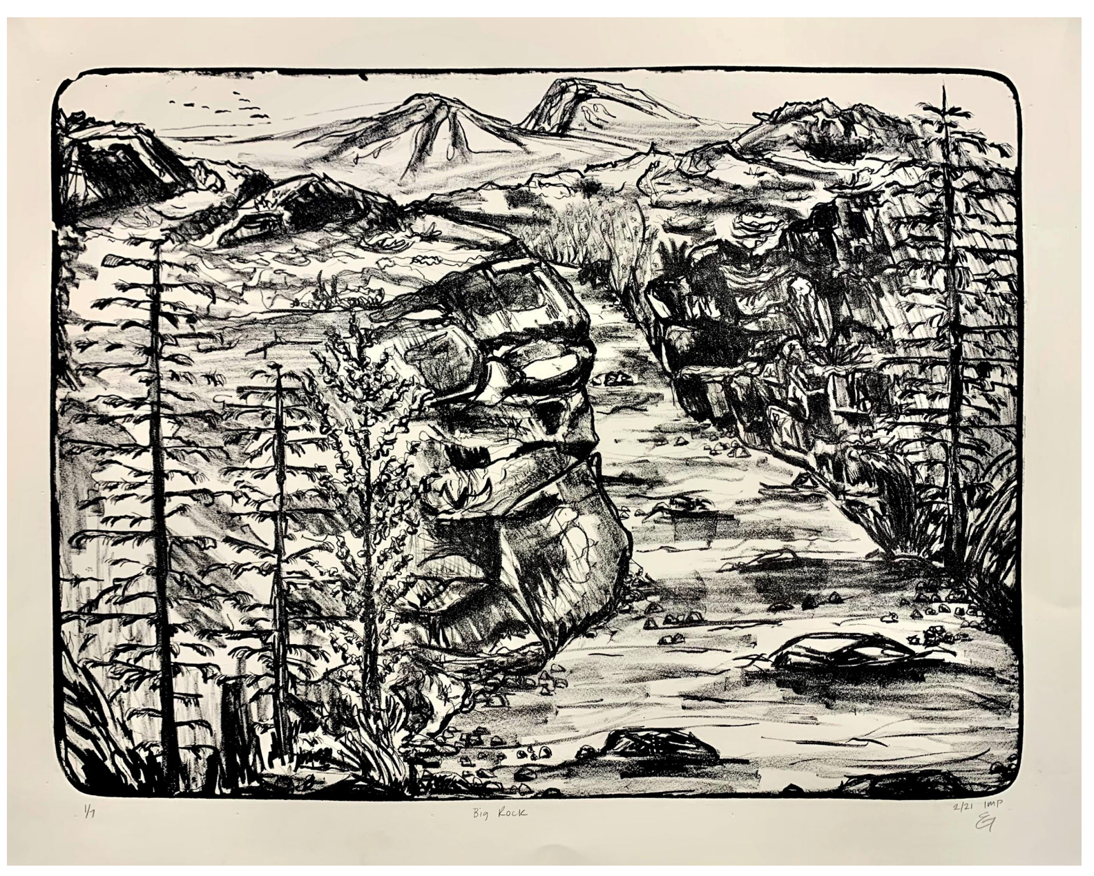
Figure 2: Big Rock