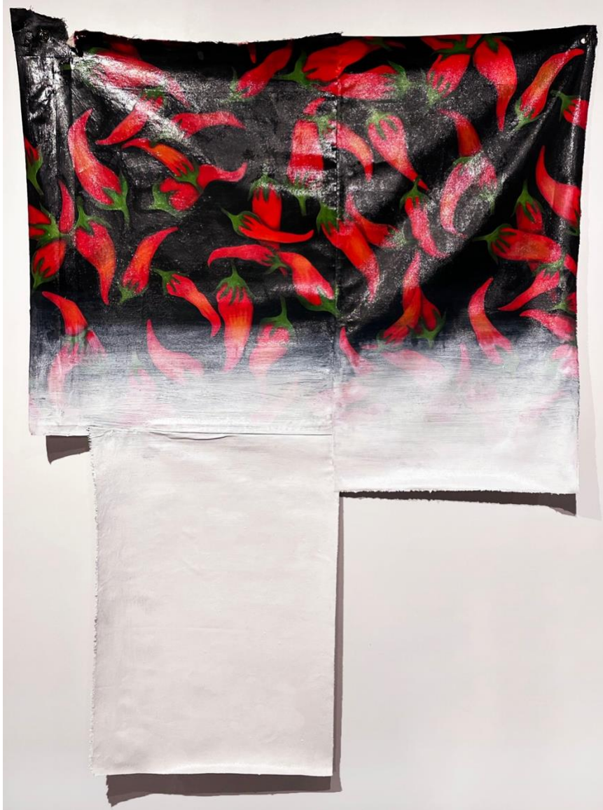
Fig. 2, Don't Call Me That , 2021, acrylic on stitched canvas