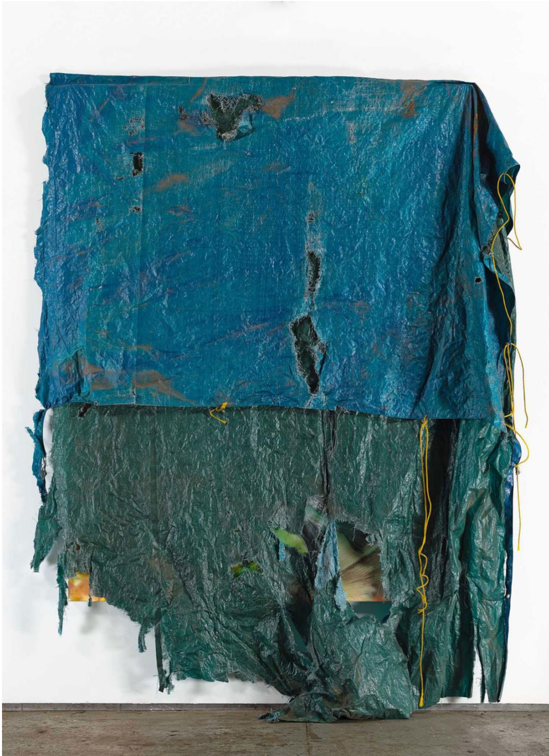
Fig. 5, Untitled , 2014, David Hammons