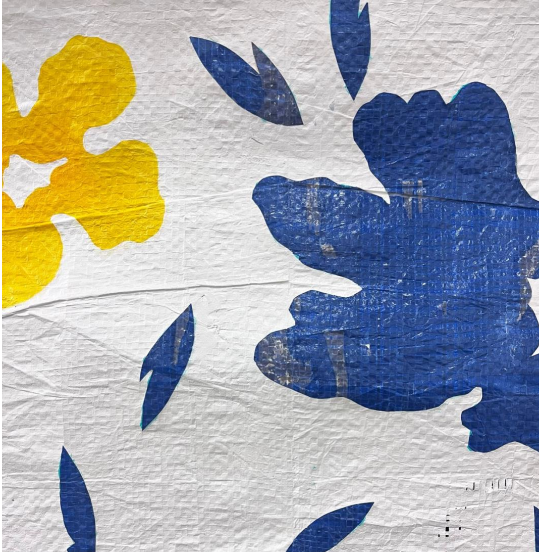
Fig. 6, Detail of Labor of Love , acrylic on distressed tarp, 2022