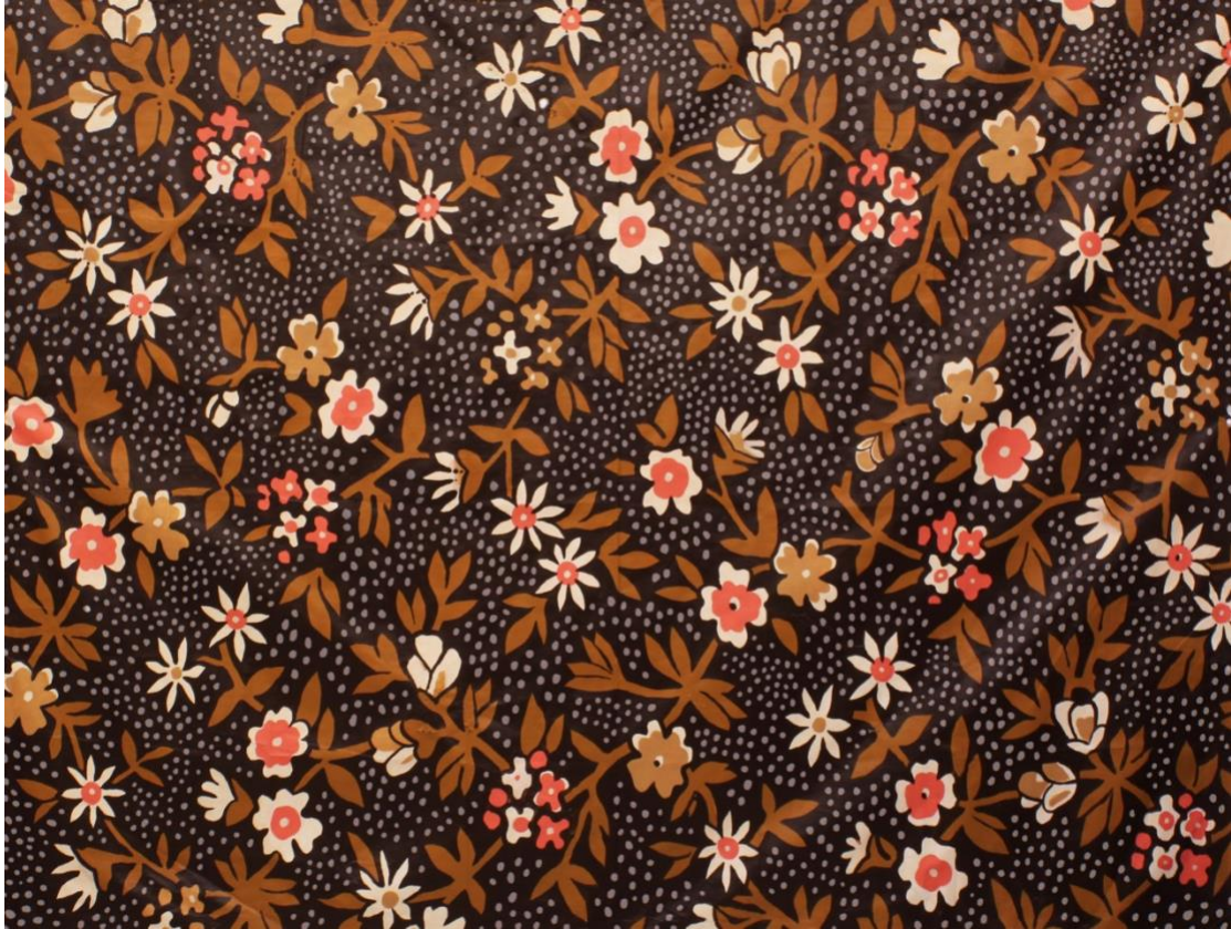
Fig. 16, Marian , 2023, Sam Hamilton, acrylic on distressed tarp