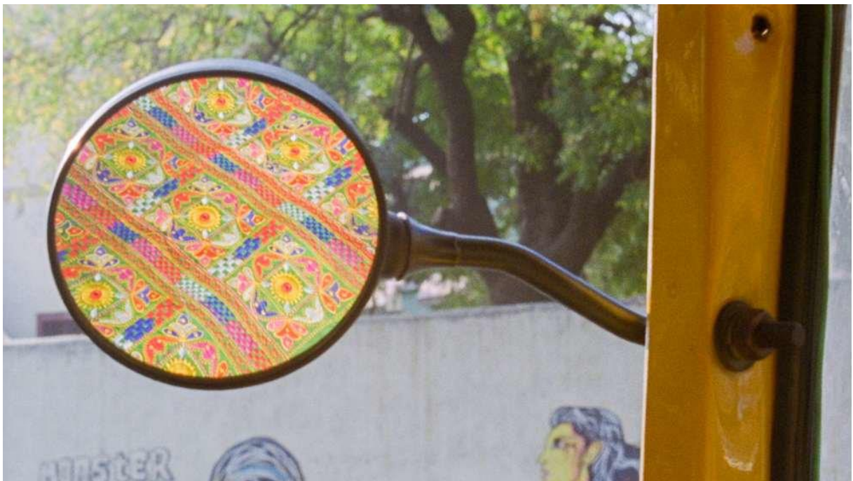
Fig. 10, Film still from The Grand Bizarre , 2018, Jodie Mack