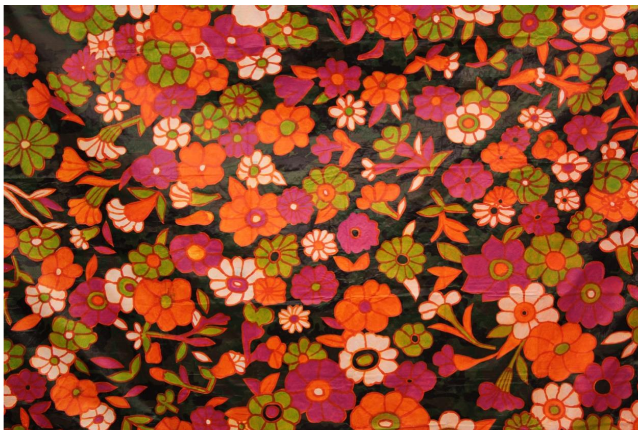
Fig. 19. Gurl Pwr , 2022, Sam Hamilton, acrylic on new tarp