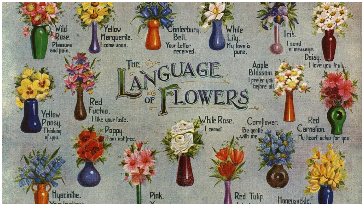
Fig. 13, Illustrated Postcard, printed in England by The Regent Publishing Co. Ltd., Photo Credit: