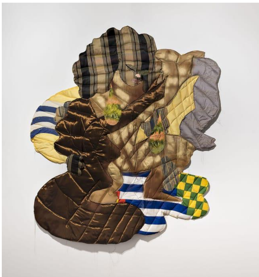
Fig. 18, Dark Poodle , 2016, Maria A. Guzman Capron, fabric, thread, batting, stuffing, and paint