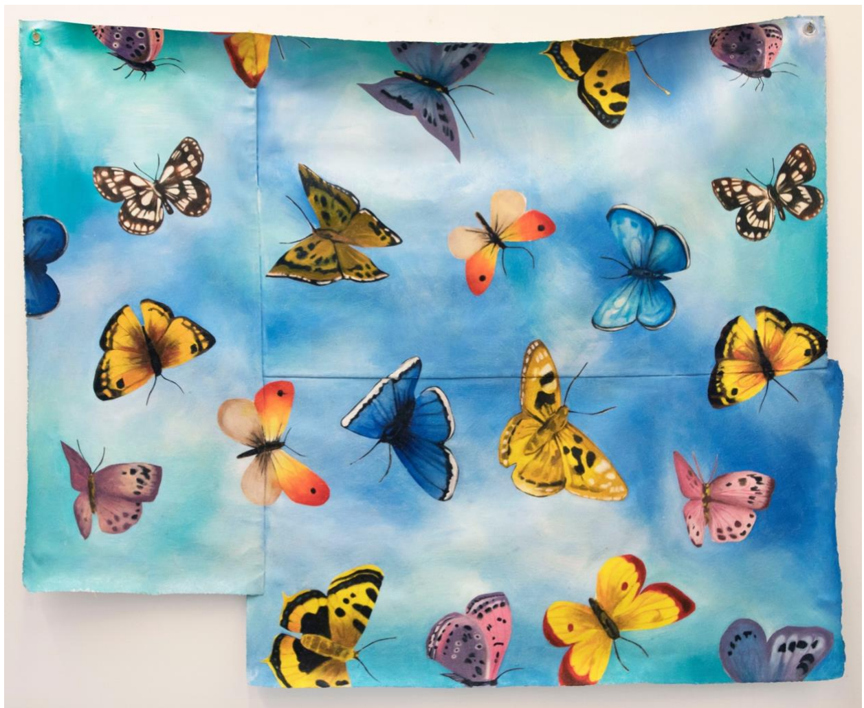
Fig. 3, Gloria , 2021, acrylic on stitched canvas