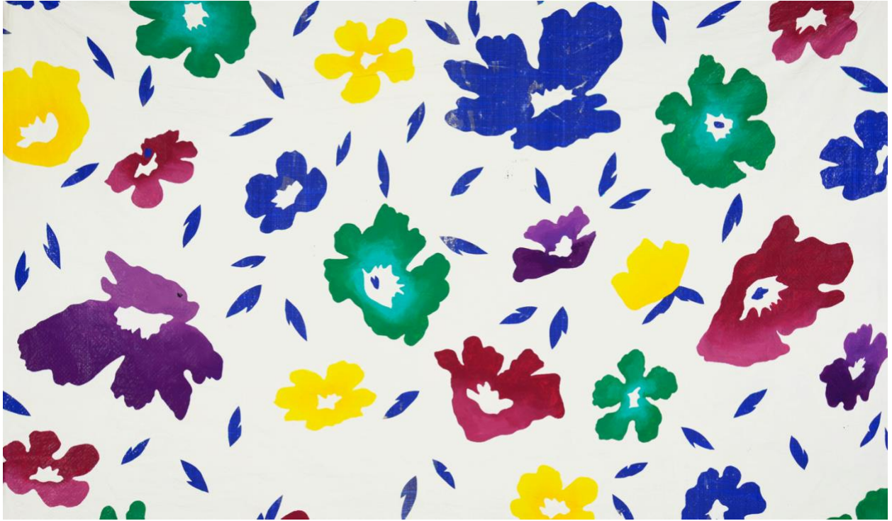
Fig. 11, Labor of Love , 2022, Sam Hamilton, acrylic on distressed tarp