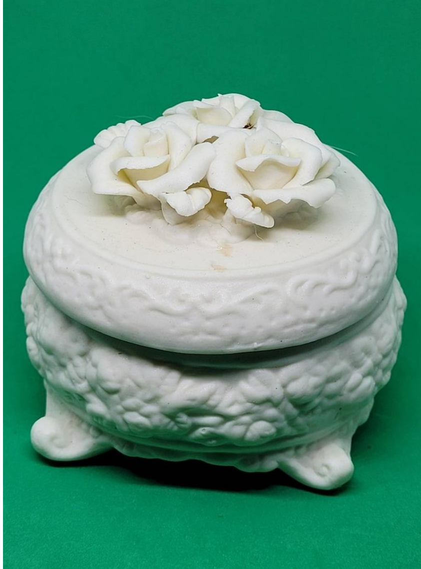
Fig. 14, Jewelry box, porcelain, etsy