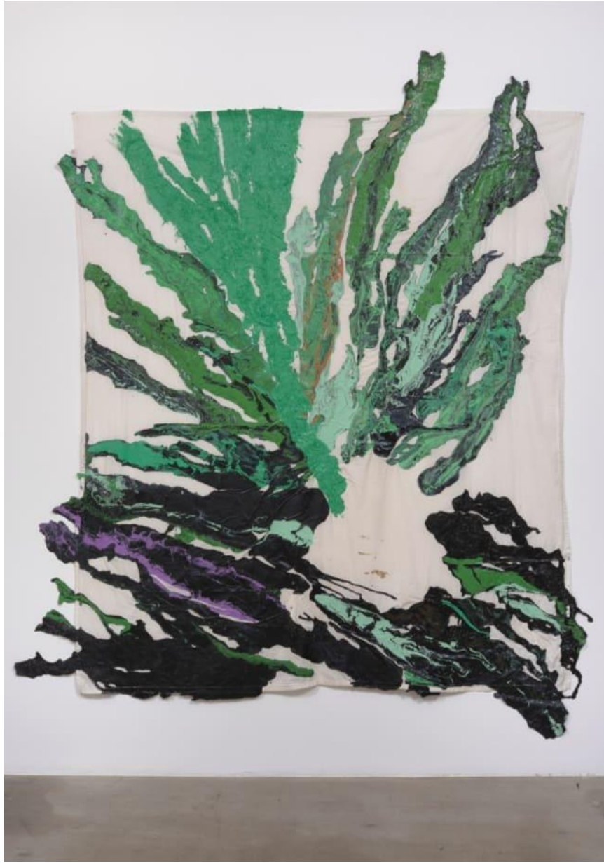
Fig. 4, A seed is a star , 2015, Rodney McMillian, latex on bed sheet