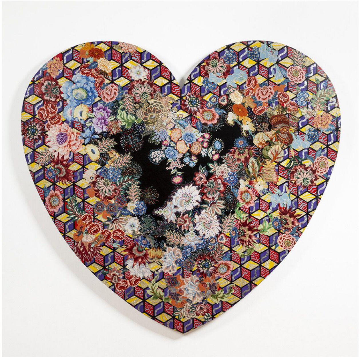
Fig. 12, Heartland , 1985, Miriam Schapiro, acrylic and fabric on canvas