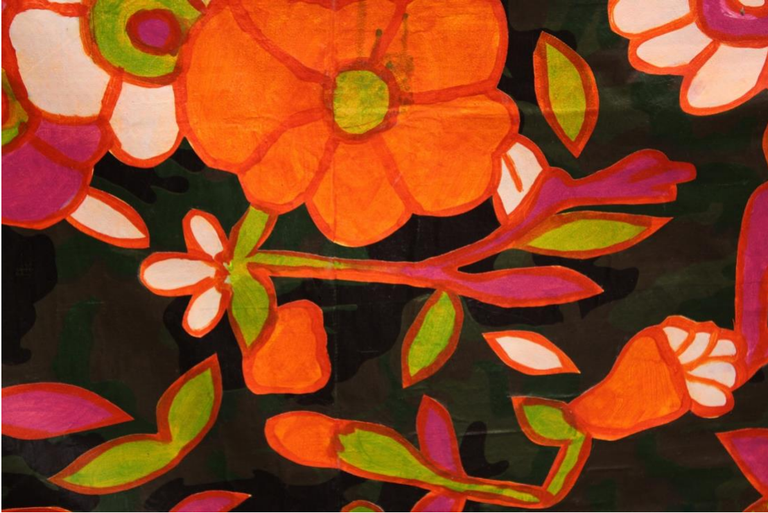
Fig. 17. Detail of Gurl Pwr , 2022, Sam Hamilton, acrylic on new tarp