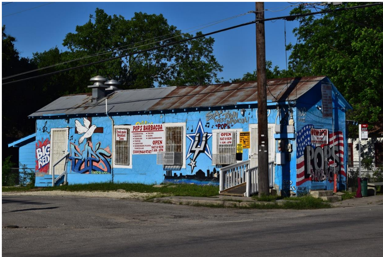
Fig. 1, Pop's Barbacoa, 1100 Ruiz Street, San Antonio Texas, 2021, Photograph by Kathryn E. O'Rourke