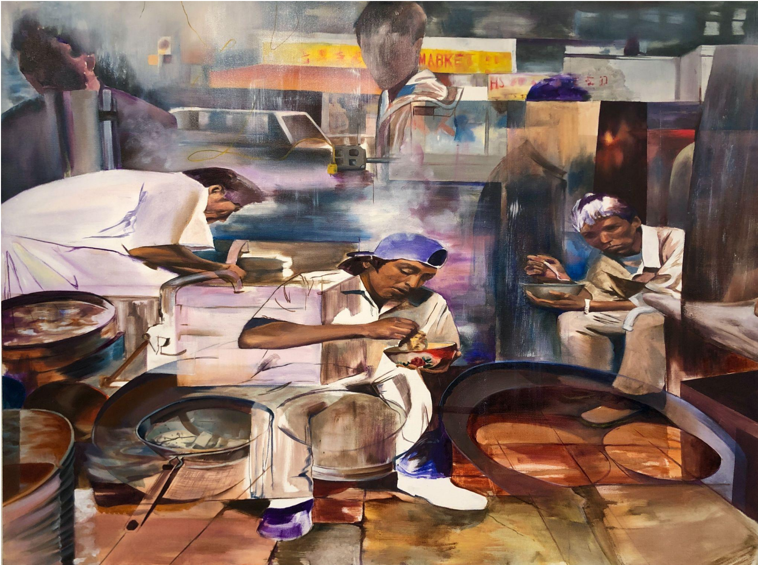
Figure 1: Worker