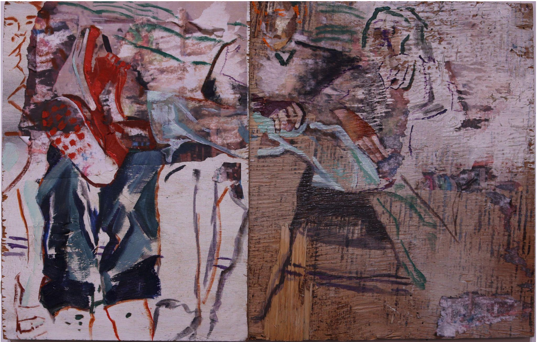
Figure 3: Como se dice? Kikin' it