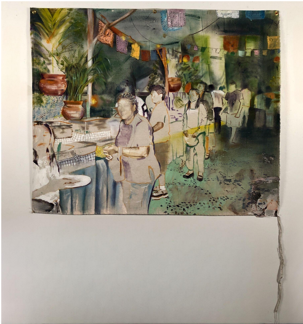
Figure 4: Remnants