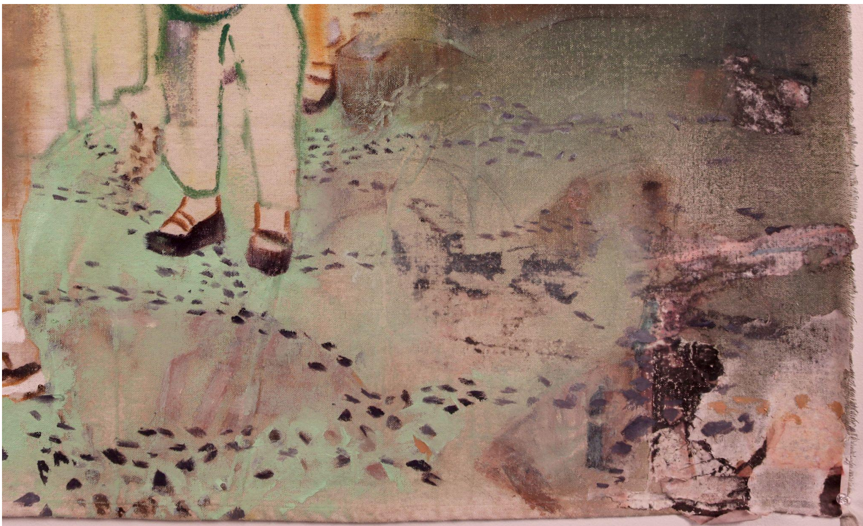
Figure 5: Remnants (Detail)