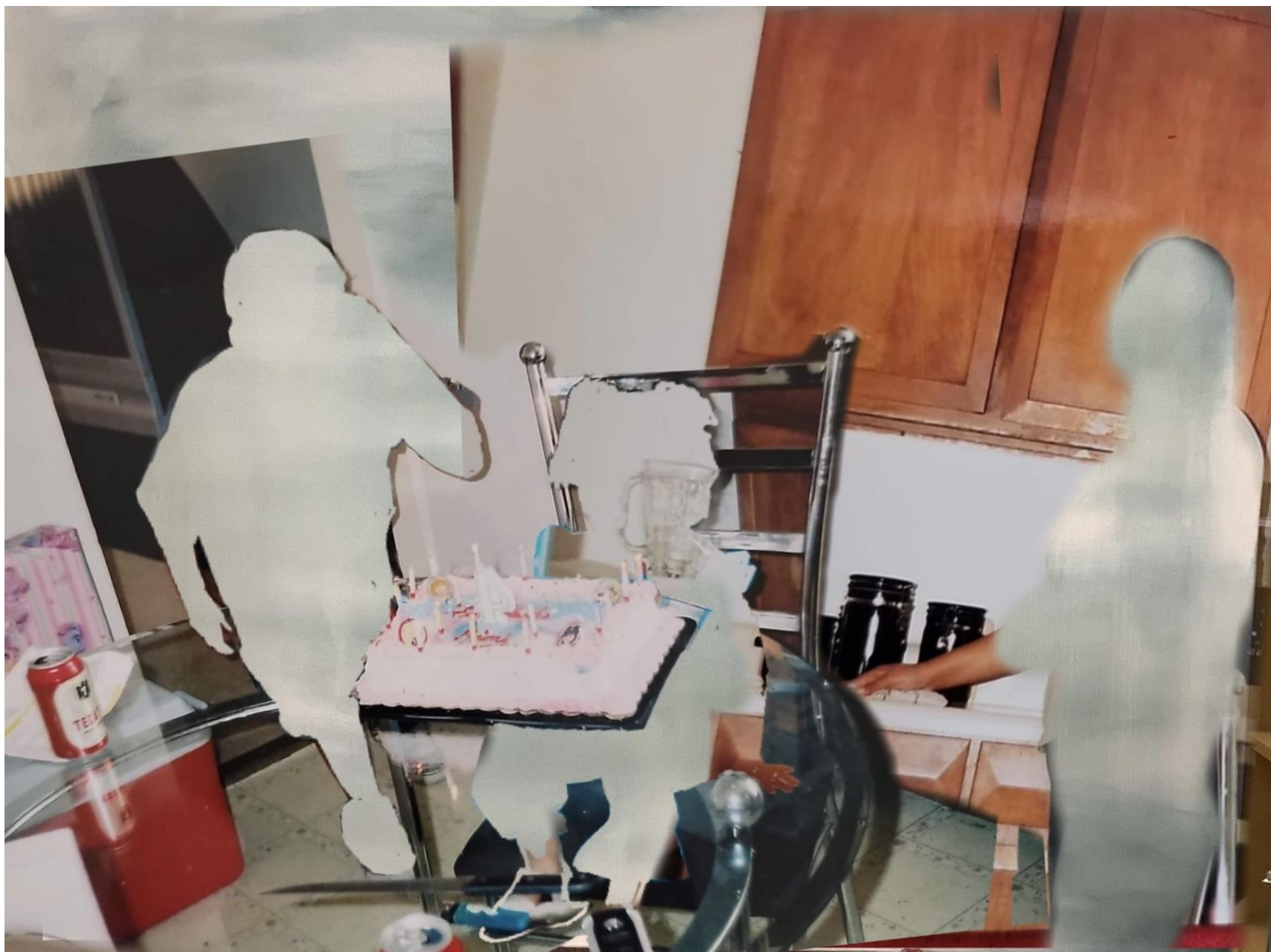
Figure 8: 4th Birthday