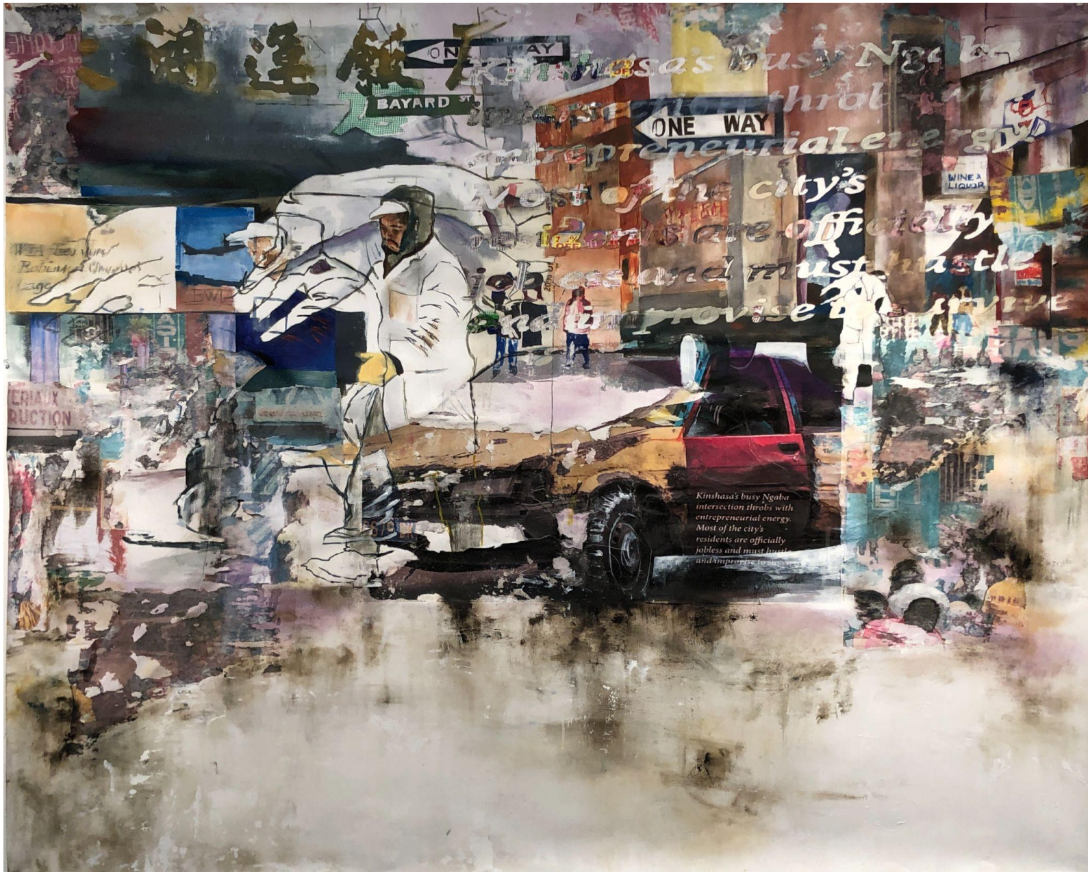
Figure 2: Spur of the moment