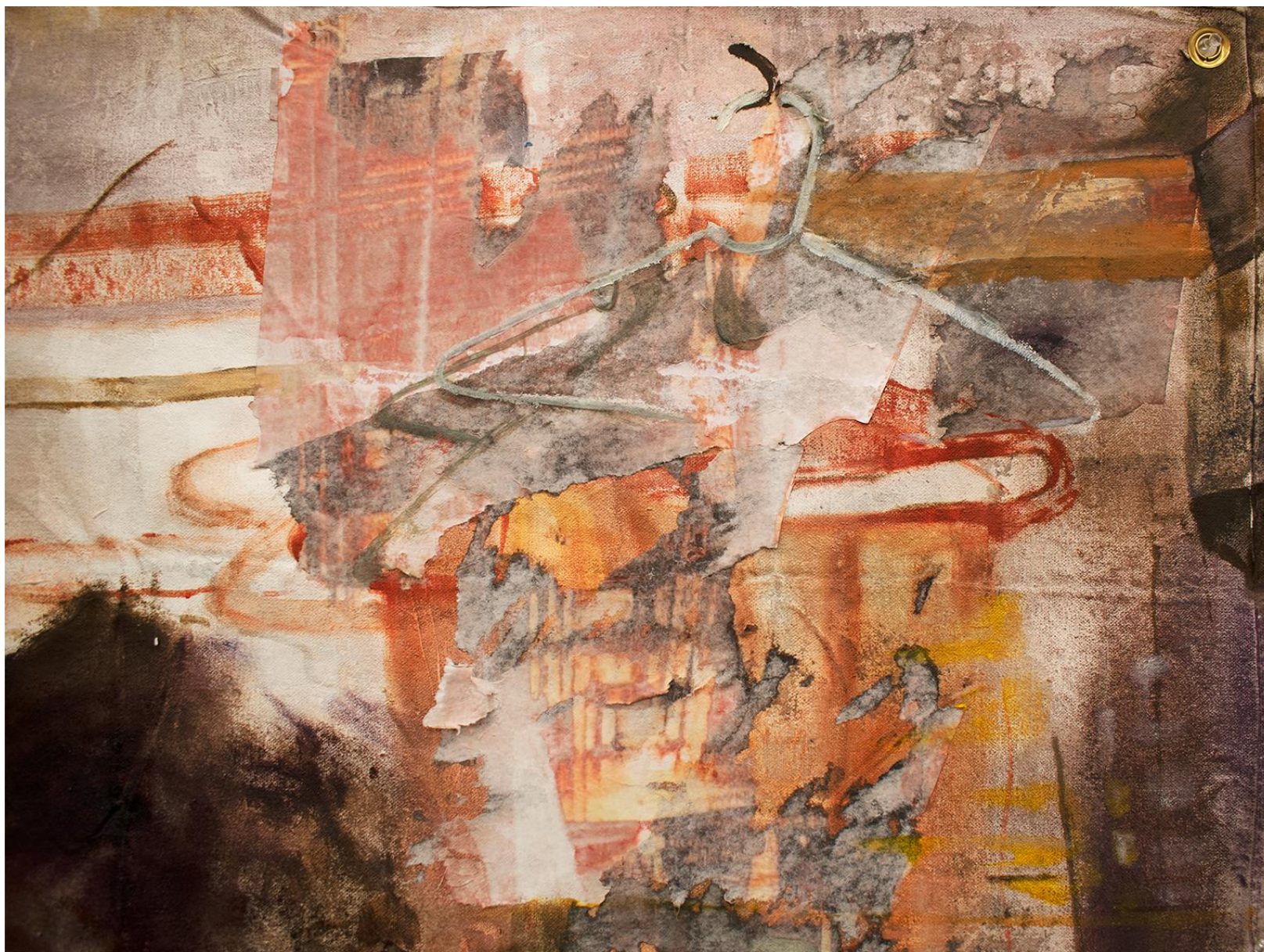
Figure 7: Workers - Serie 2 (Detail)