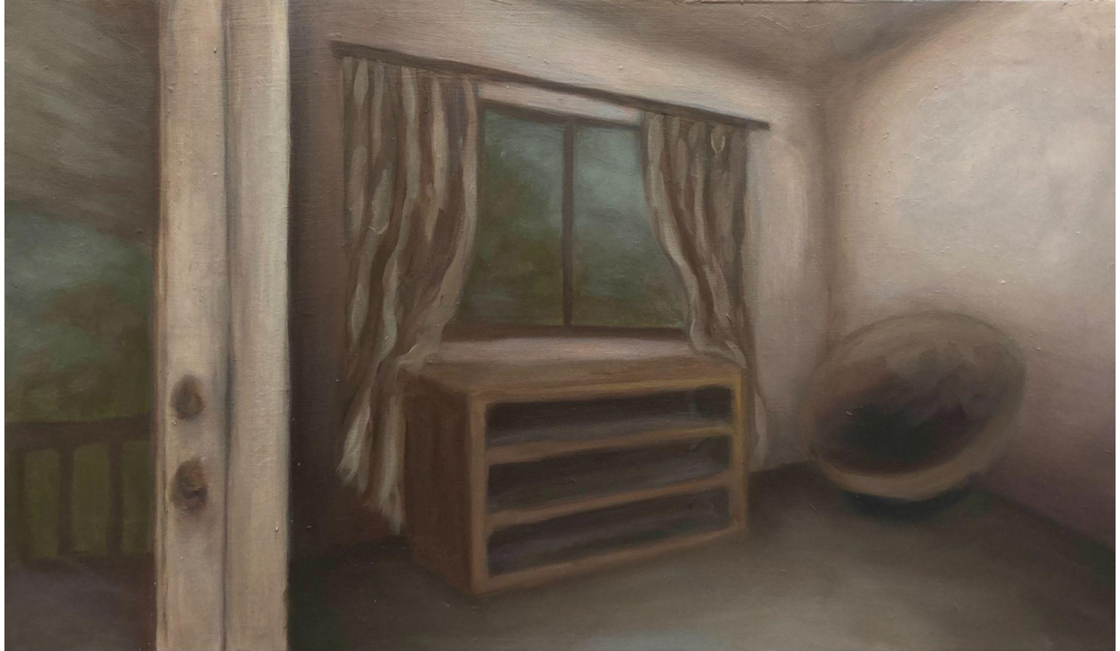
Figure 9: Elise