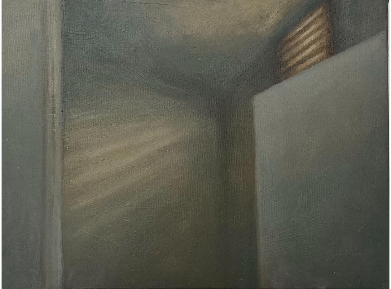
Figure 10: Exit Wound