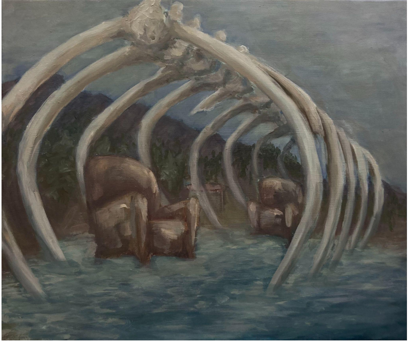
Figure 8: Ribcage (Int.)