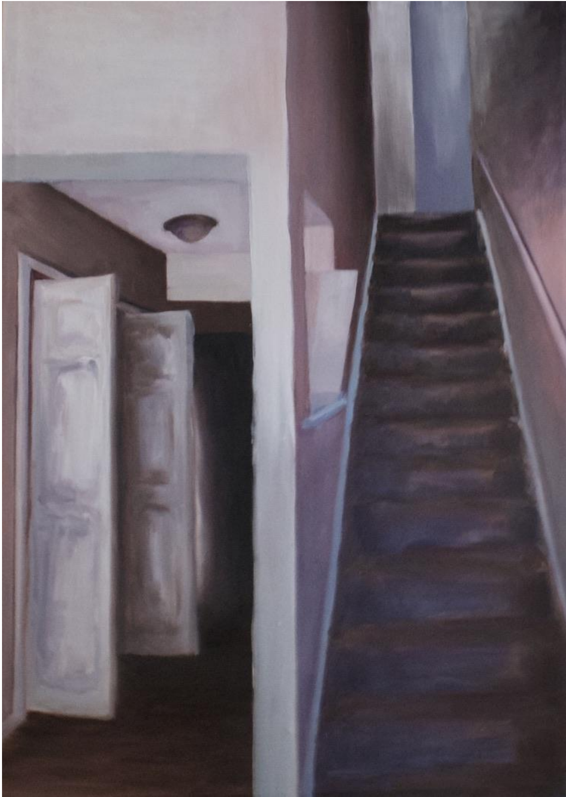
Figure 5: In the Hallway