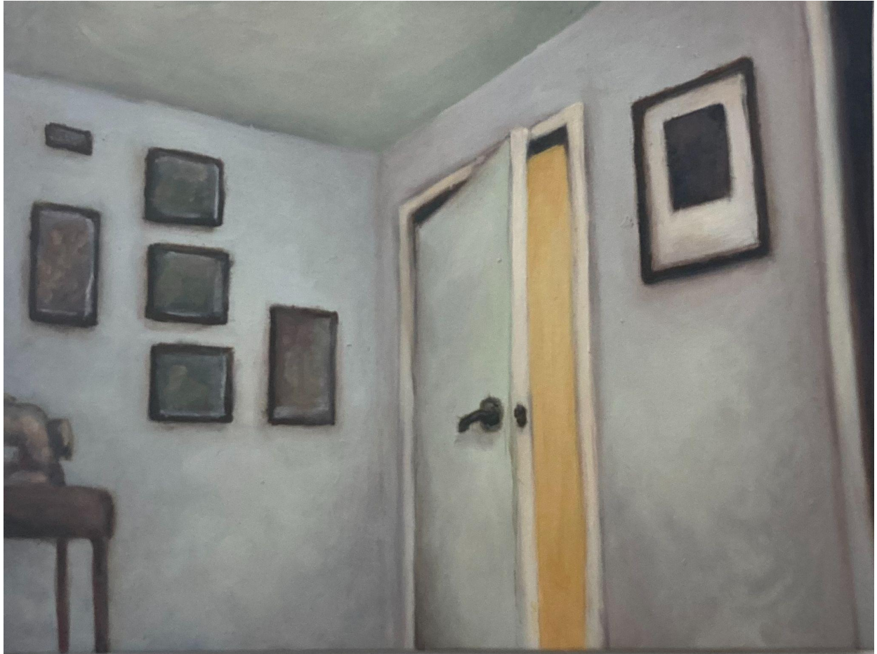
Figure 7: Incandescent