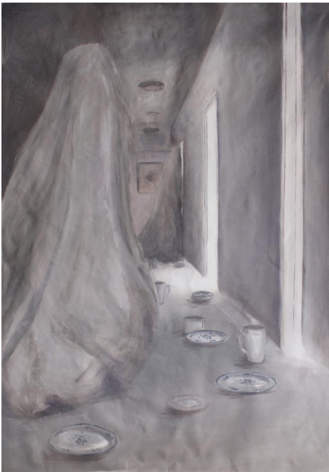
Figure 4: The Old Wing