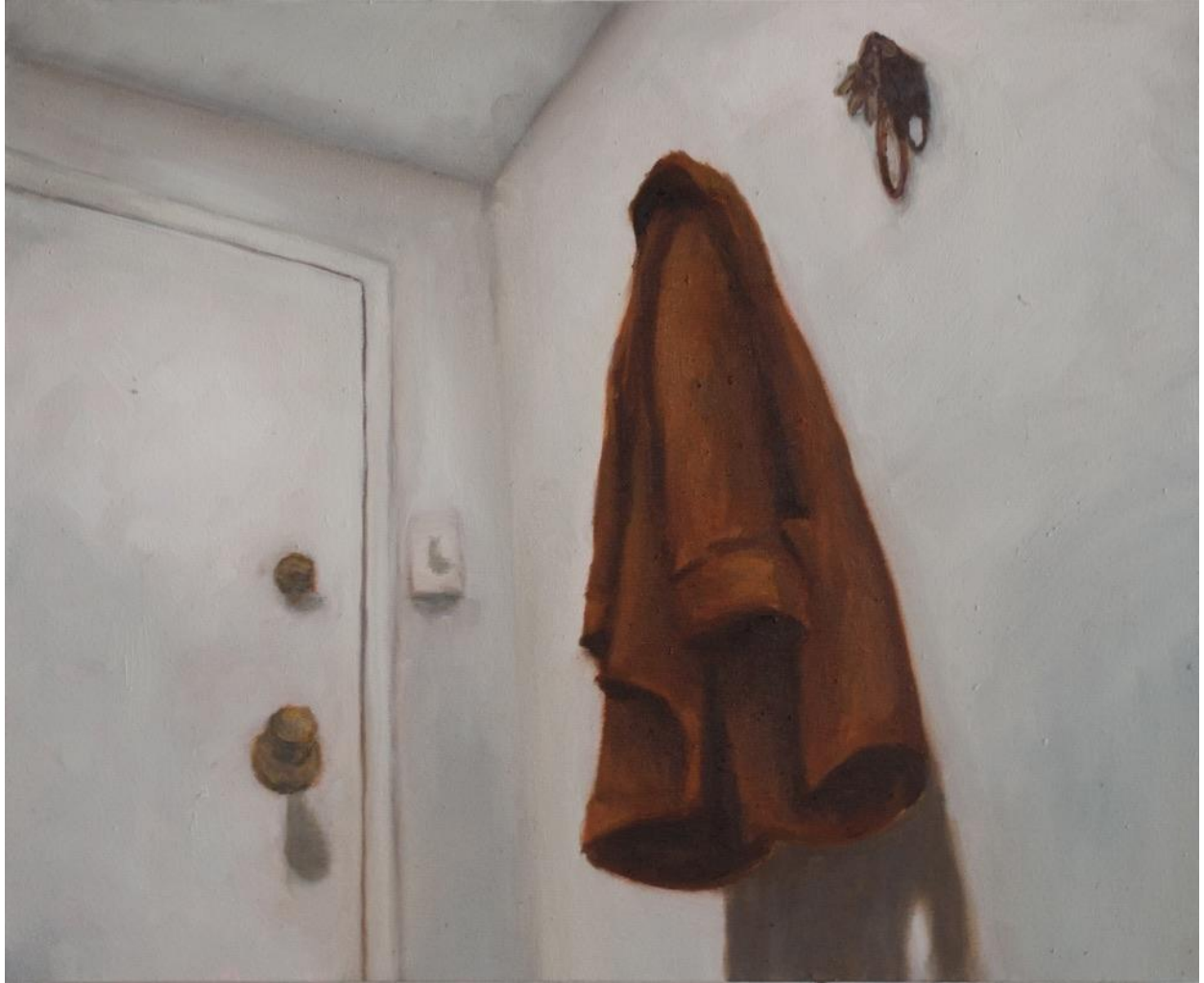
Figure 3: Guidelines