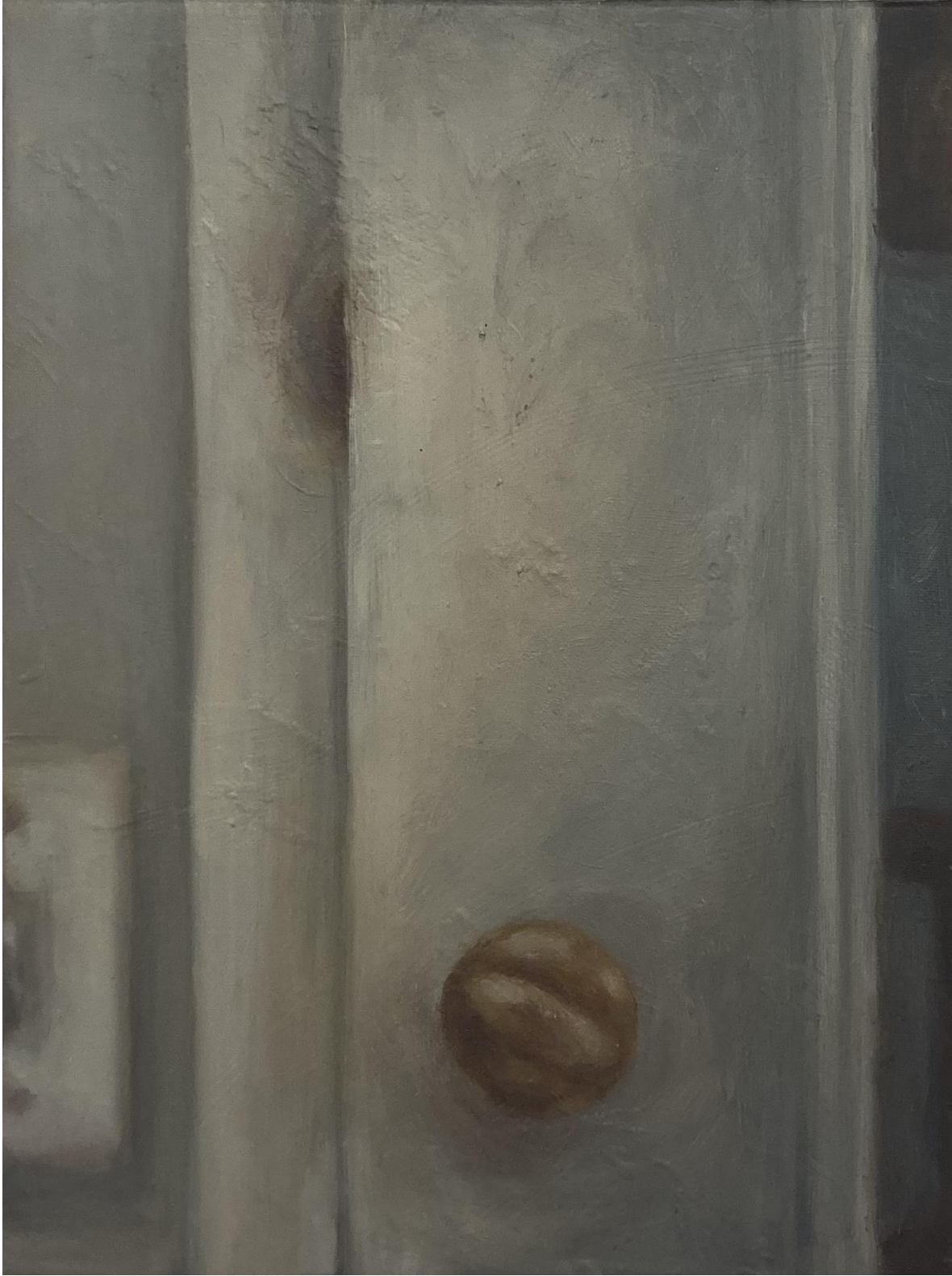
Figure 11: Peripheral