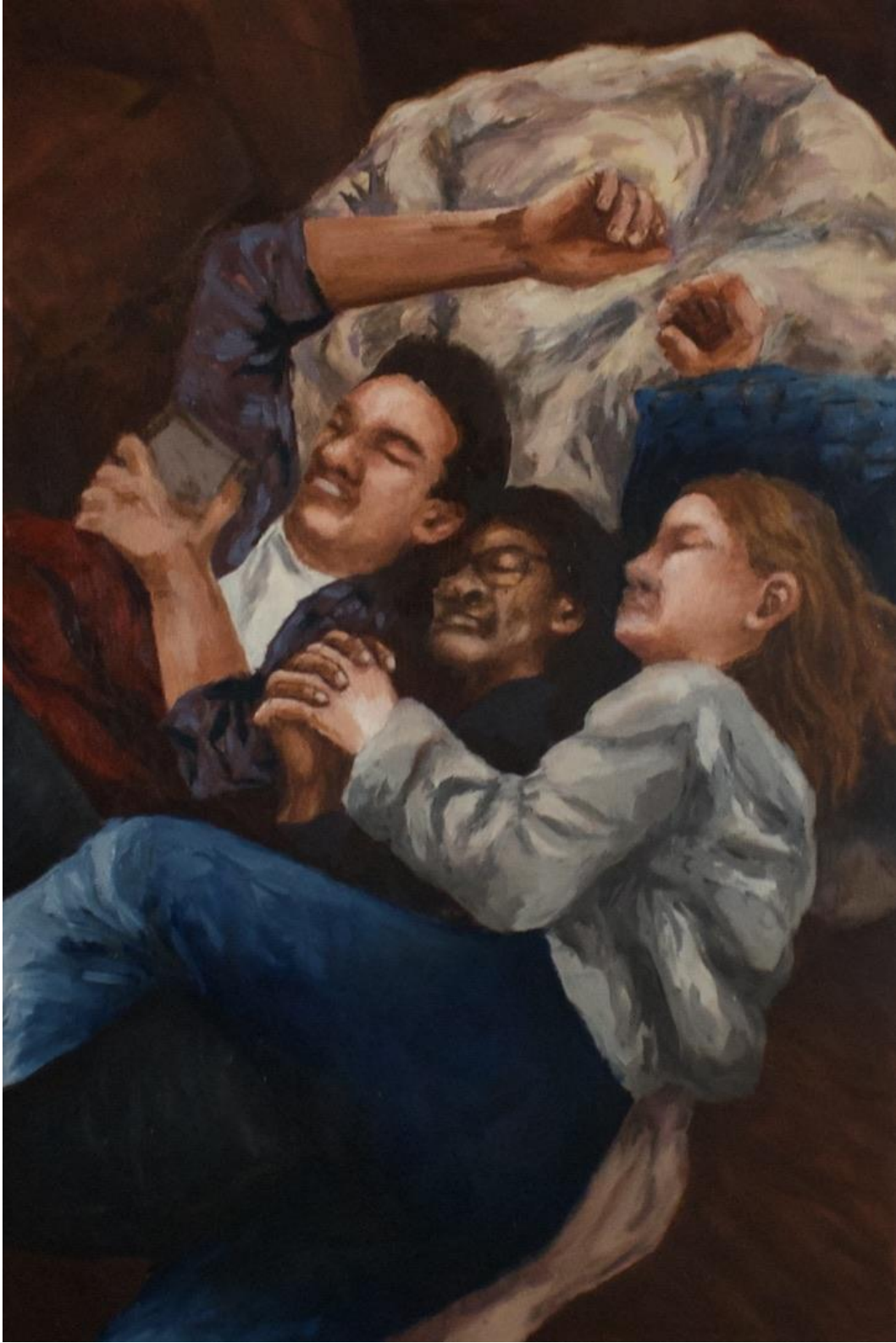
Figure 2: February