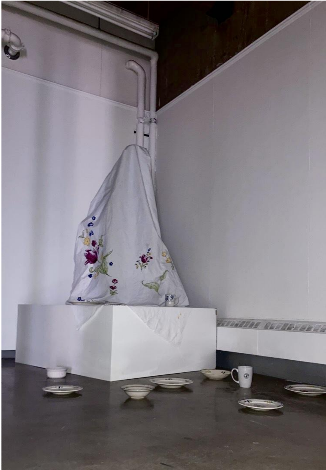
Figure 6: The Old Wing (Installation 2)