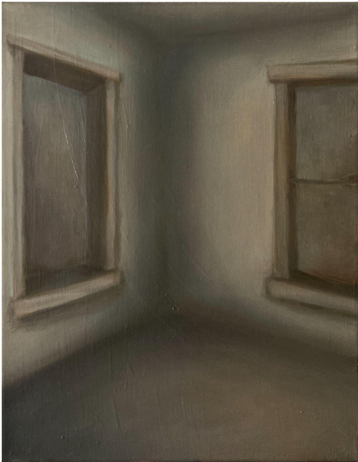
Figure 12: Mediator