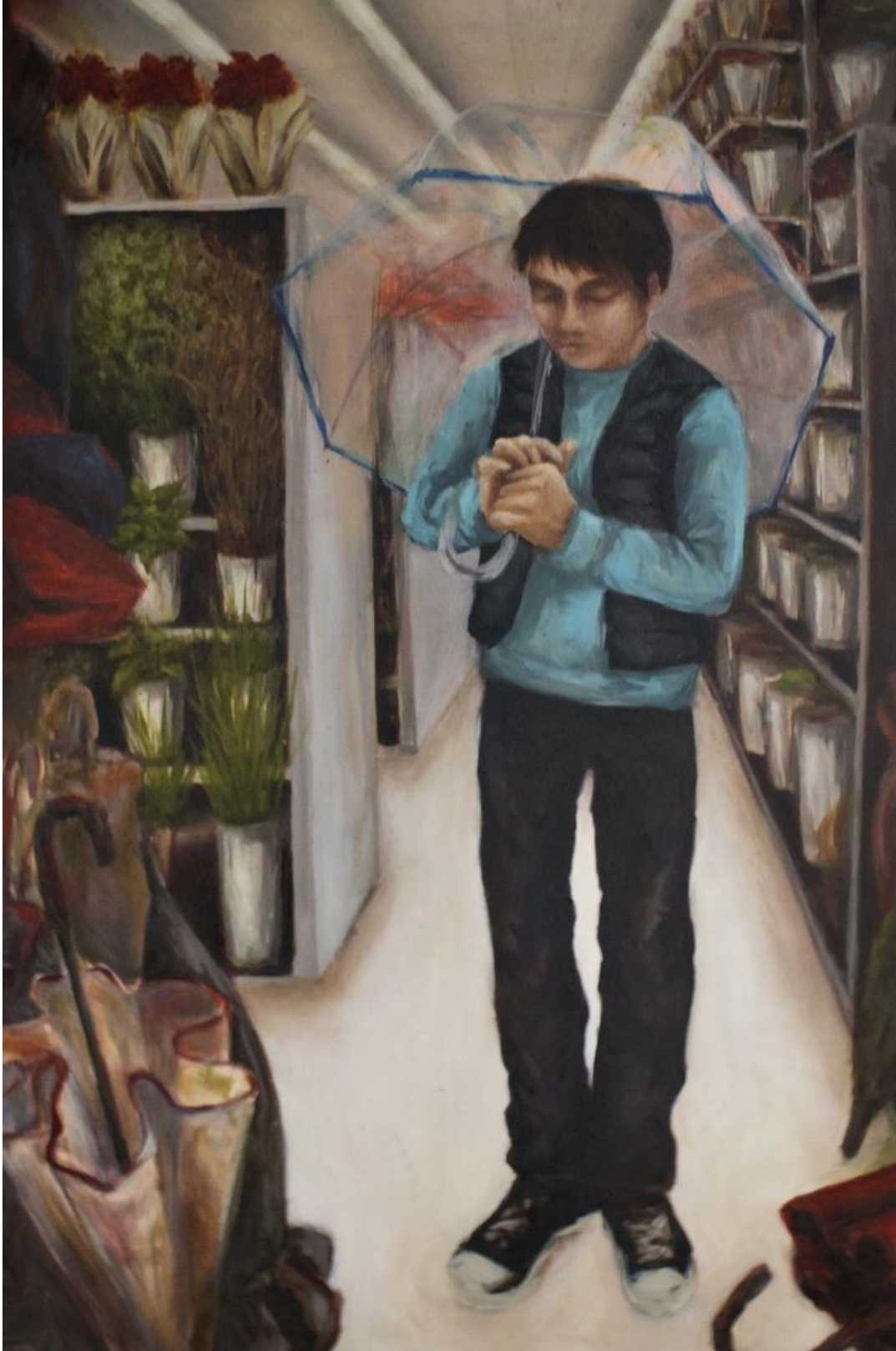
Figure 1: Umbrella