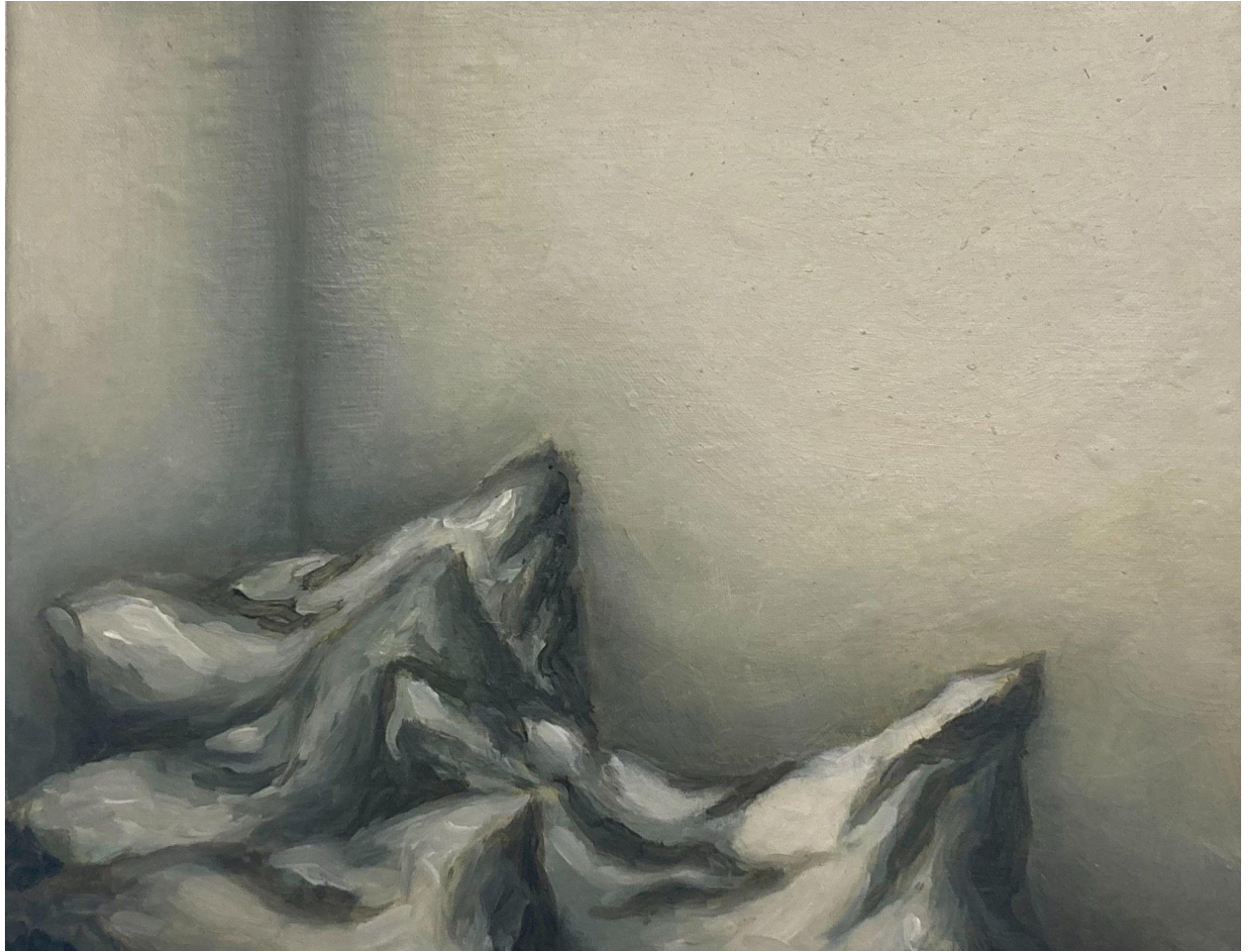
Figure 14: Limited Capacity