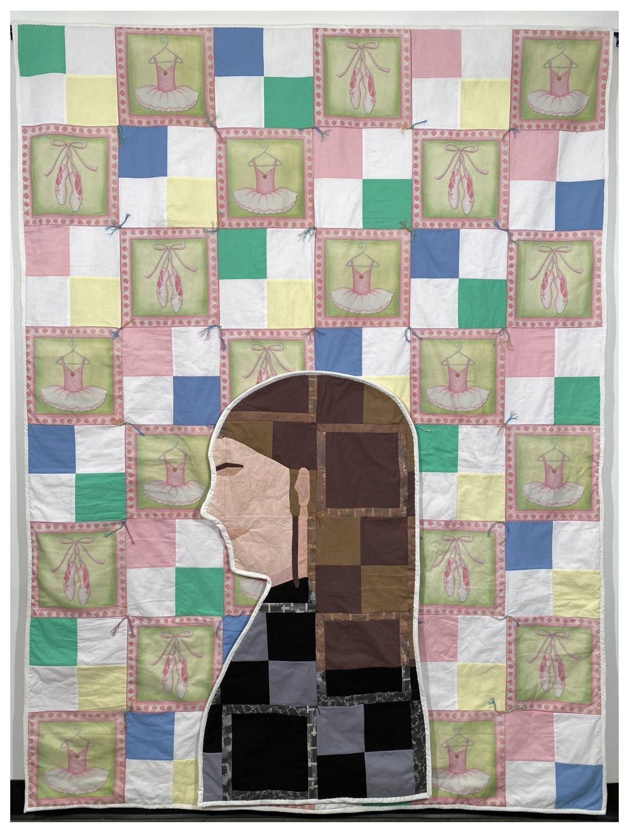
Figure 3: Past