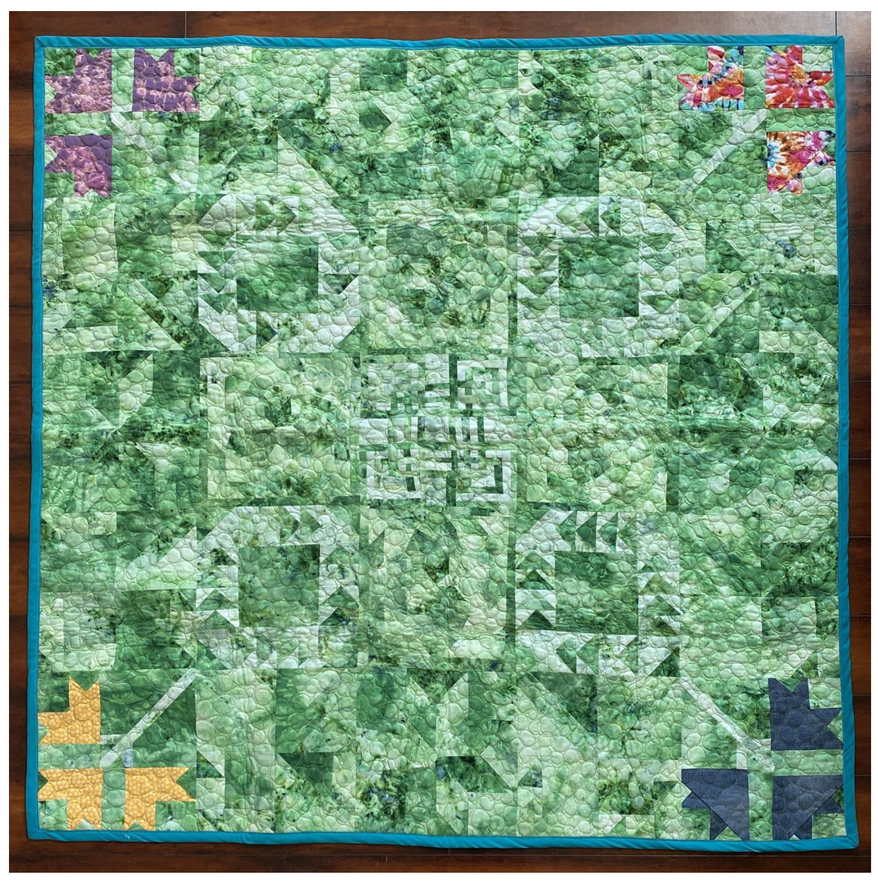
Figure 1: Construct and Deconstruct