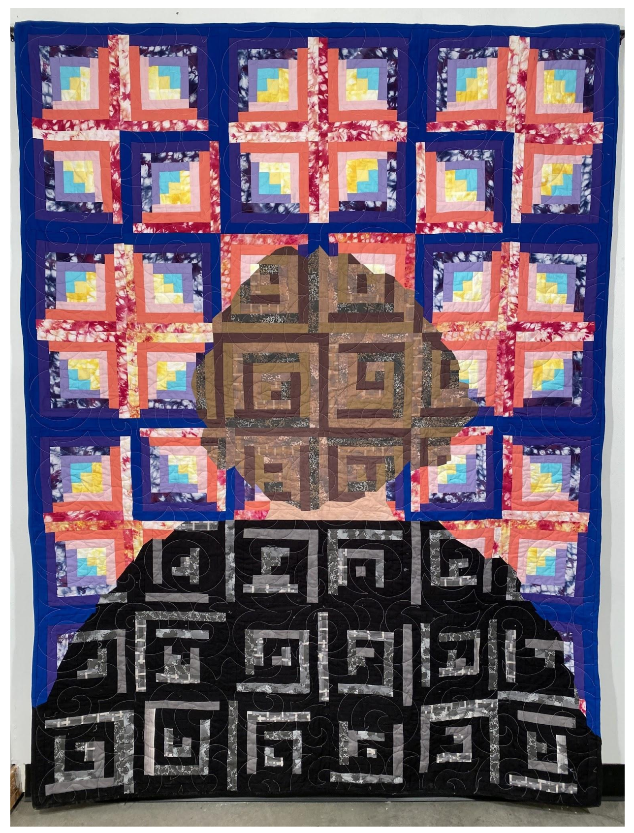
Figure 4: Present