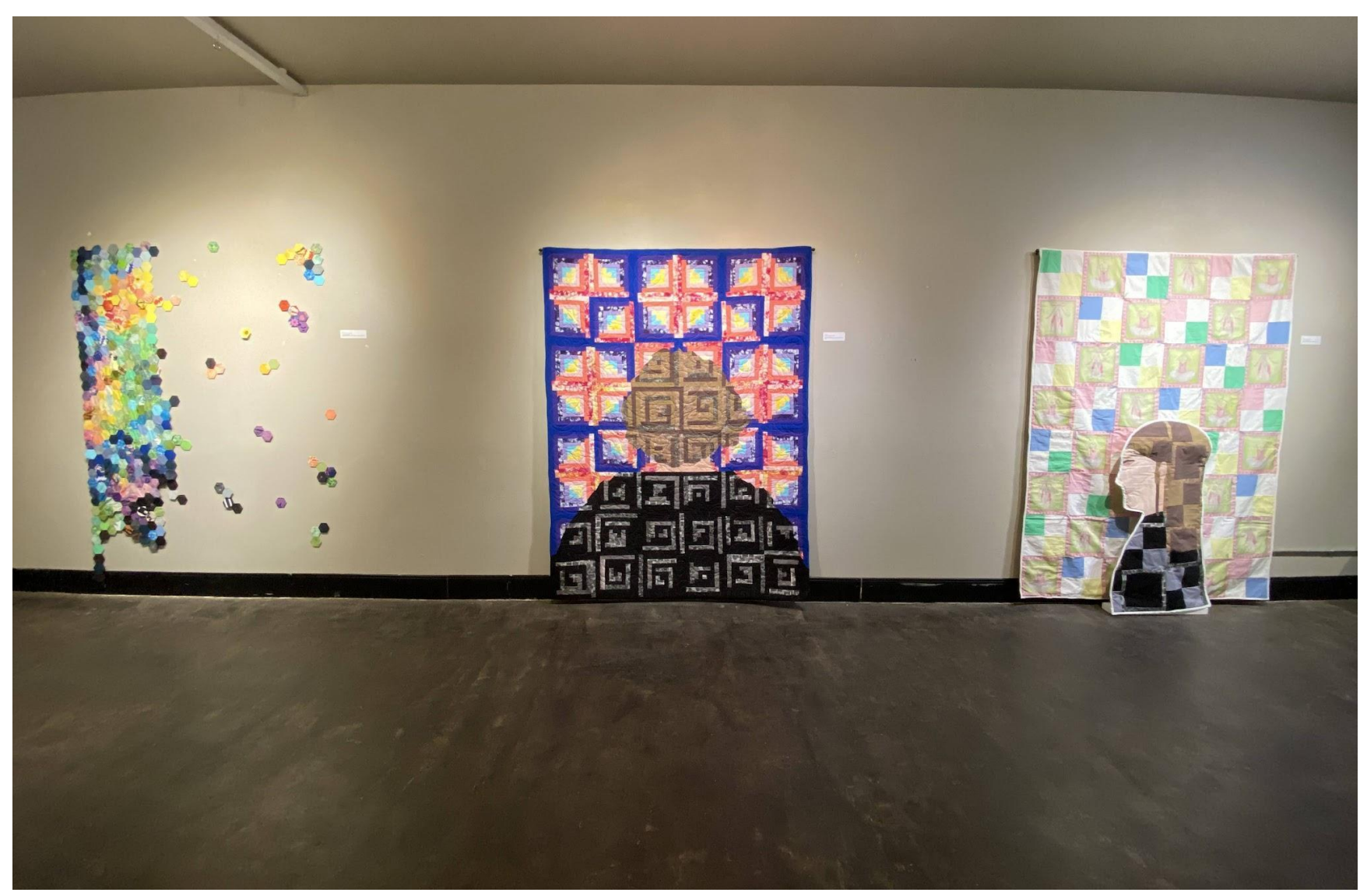
Figure 6: Past, Present, Future (Series)