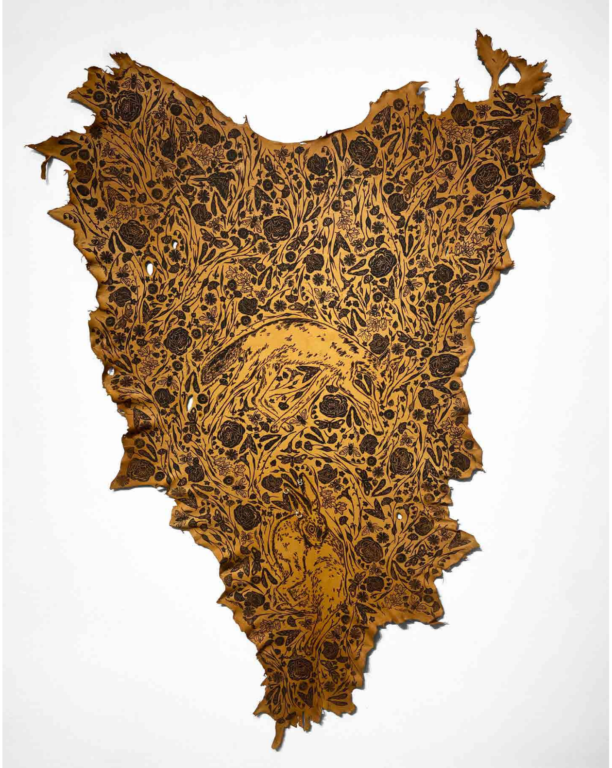
Figure 7: The Rabbit and the Coyote