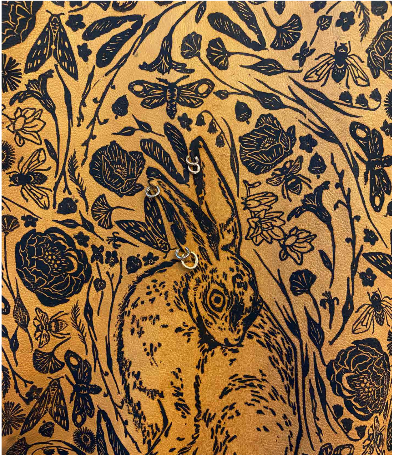
Figure 9: The Rabbit and the Coyote (detail)