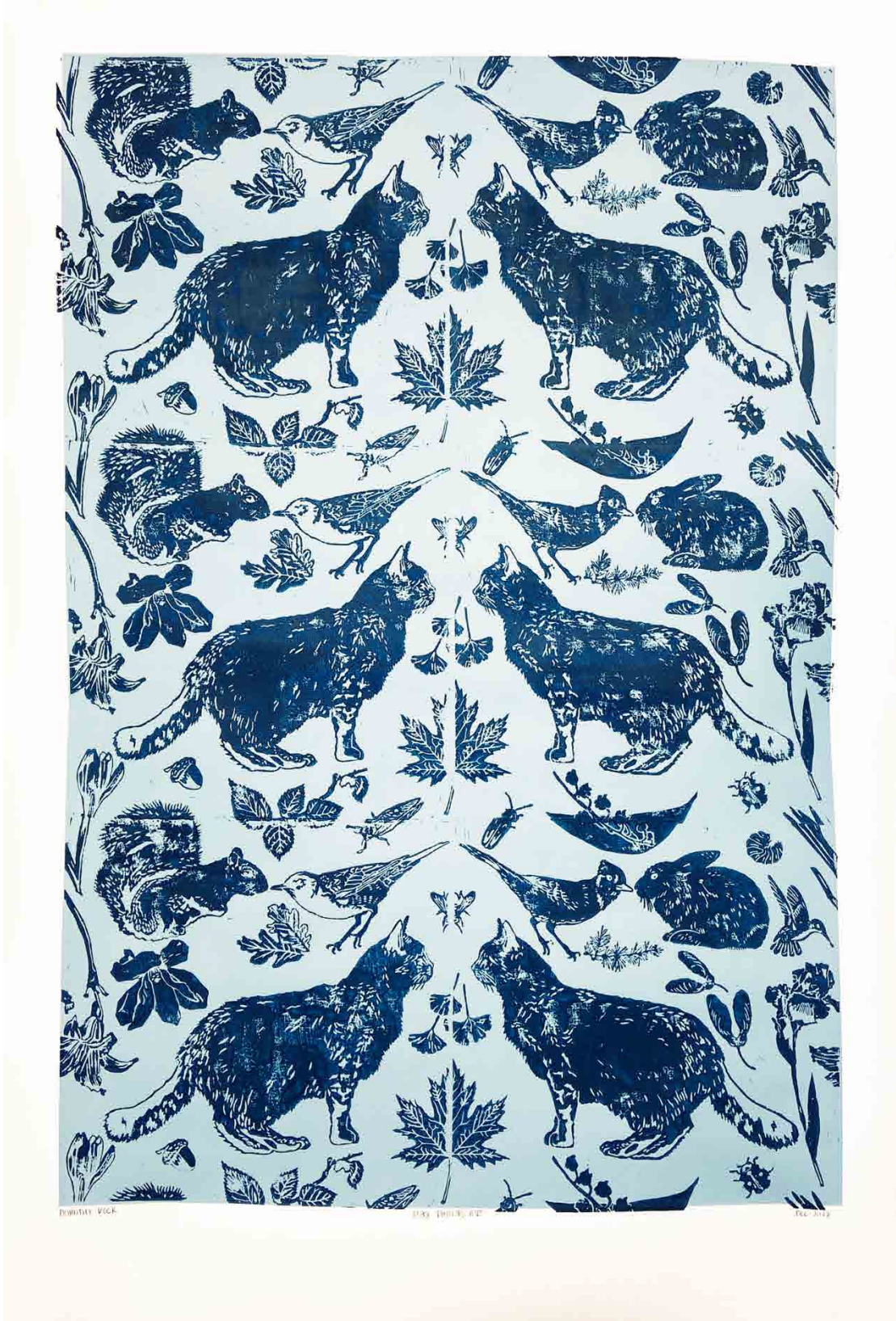
Figure 3: Home: Blue Spruce