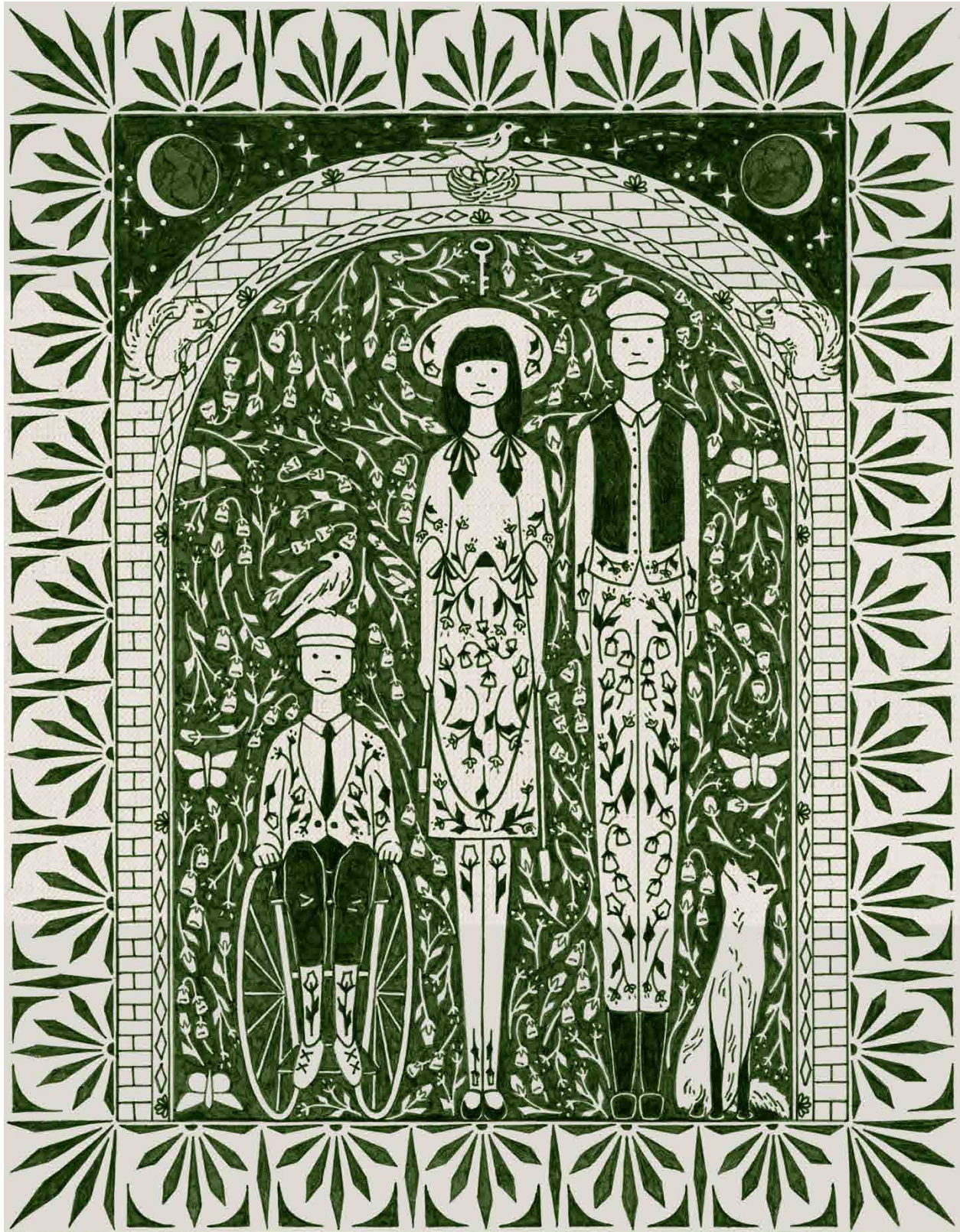
Figure 4: The Secret Garden