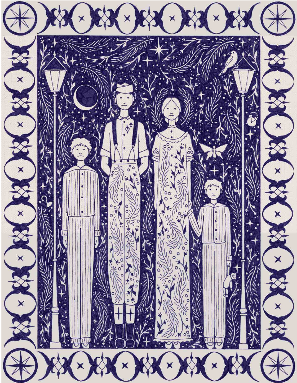
Figure 5: Peter Pan and Wendy