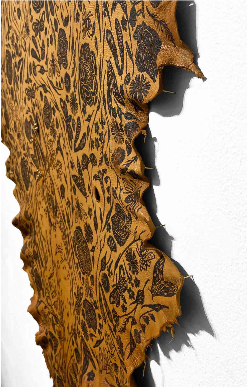
Figure 8: The Rabbit and the Coyote (detail)