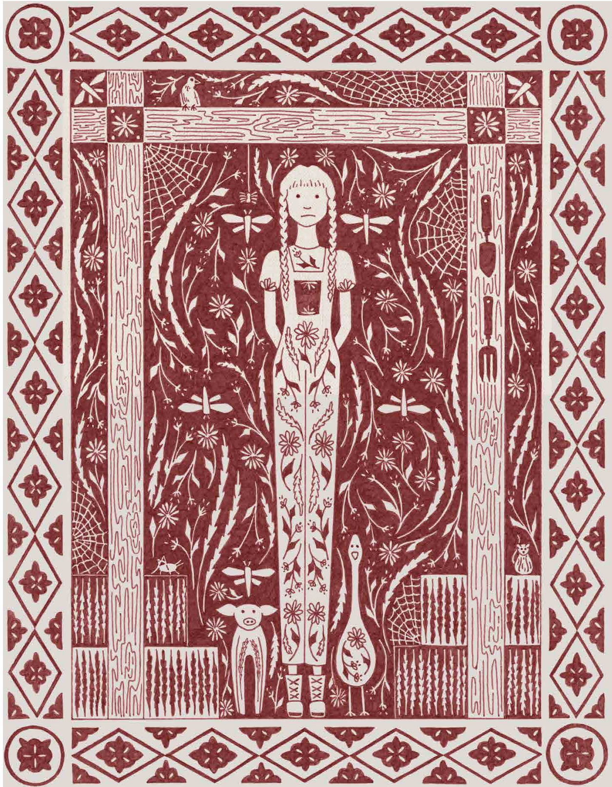
Figure 6: Charlotte's Web