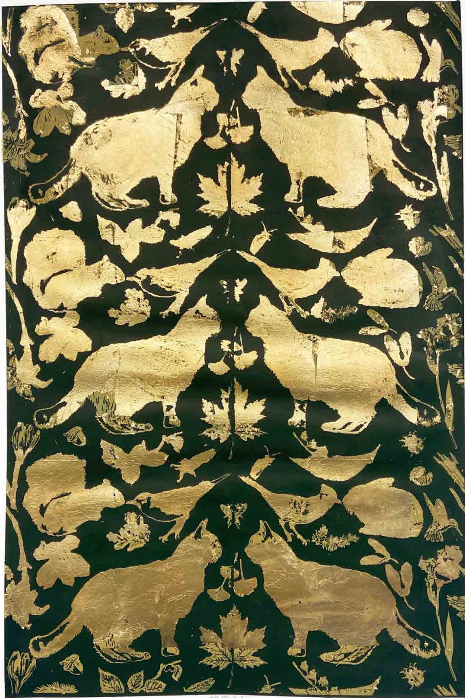
Figure 2: Home: Aspen and Oak