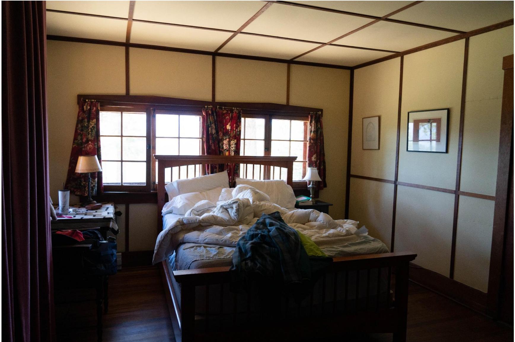
Figure 11: The Ryan Home