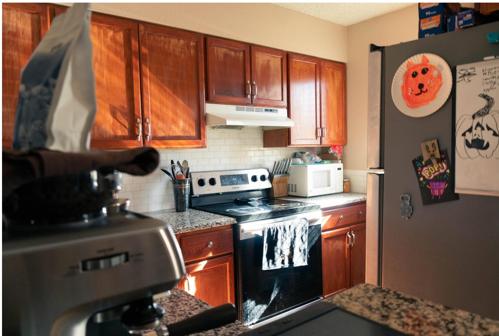
Figure 12: The Thomas Home