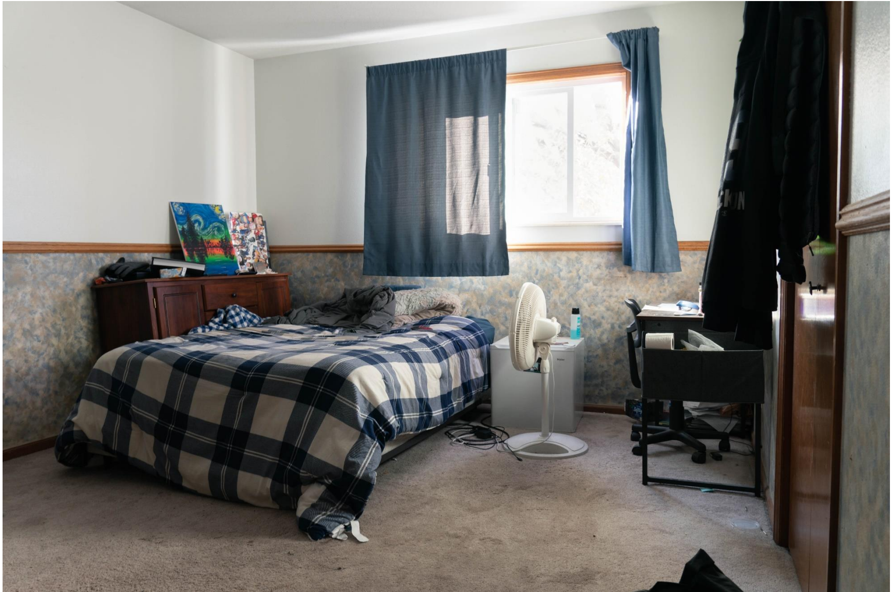
Figure 14: The Davis Home