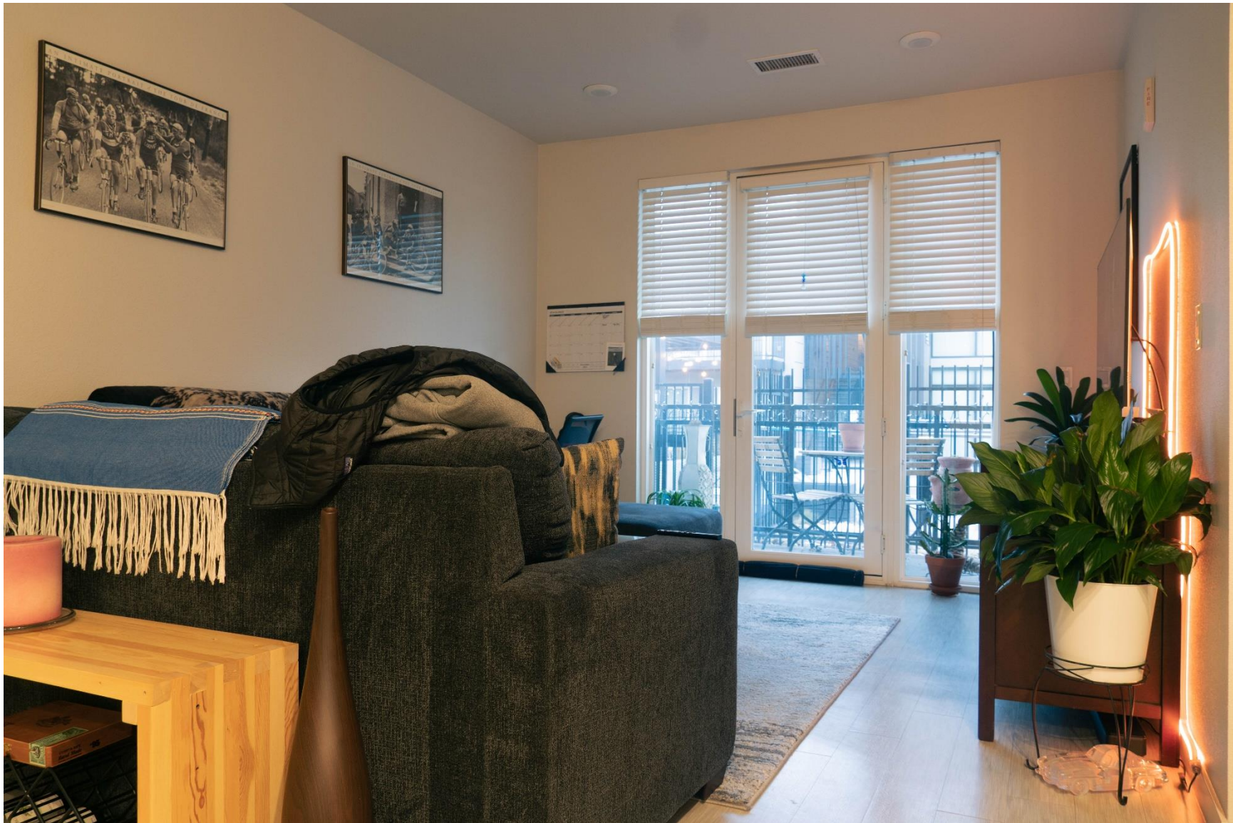
Figure 13: The Jackson Home