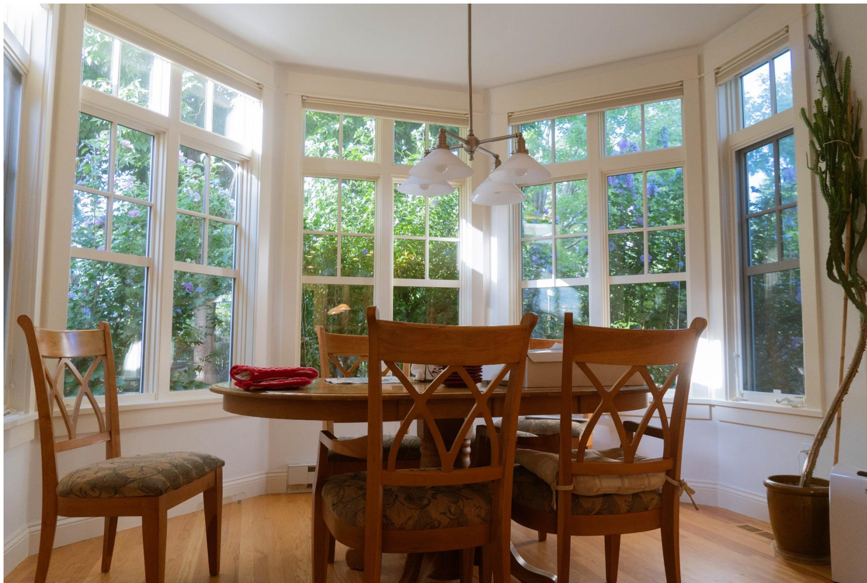
Figure 8: The Brown Home