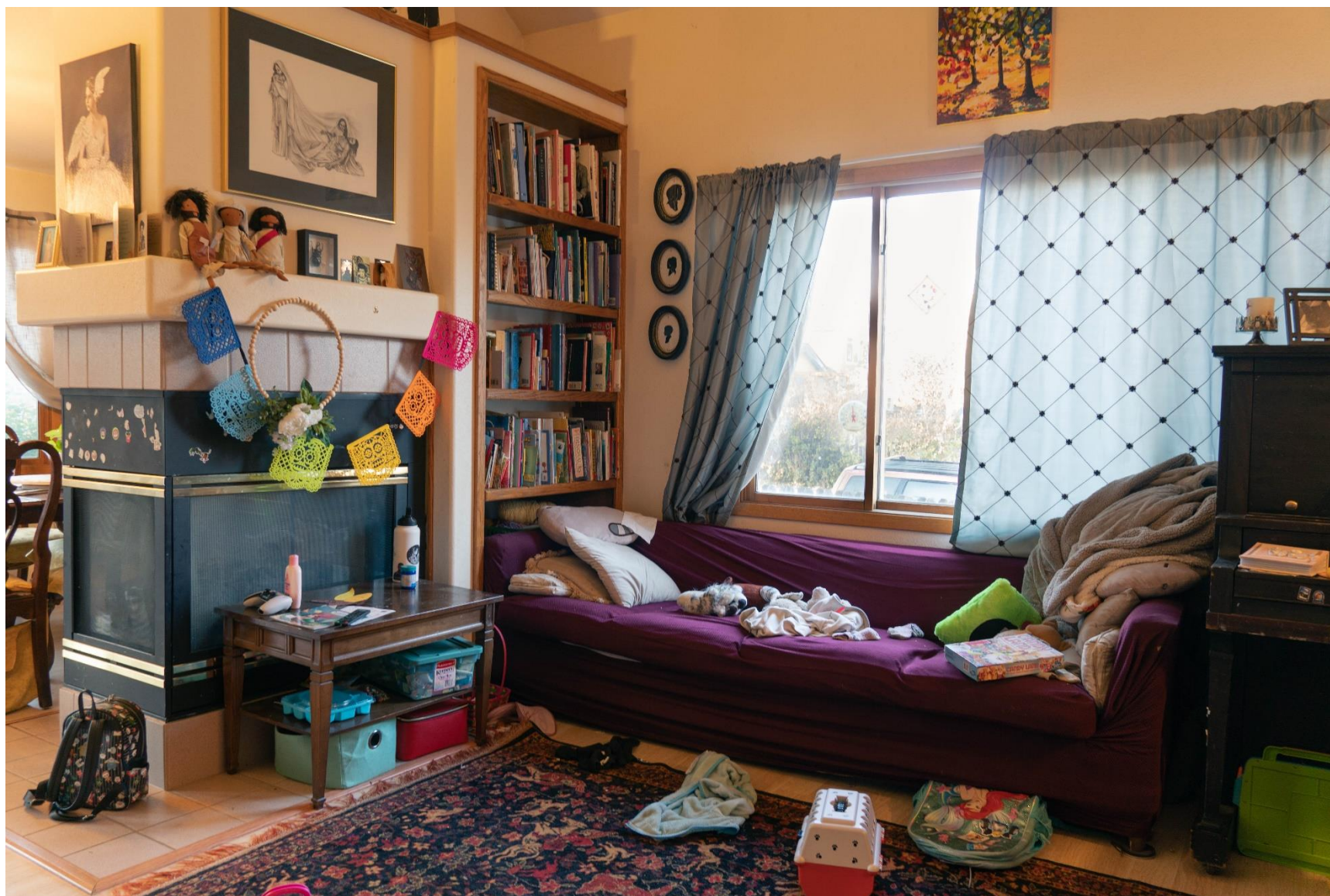
Figure 6: The Martinez Home