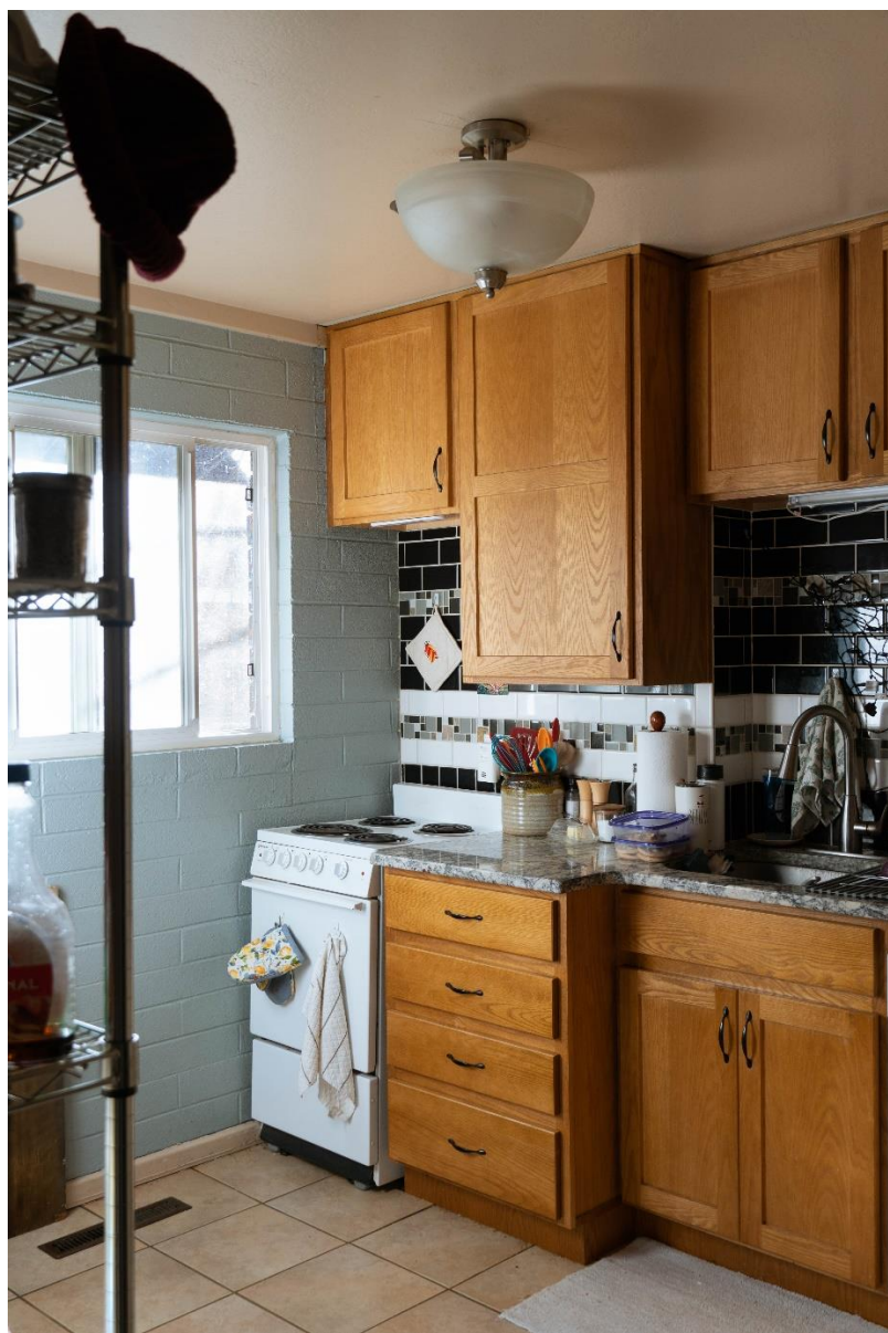
Figure 2: The Williams Home