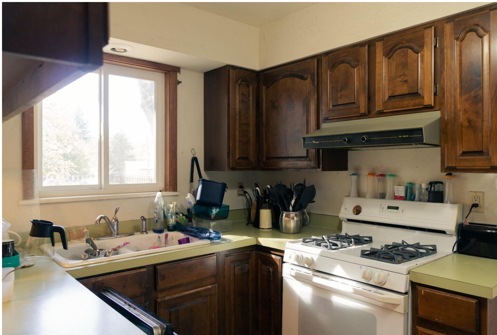
Figure 9: The Lewis Home