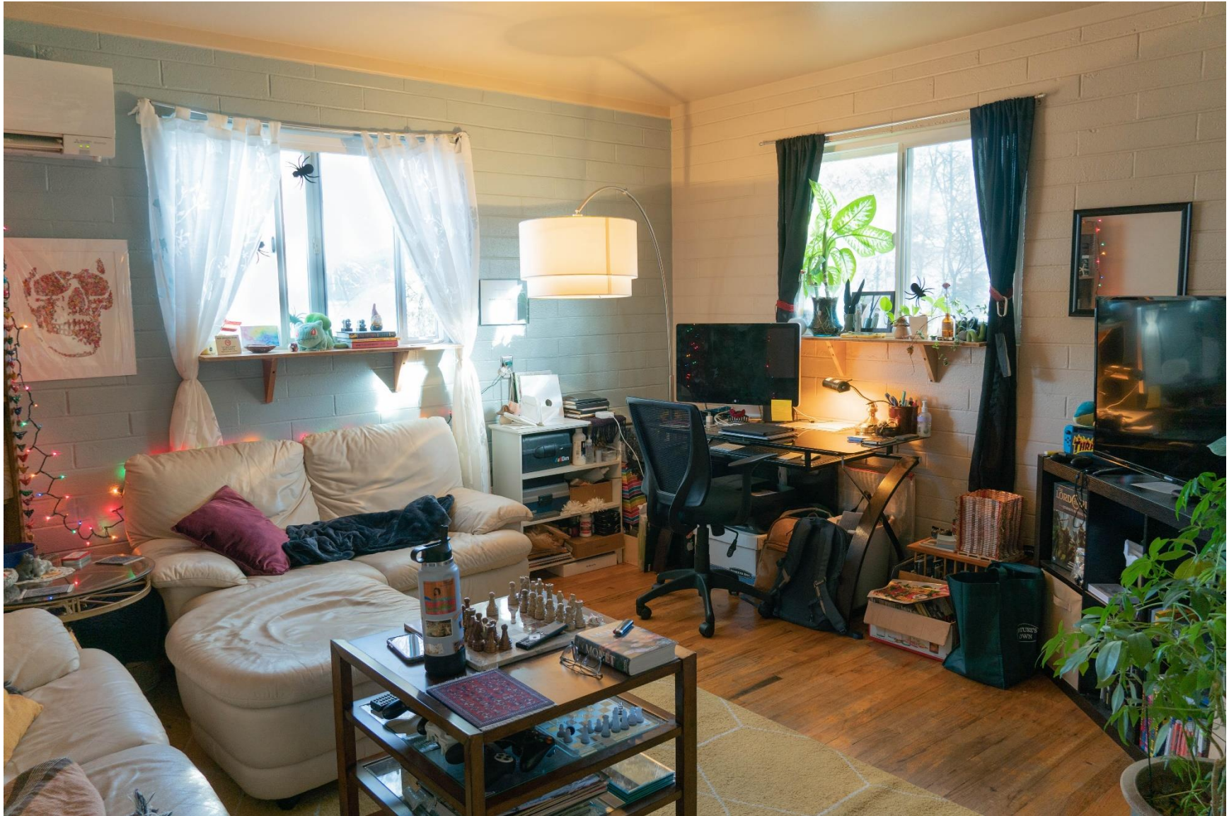
Figure 5: The Smith Home