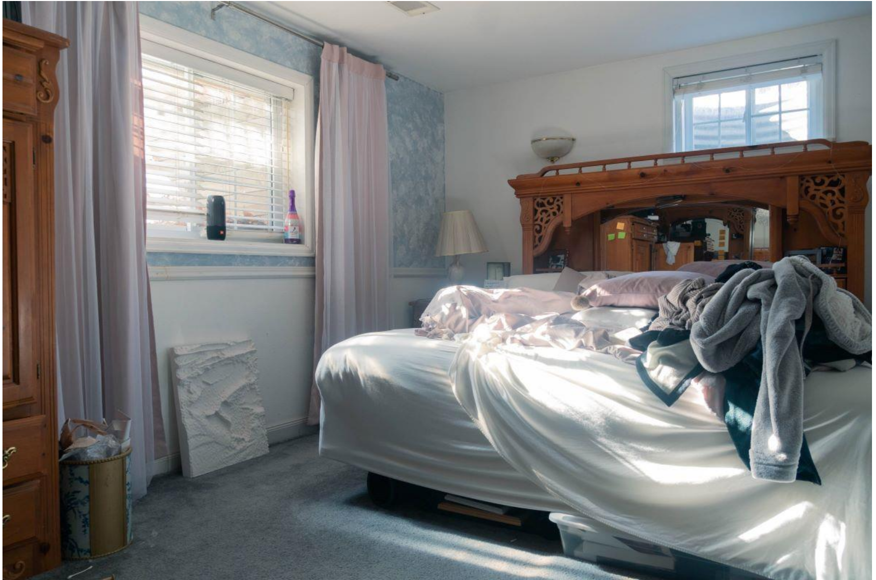
Figure 7: The Jones Home