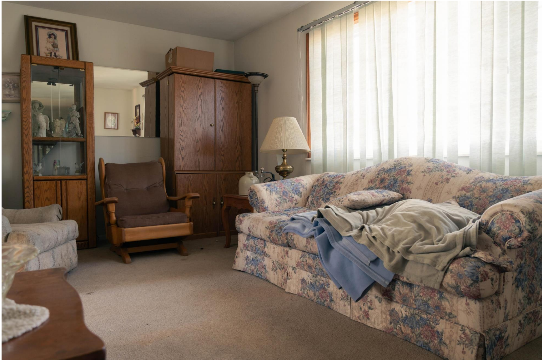
Figure 15: The Martin Home