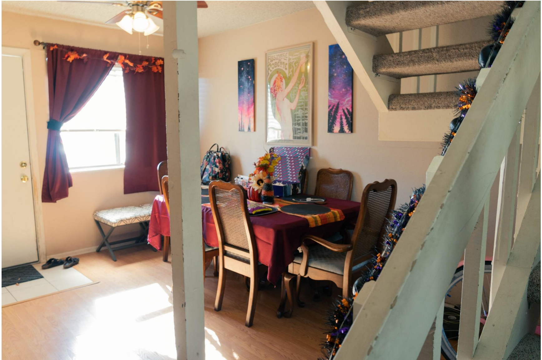
Figure 10: The Garcia Home