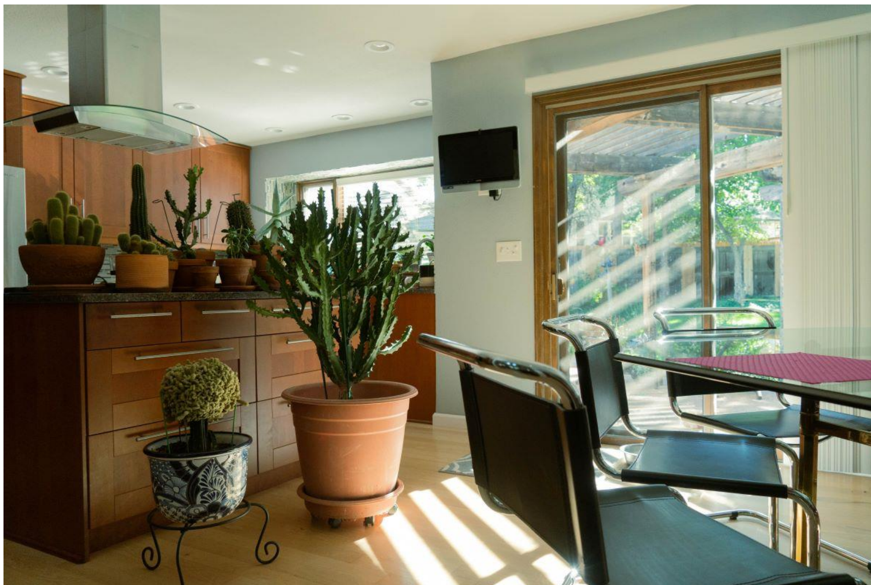
Figure 4: The Miller Home