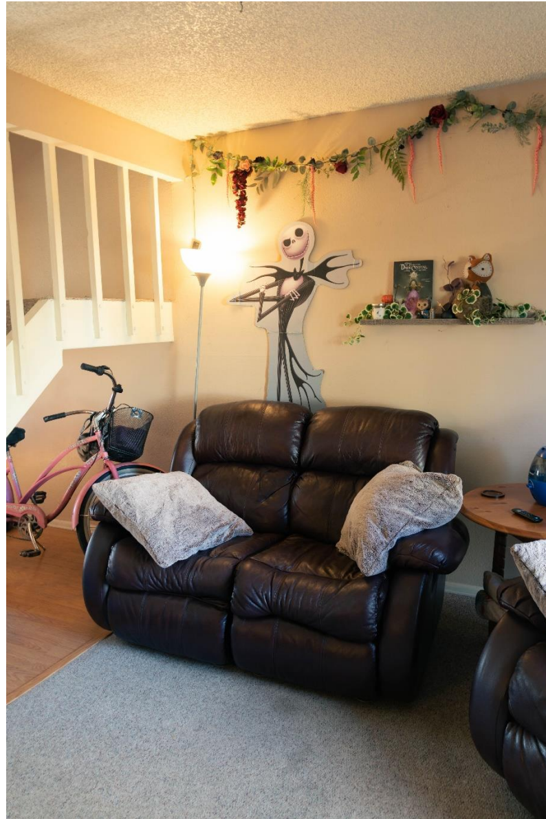
Figure 3: The Anderson Home