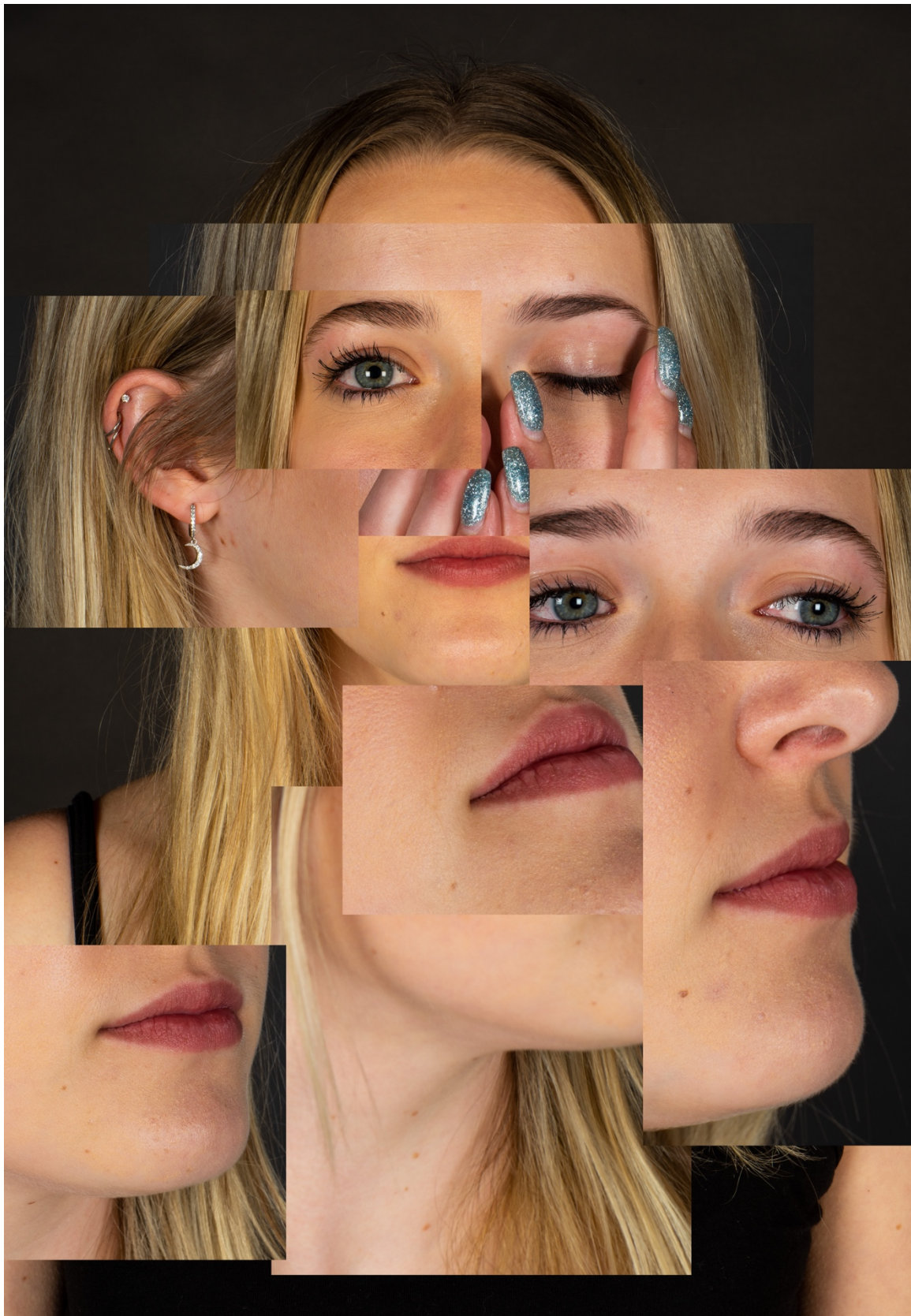
Figure 3: Deconstruction 3