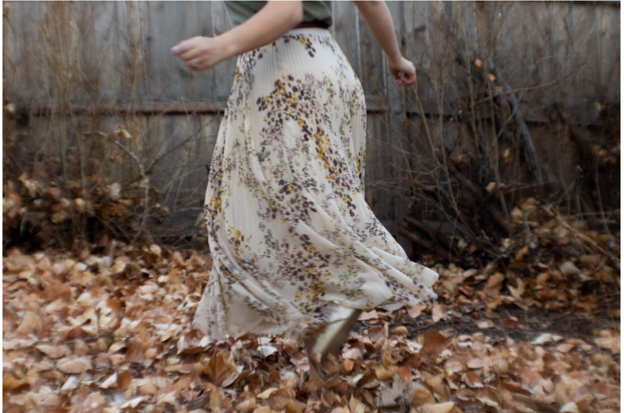
Figure 9: Dress