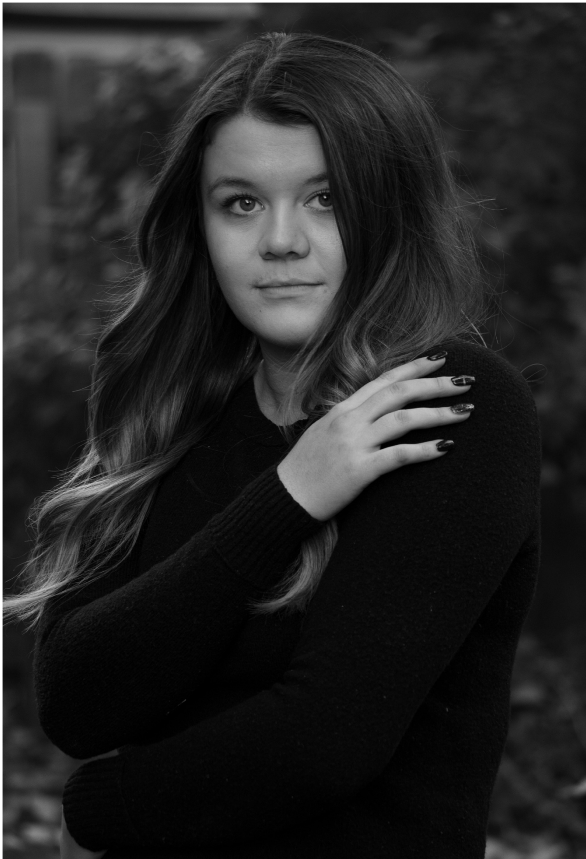
Figure 8: Idealized