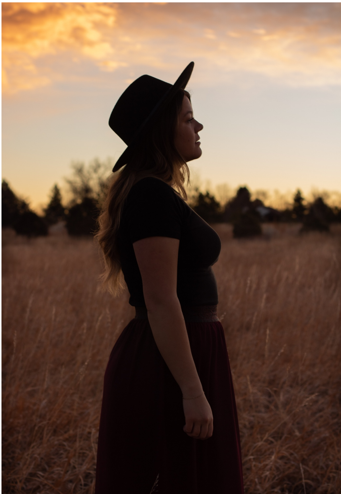
Figure 6: Figure