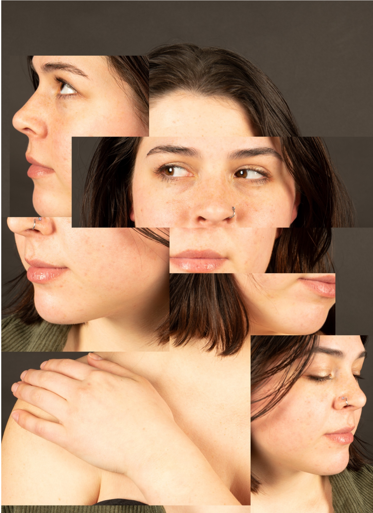
Figure 1: Deconstruction