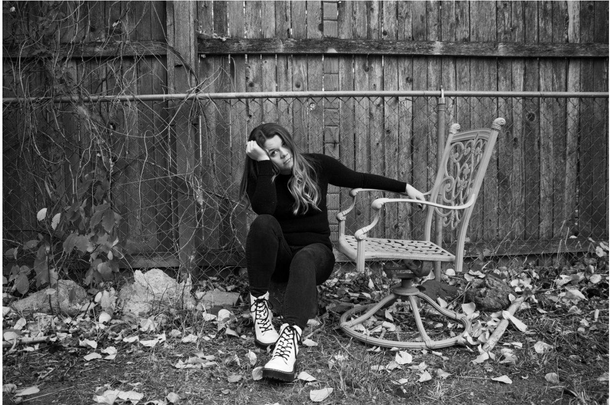
Figure 7: Contemplation