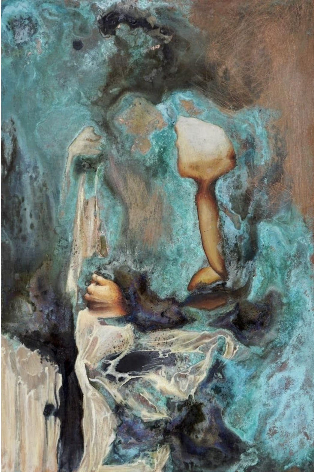
Figure 1: Drift in the Wisps, Wander and Wane