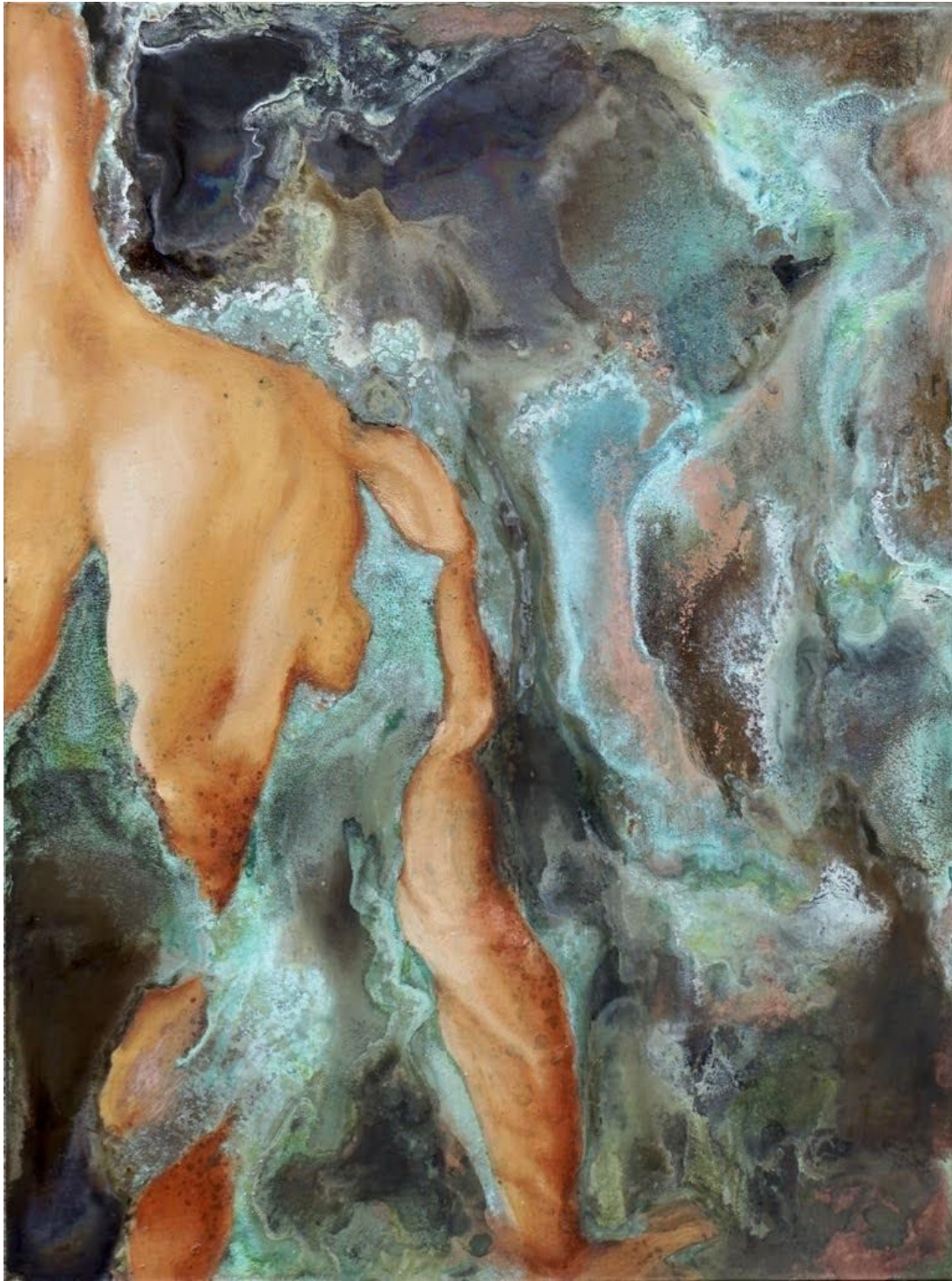
Figure 7: Absent Minded Linger