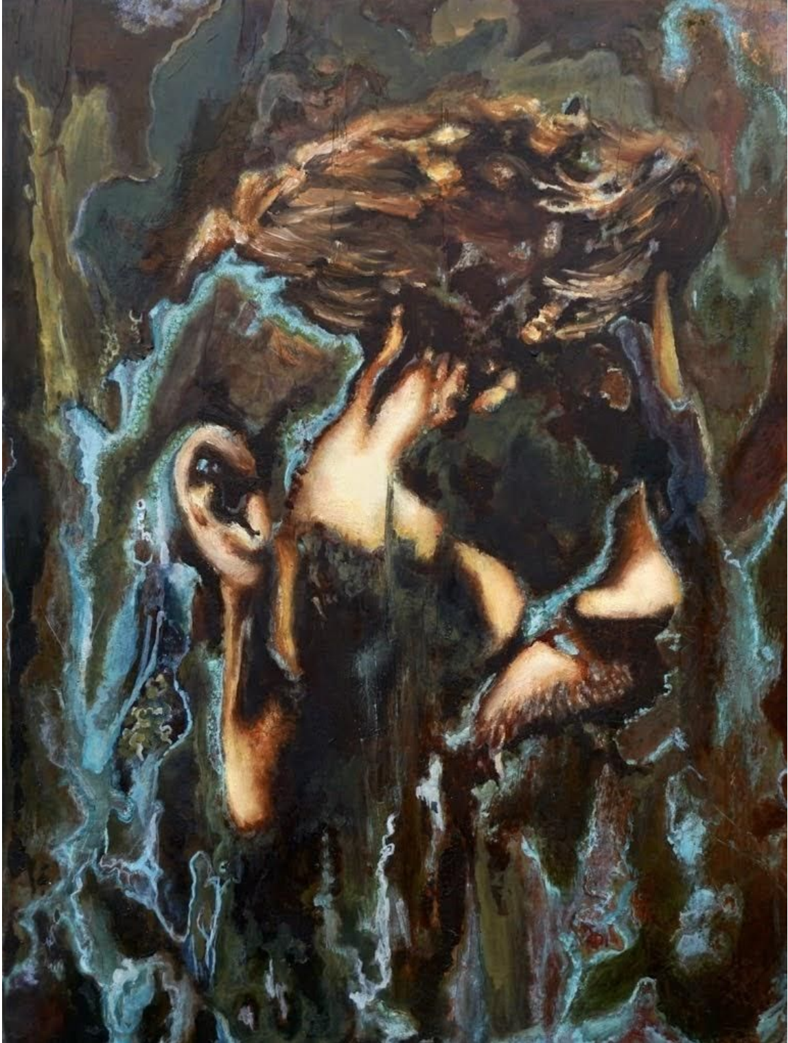
Figure 4: The Lost Adonis