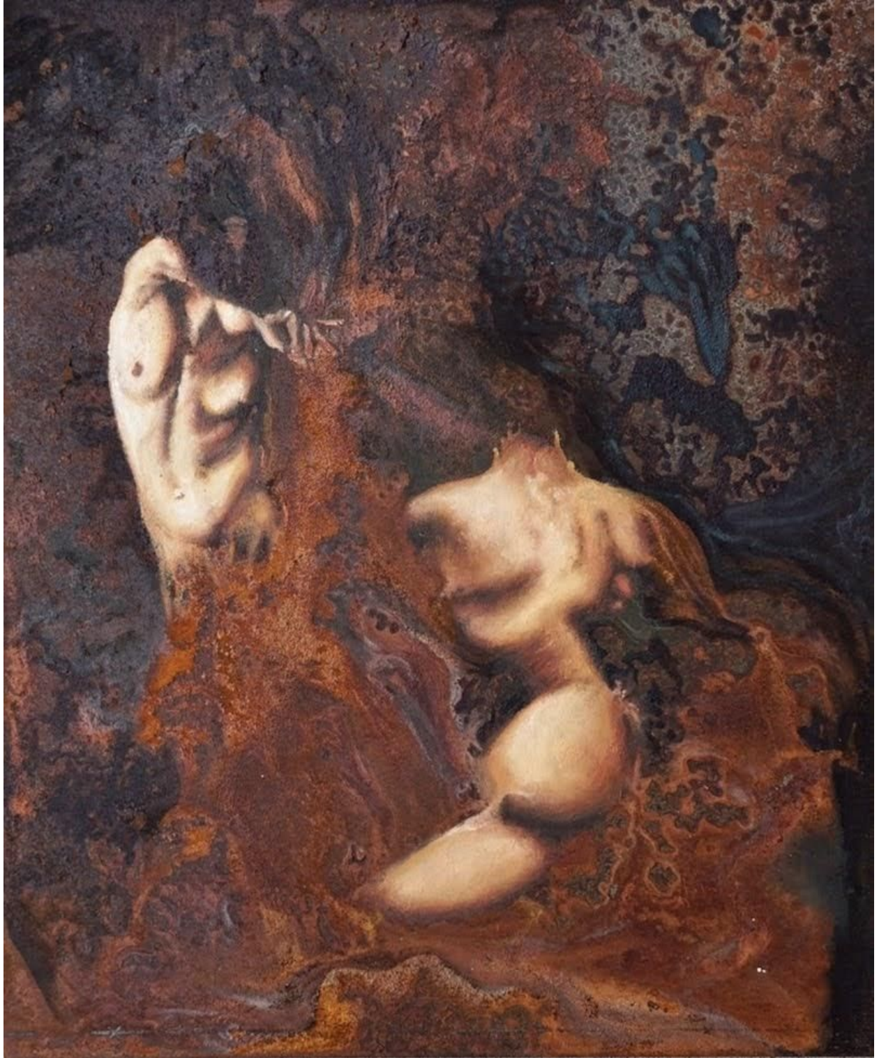
Figure 3: Fire and Brimstone