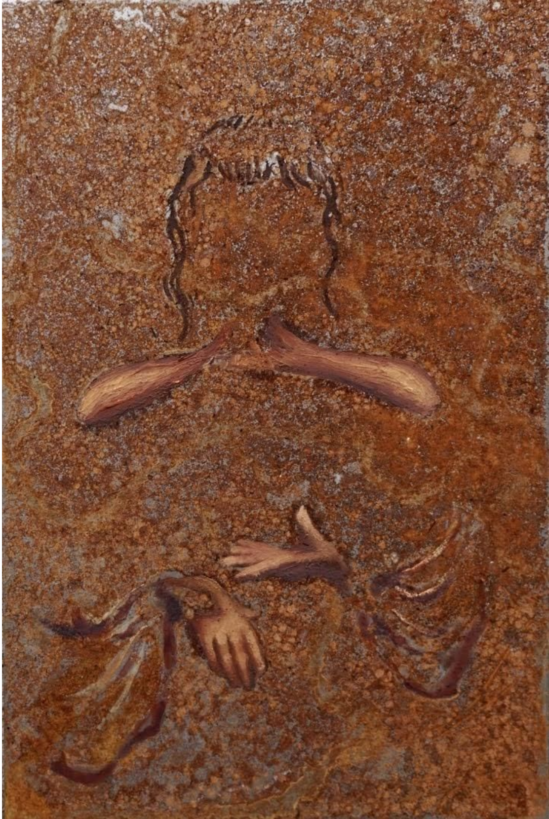
Figure 10: Flüchtig