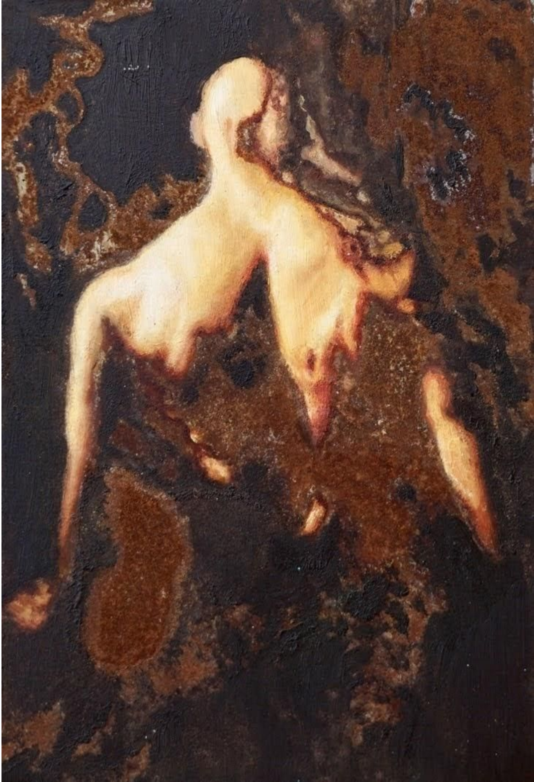
Figure 9: Alles ist miteinander verbunden