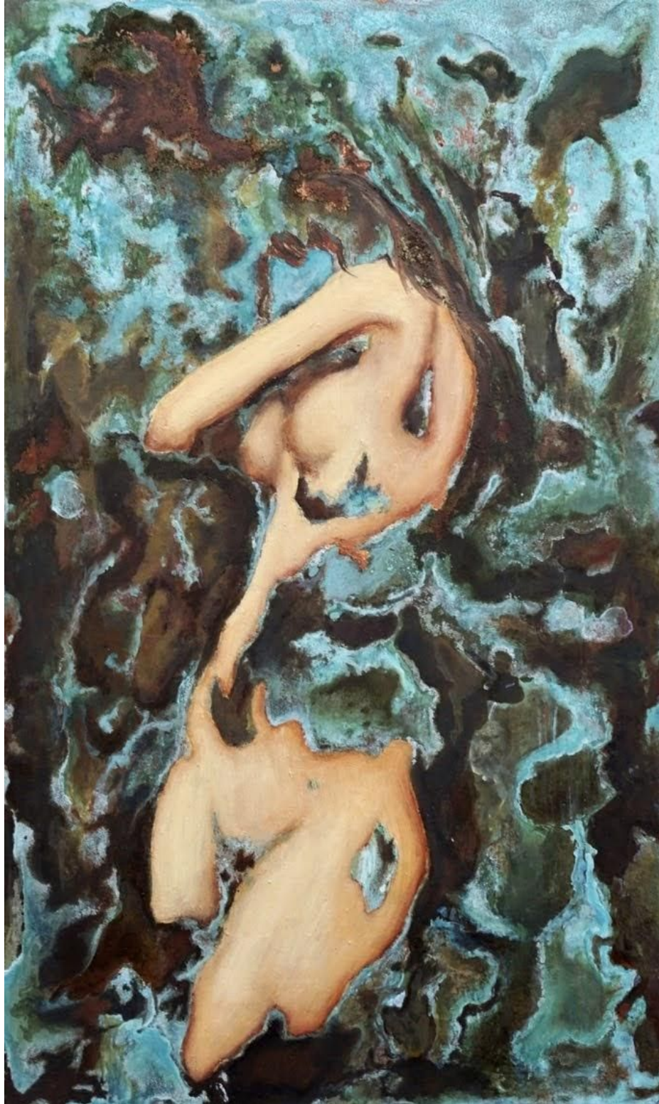
Figure 5: She Flows