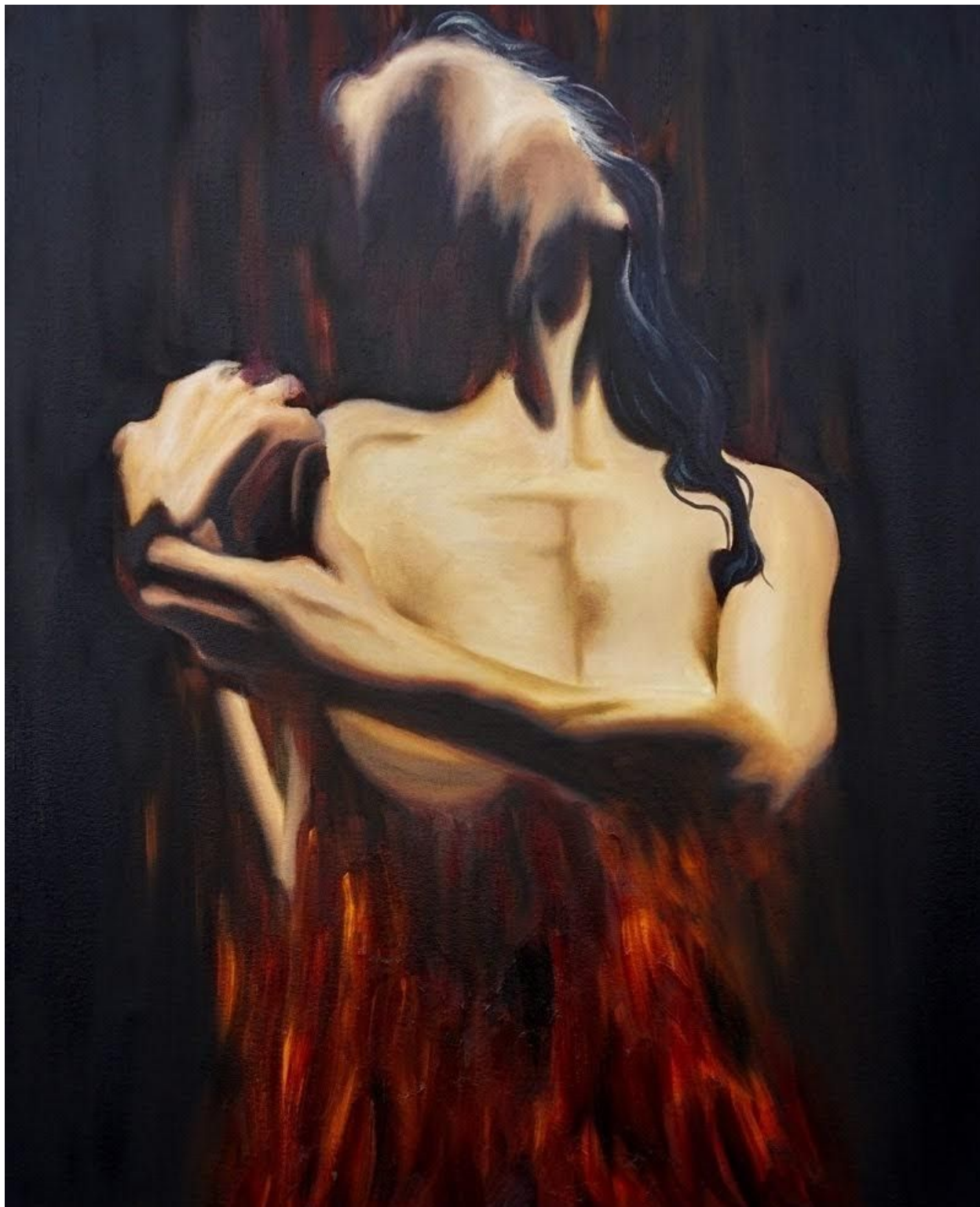
Figure 6: Untitled