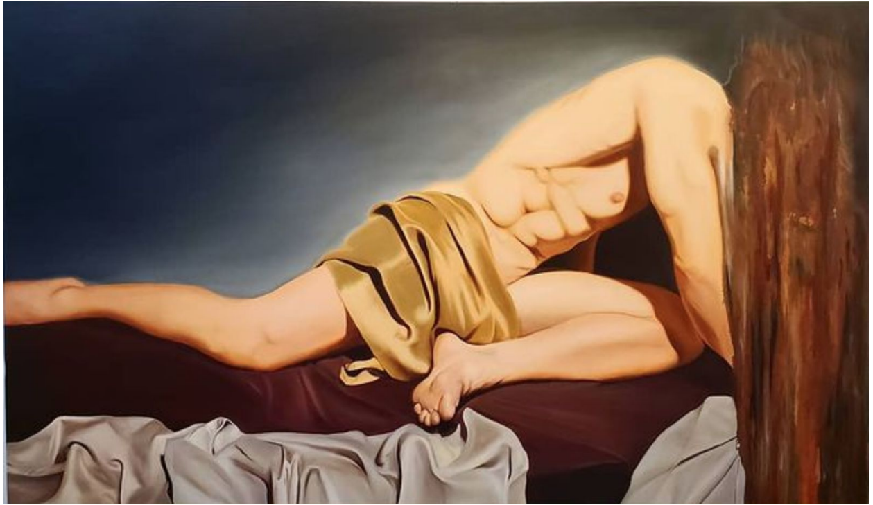
Figure 11: Alles verfault