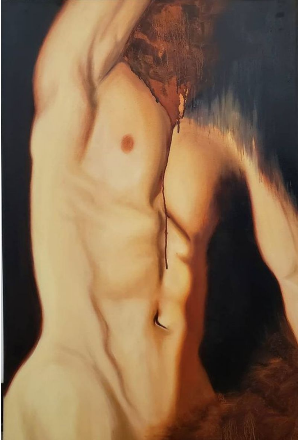
Figure 8: Hol mich raus