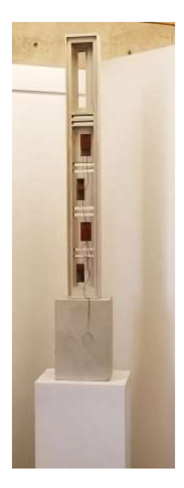
Figure 5. Where We Live, molded cement, wire, cotton thread, rust dye, 63" x 10" x 8", 2018.