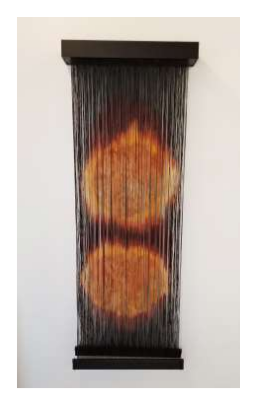
Figure 7. Beginnings, cotton yarn, wood, rust dye, ink, paint, 72" x 24" x 6", 2018.