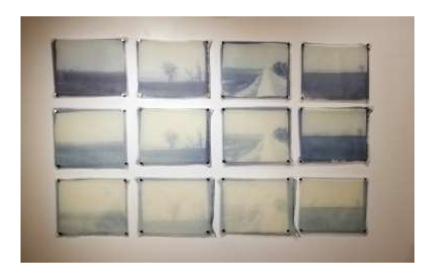
Figure 10. Fading Landscapes, silk organza, cyanotypes, 30" x 36", 2019.