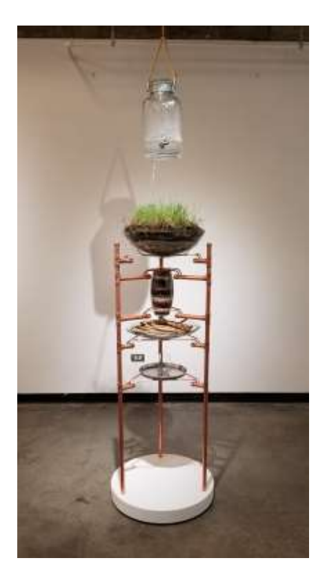
Figure 12. Our Water , copper pipe, wood, glass, filtration materials, 96" x 20" diameter, 2019.