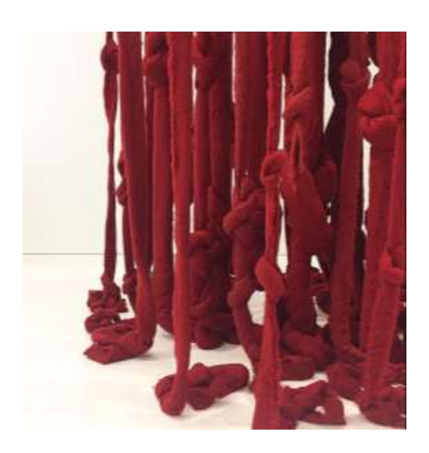
Figure 16. Cecilia Vicuña, Quipu Womb (The Story of the Red Thread, Athens) , 2017, dyed wool installation, EMST—National Museum of Contemporary Art, Athens, Greece.