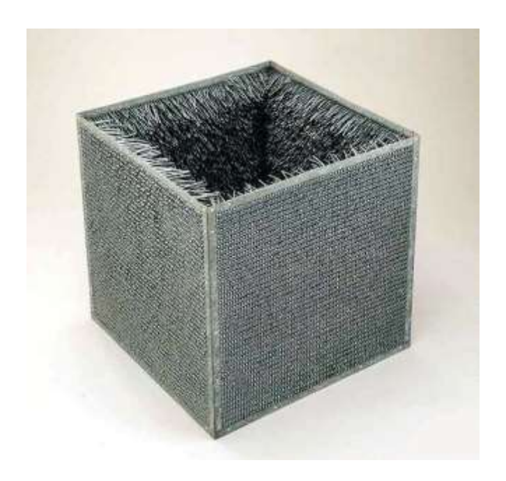
Figure 1. Eva Hesse, Accession II , 1969, galvanized steel, vinyl, 30 ^3 /4" x 30 ^3 /4" x 30 ^3 /4", Detroit Institute of Arts, Detroit, MI.