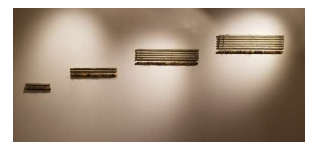
Figure 11. Rural/Urban, cement, yarn, dried plants, wire, 36" x 132" x 1", 2019.