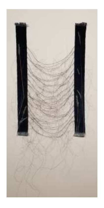
Figure 19. Grasses , linen yarn, cyanotype photograms, indigo, horse hair, wire, 23 ^{3}\!4 " x 2 5/16", 2020.