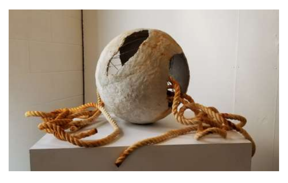
Figure 4. Release , cement, aluminum screen, cotton rope, rust, 20" diameter, 2018.