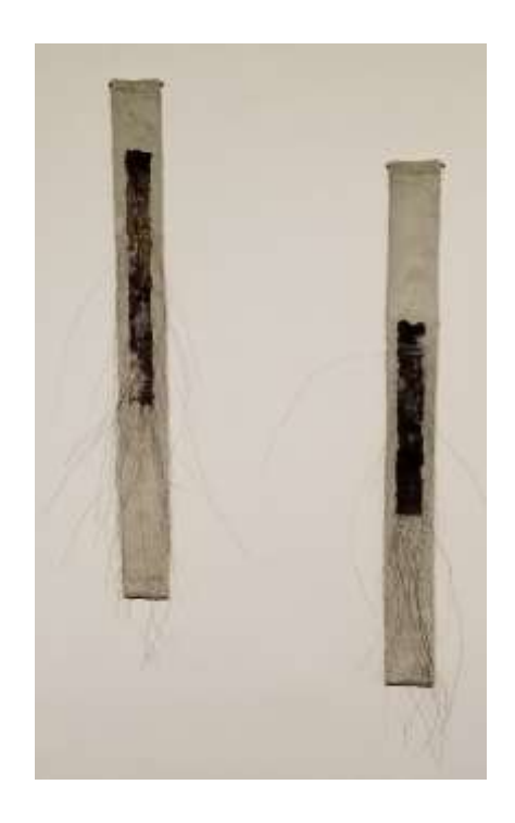
Figure 20. Cathedrals, linen yarn, cement, acid dye, horse hair, wire, 2 1/8" x 23", 2020.