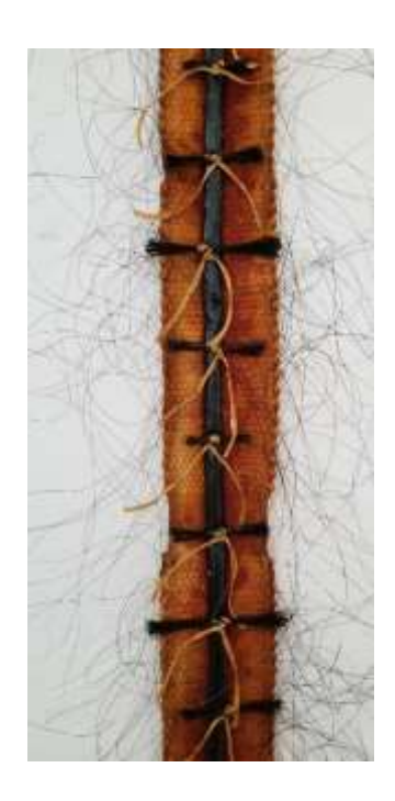
Figure 18. Umbilical , linen yarn, horse hair, rust dye, paint, cotton rope, 90" x 2", 2020.