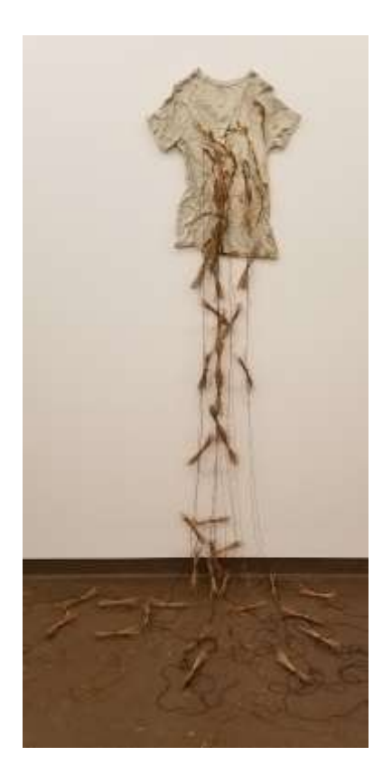
Figure 13. Entangled, cotton T-shirt, cement, cotton yarn, pine needles, 72" x 24", 2019.