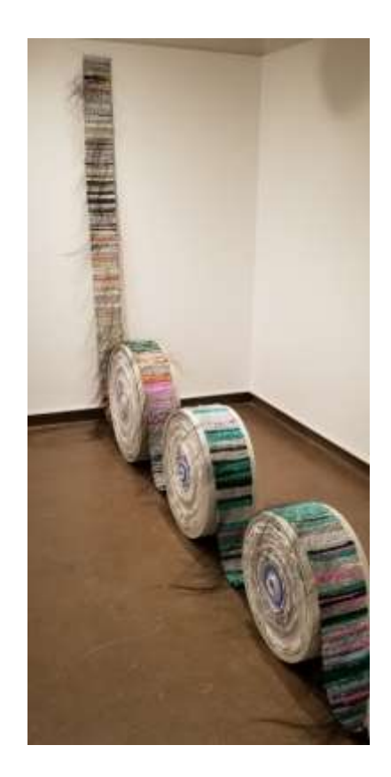
Figure 15. Skin , repurposed plastic, cotton yarn, horse hair, cement, 480" x 8" (weaving), 2019.