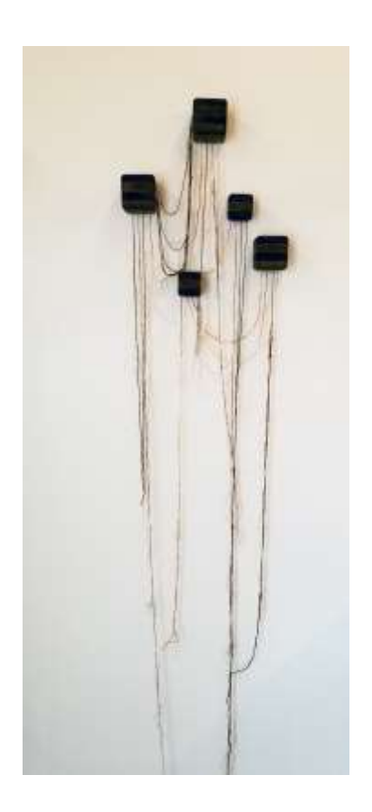
Figure 2. Connections, cotton yarn, laminated wood, acid dye, rust dye, 96" x 24" x 3" (maximum block size), 2018.