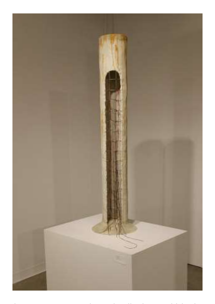
Figure 3. Interior/Exterior , cement, metal mesh, discharged black cotton yarn, rust, 40" x 6" diameter, 2018.