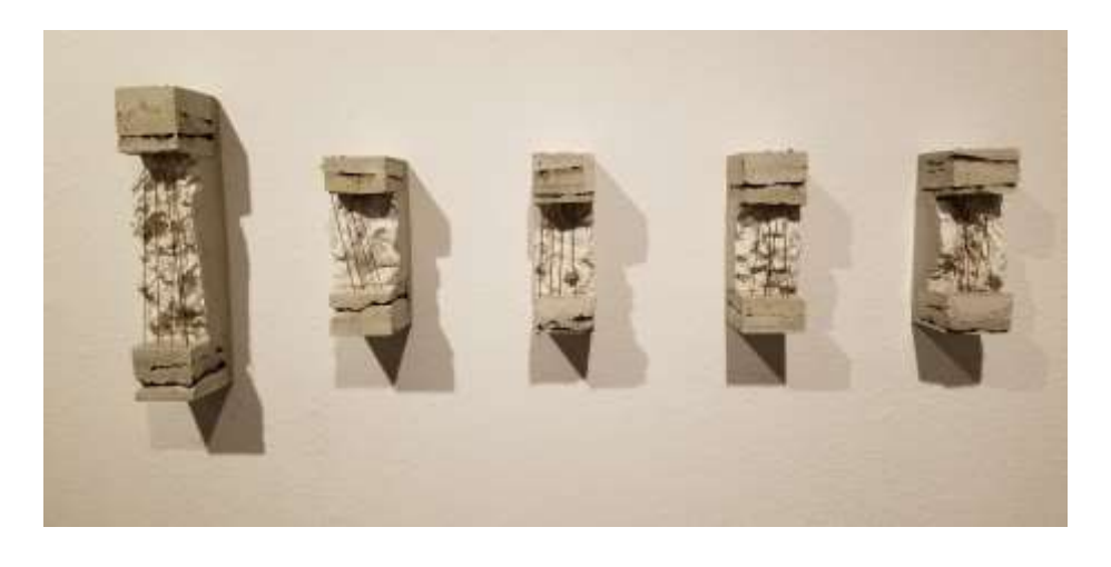
Figure 14. Landscapes, molded cement, discharged cotton yarn, dirt, pine needles, 12" x 36" x 4", 2019.