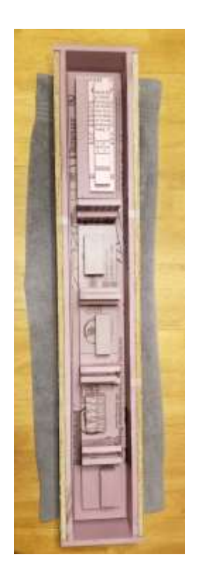
Figure 6. Pink foam insulation mold for Where We Live, 2018.