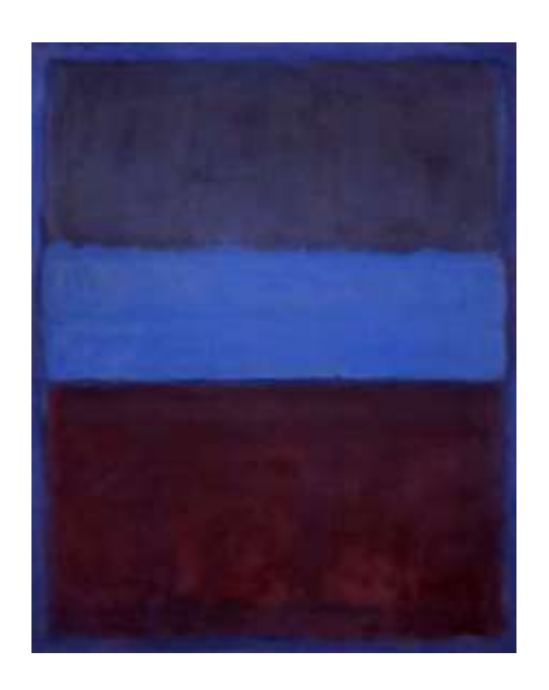
Figure 8. Mark Rothko, No. 61 , 1953, oil on canvas, 115 ½" x 92" x 1 ¾", Museum of Contemporary Art, Los Angeles, CA.