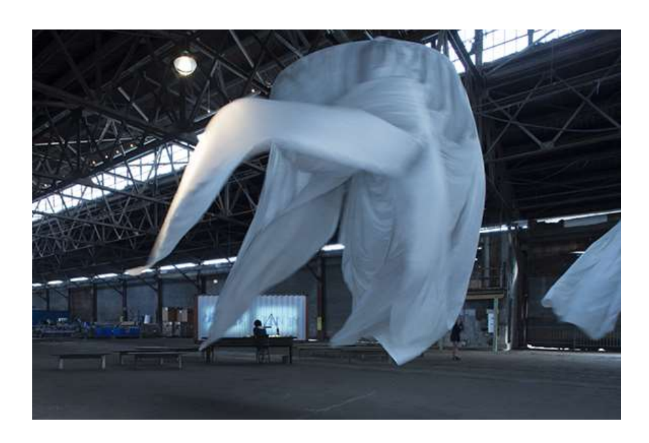
Figure 9. Ann Hamilton, habitus , 2016, Installation, Fabric Workshop and Museum / Municipal Pier 9, Philadelphia, PA.