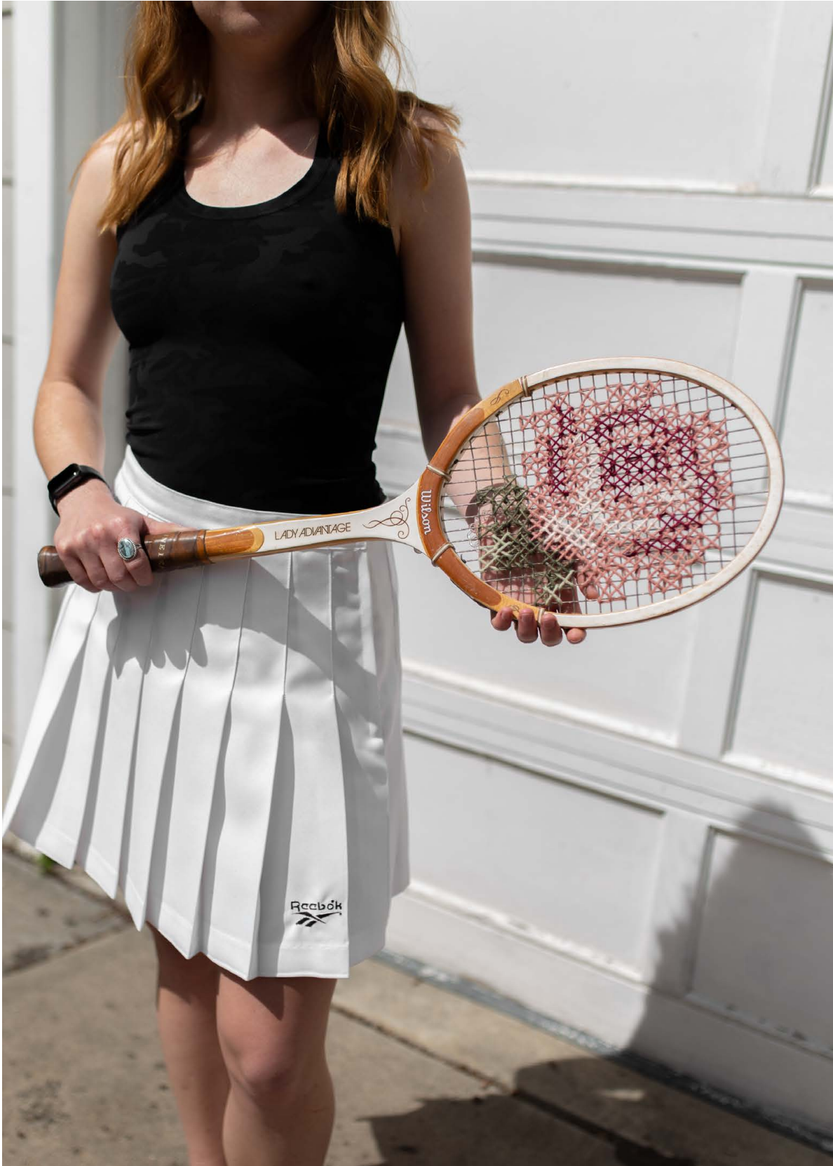
Figure 6: Couch Stitching (detail)