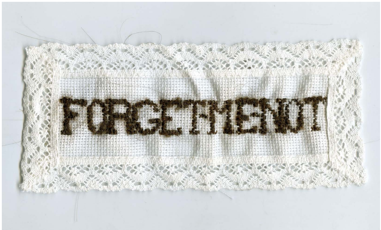
Figure 3: Family Hairloom