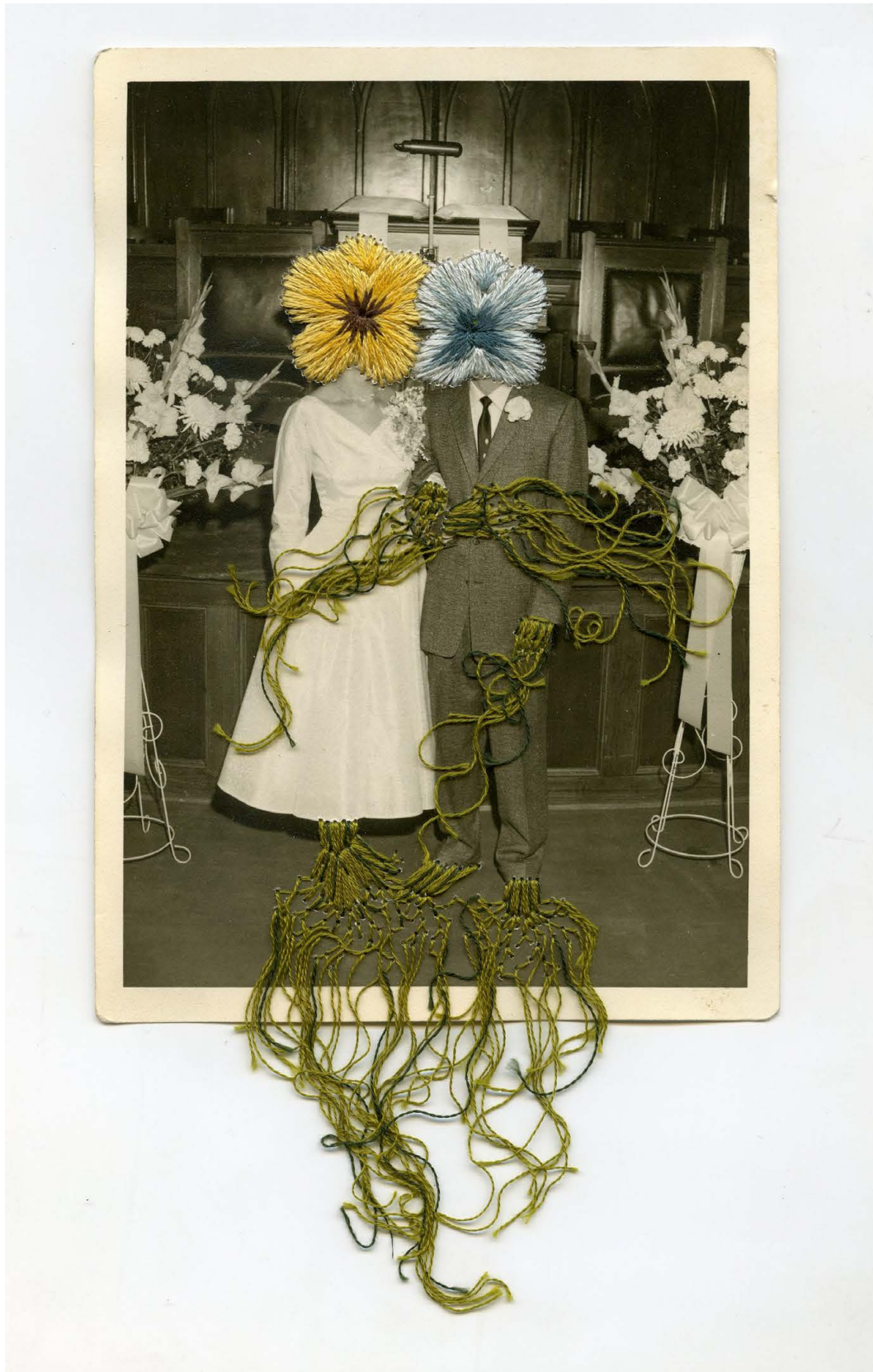
Figure 12: Tying The Knot (detail)