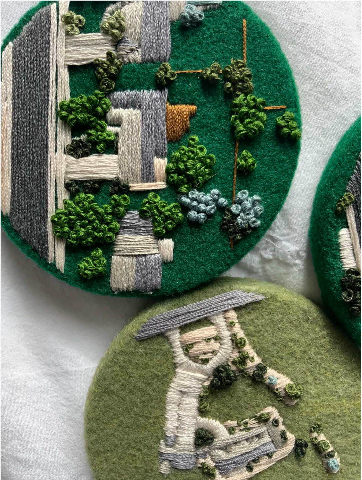
Figure 2: Birdhouse (detail)