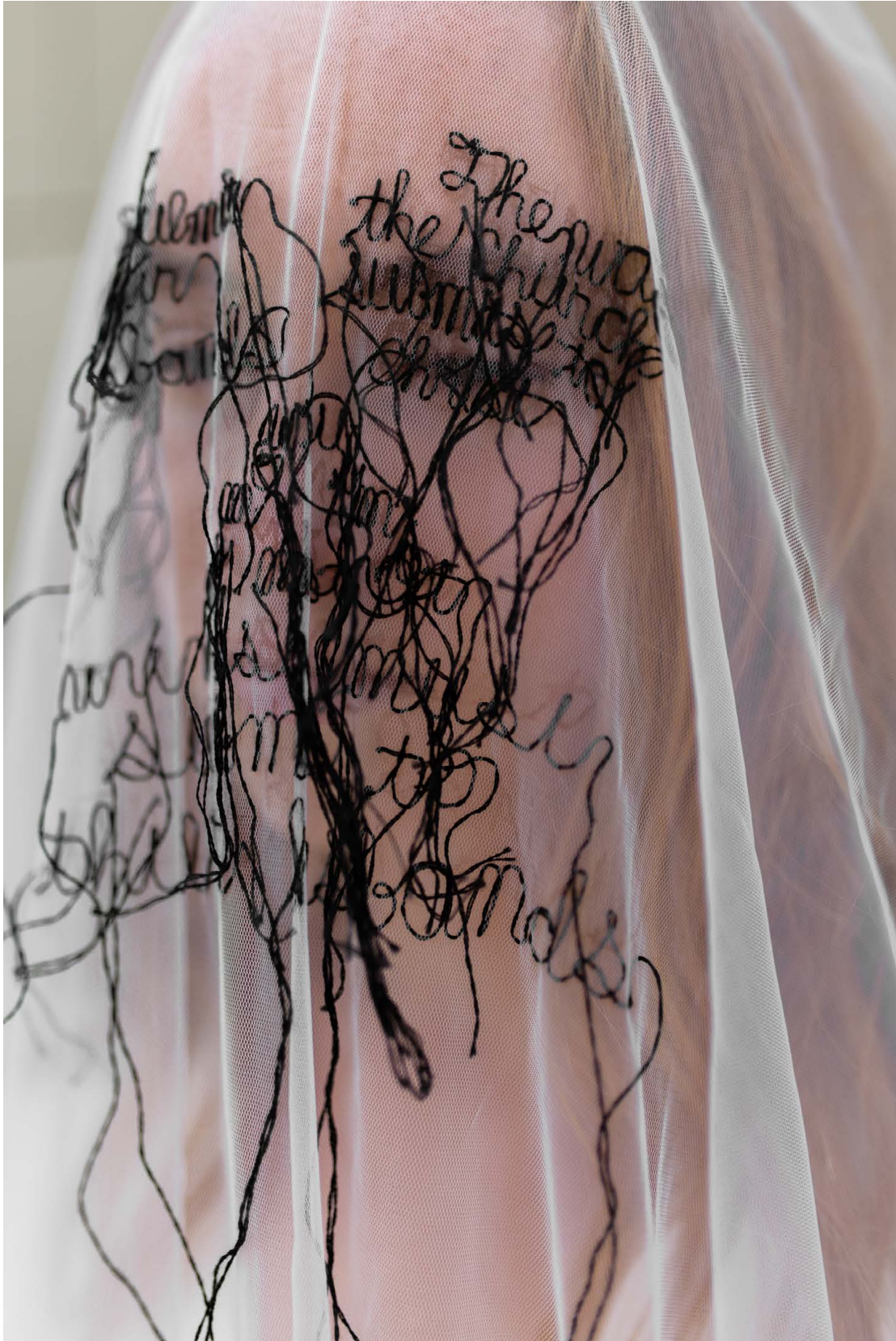
Figure 14: Huptassomai (detail)