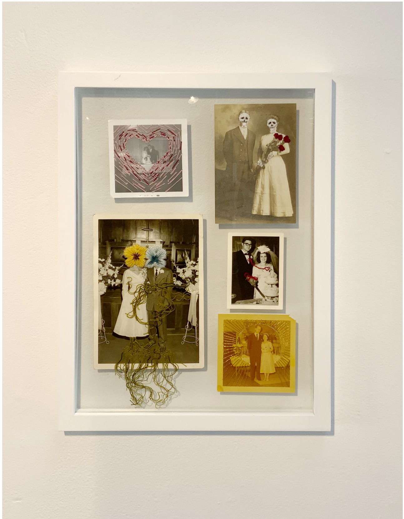
Figure 7: Tying The Knot