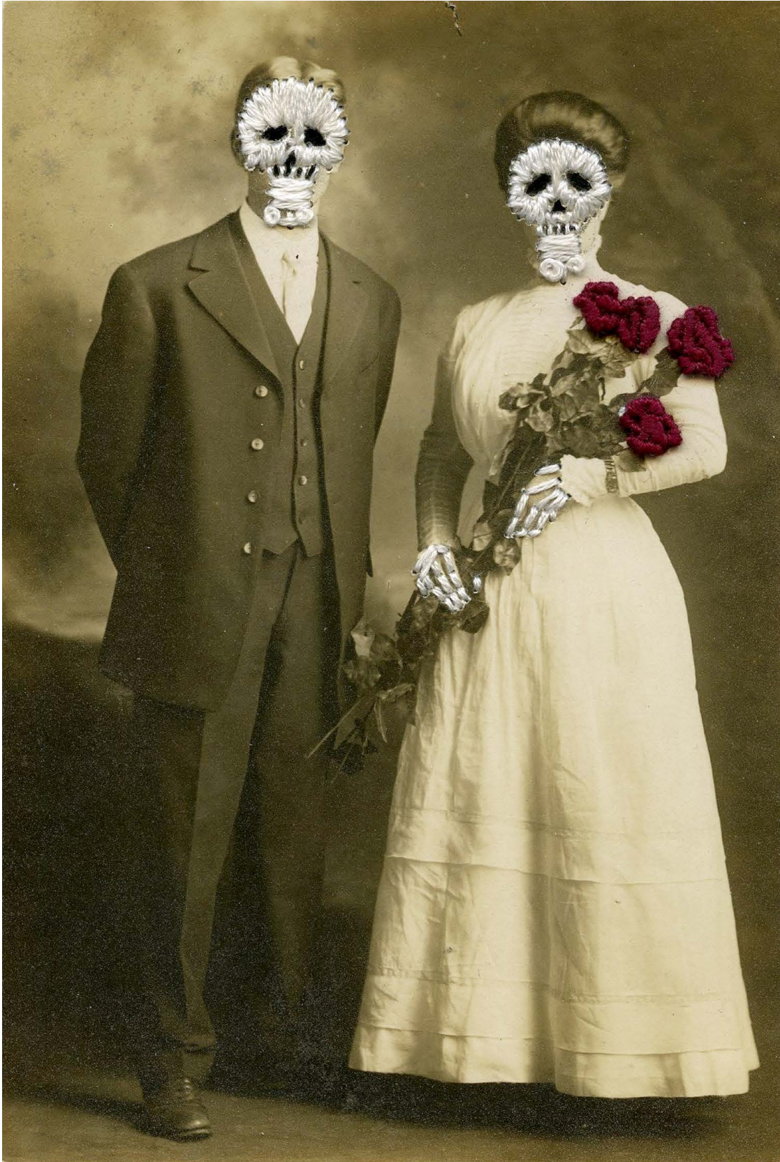
Figure 11: Tying The Knot (detail)