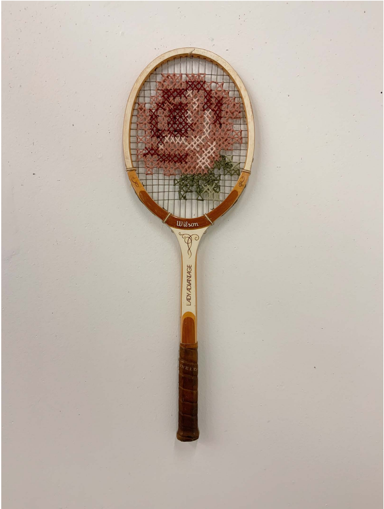
Figure 5: Couch Stitching