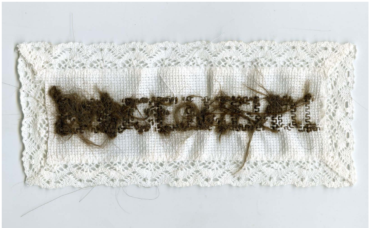
Figure 4: Family Hairloom (detail)