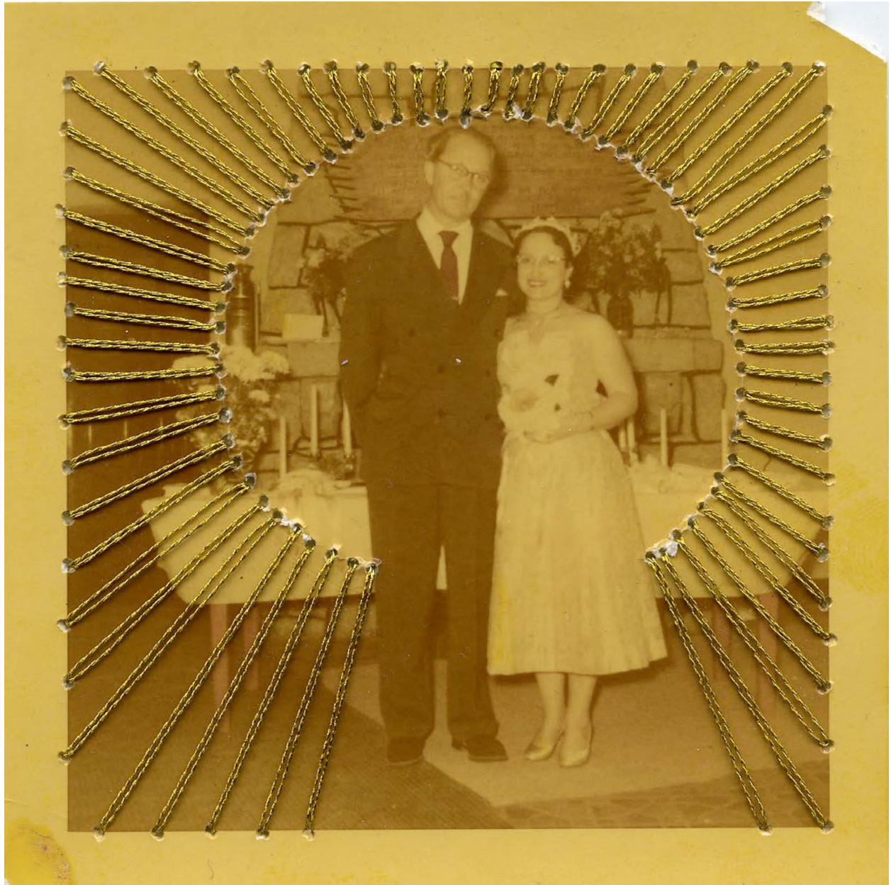
Figure 9: Tying The Knot (detail)