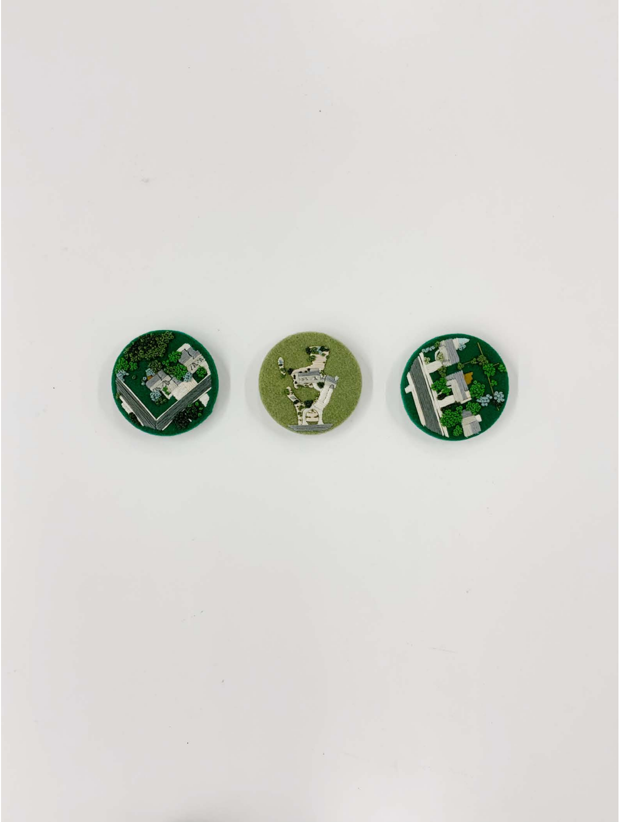
Figure 1: Birdhouse