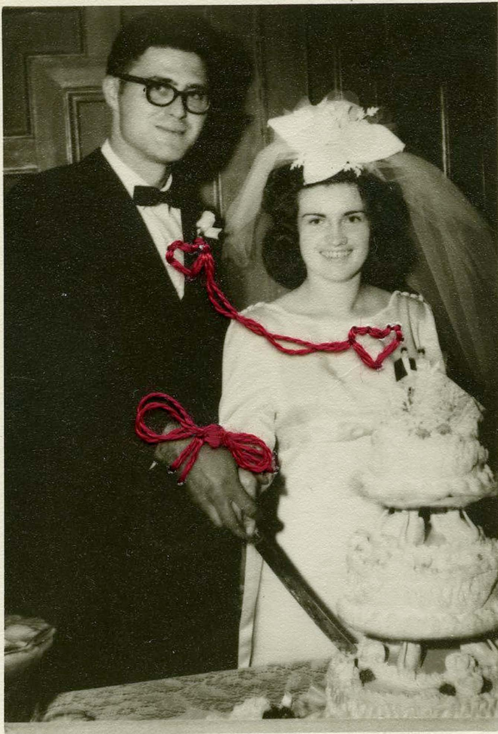
Figure 10: Tying The Knot (detail)