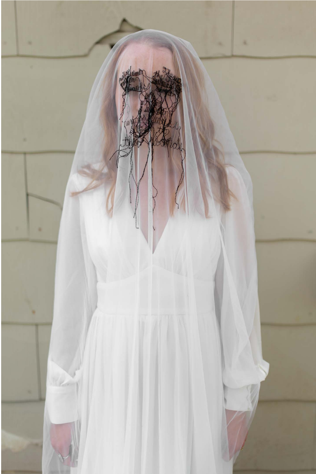
Figure 13: Huptassomai