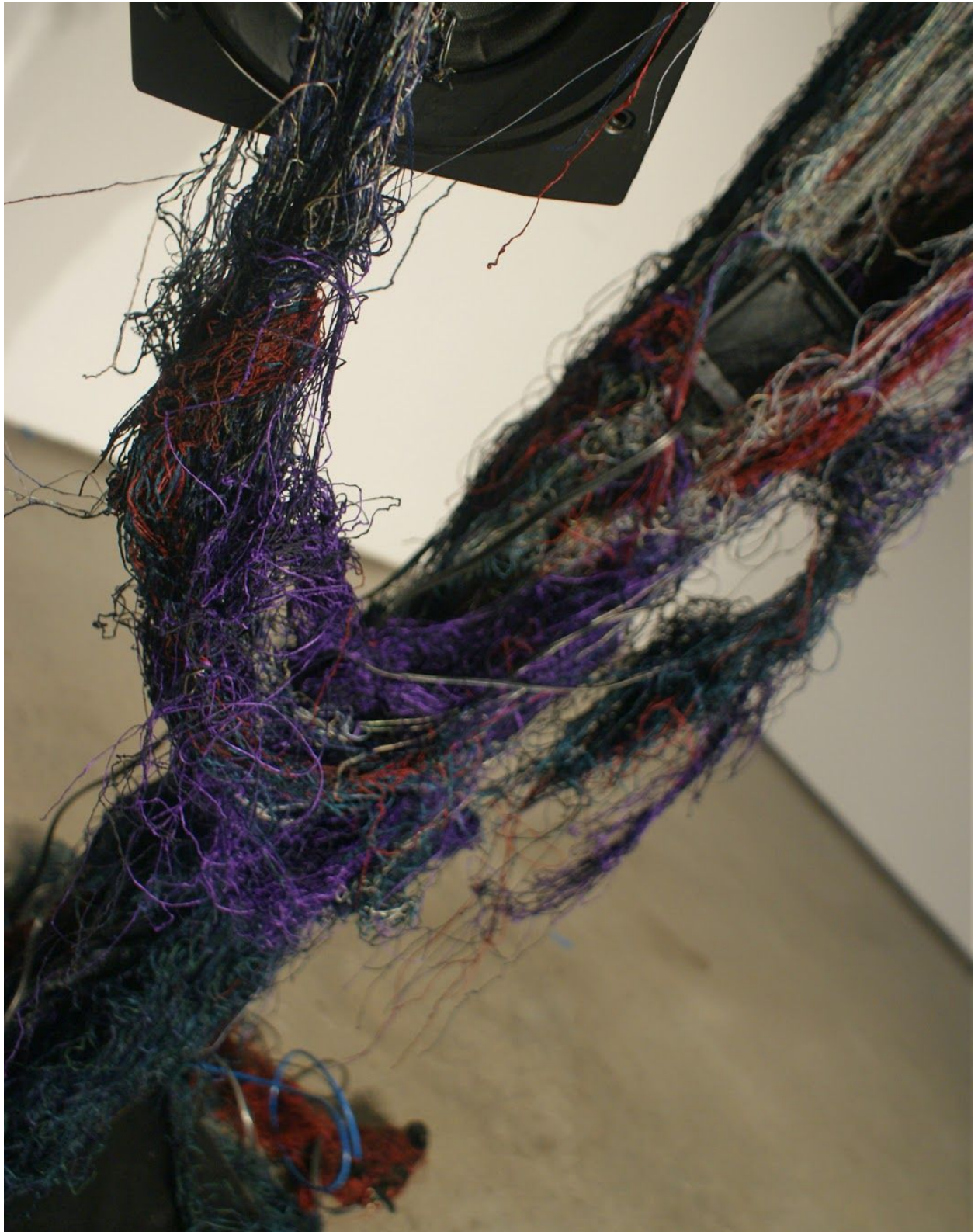
Figure 10: Aurosynthesis