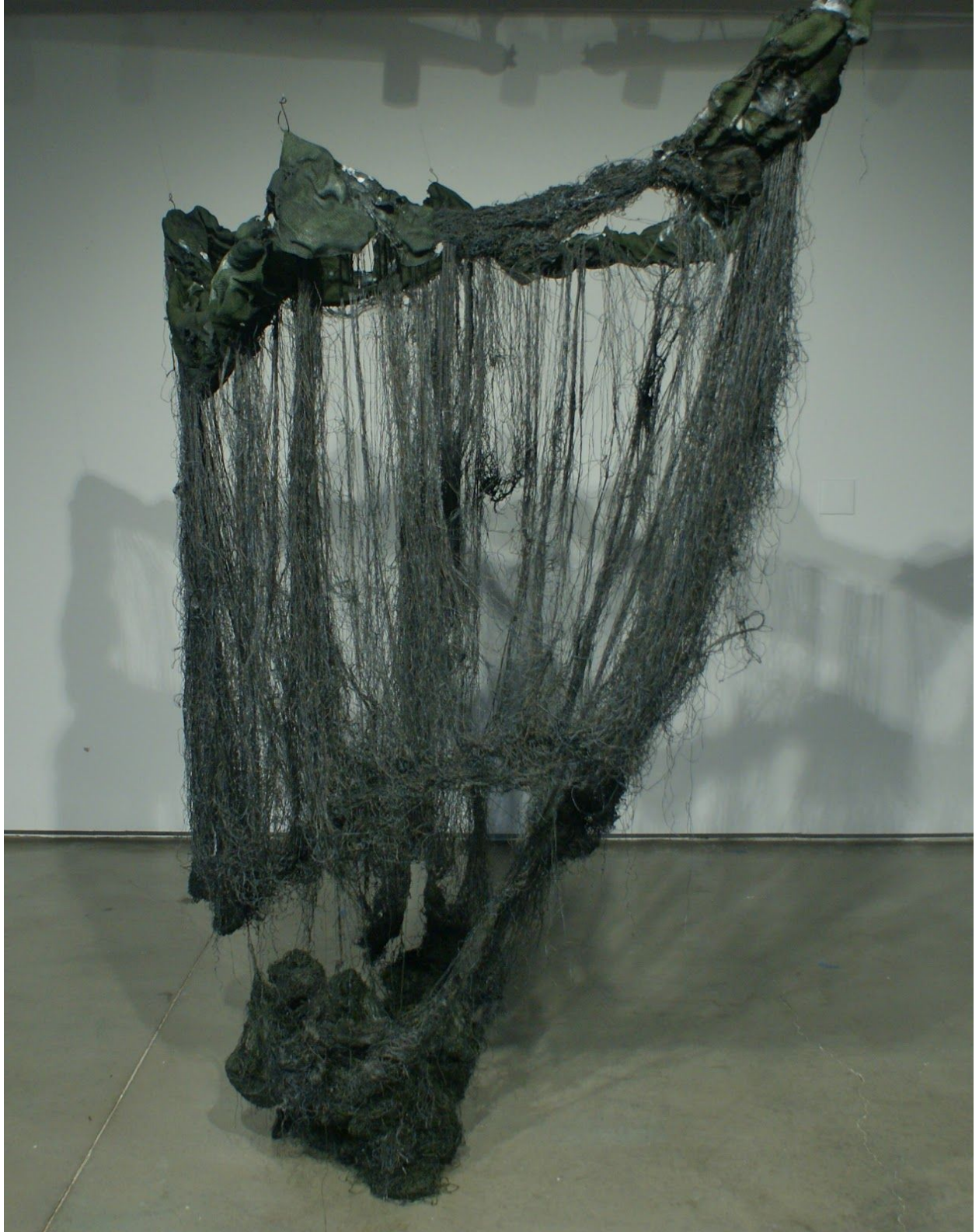
Figure 3: Extract