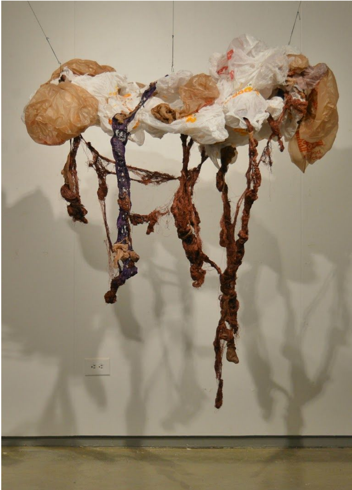
Figure 5: Precipitate