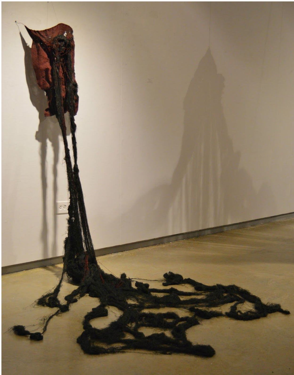
Figure 7: Desecrate