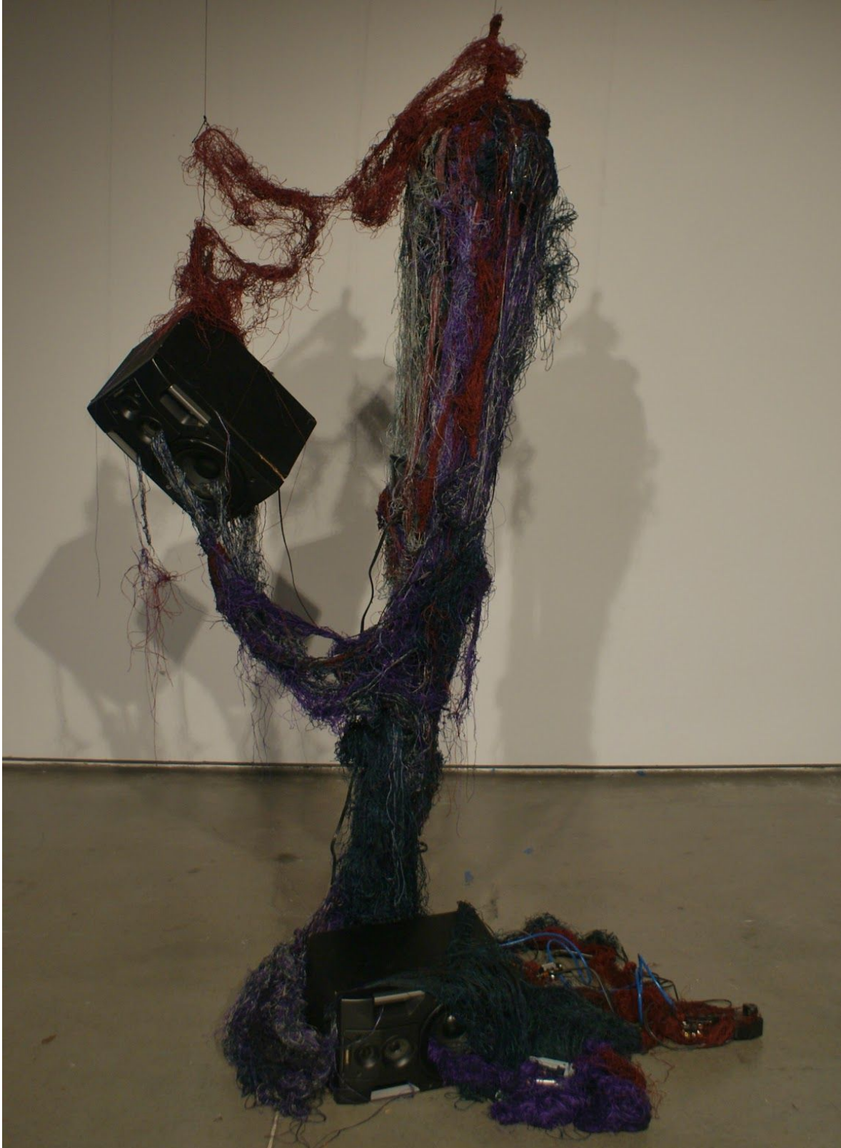
Figure 9: Aurosynthesis