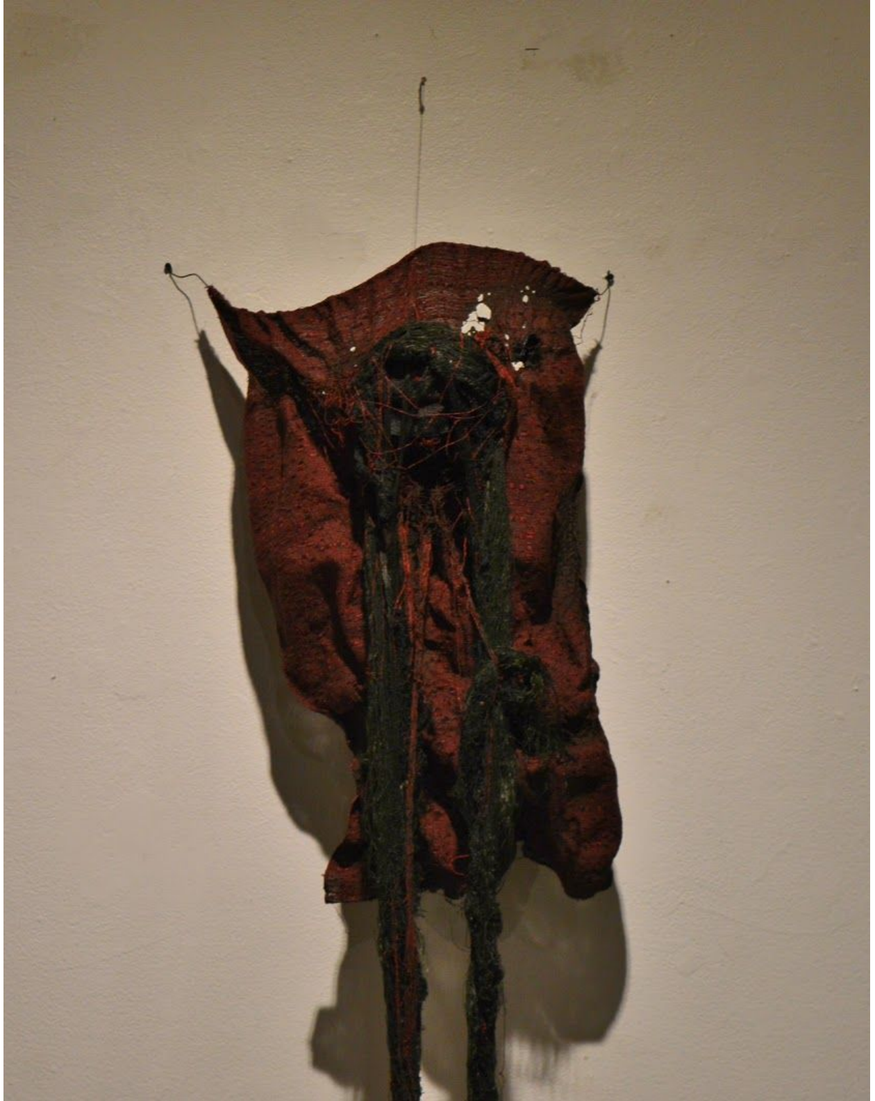
Figure 8: Desecrate