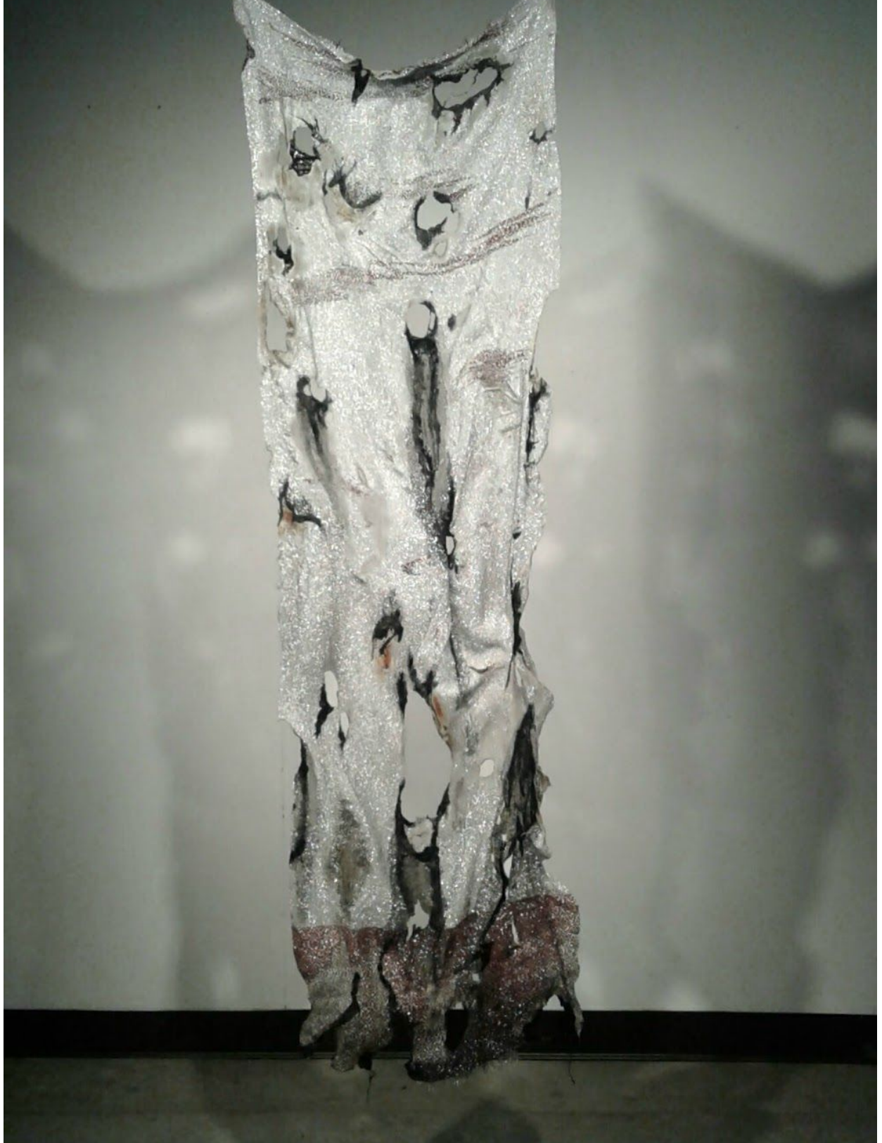
Figure 1: Remnant