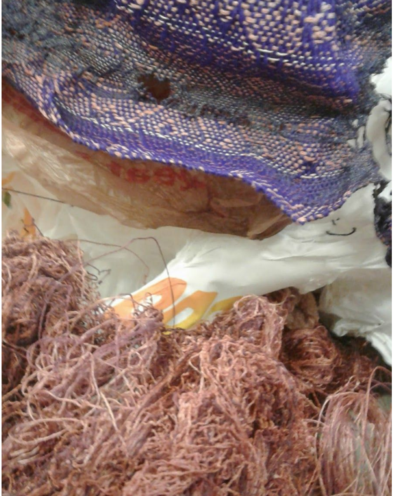
Figure 6: Precipitate