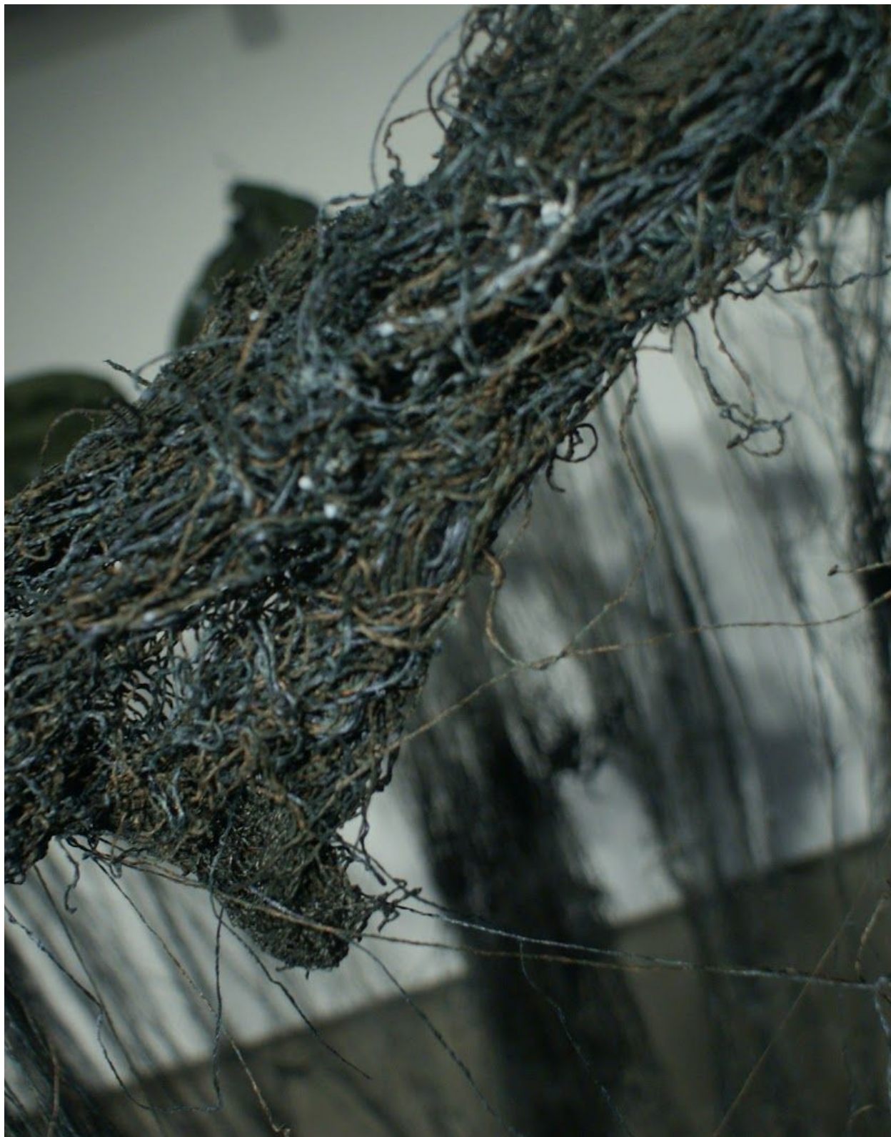
Figure 4: Extract