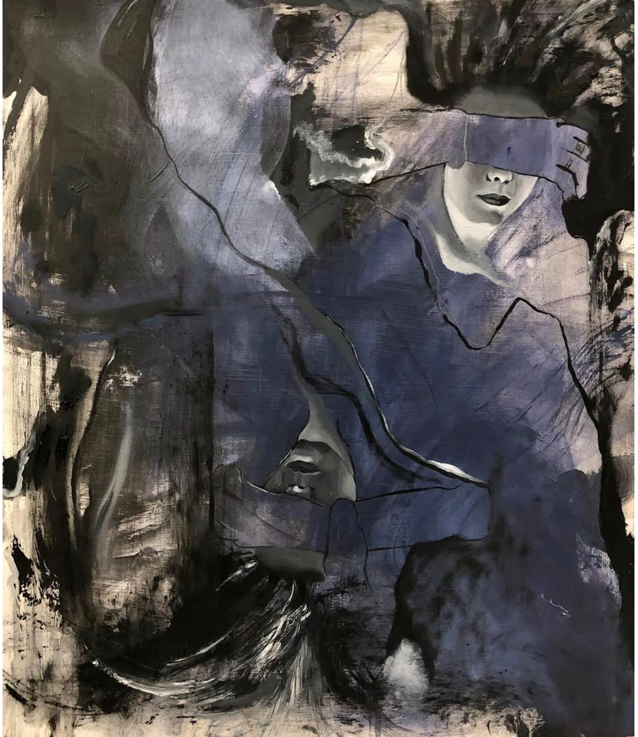
Figure 2: Self Dimension .1