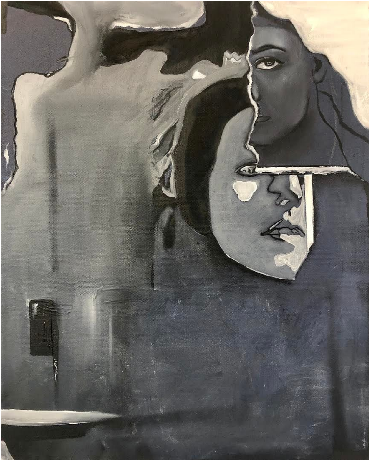
Figure 3: Self Dimension .2