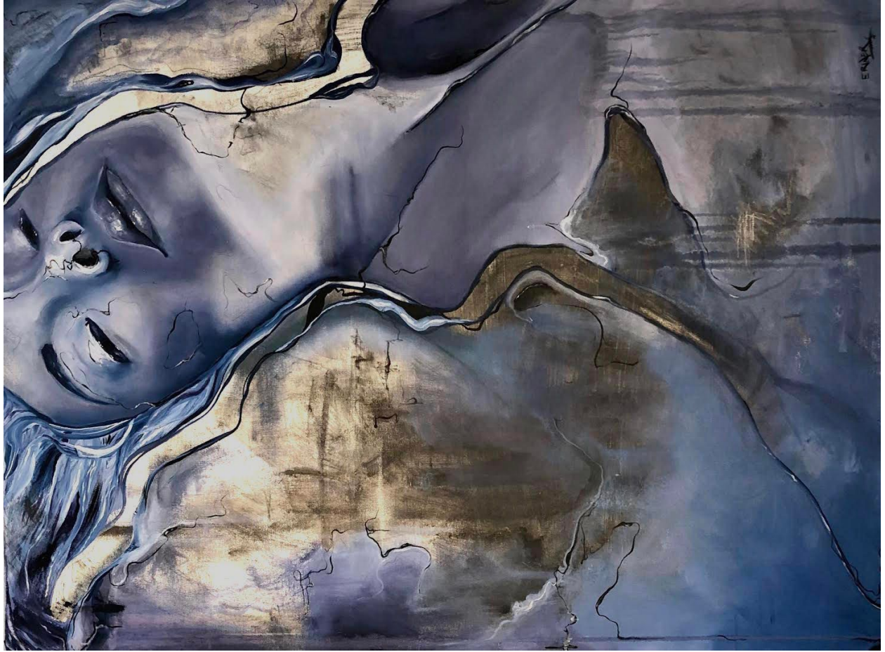
Figure 1: Self Dimension 1