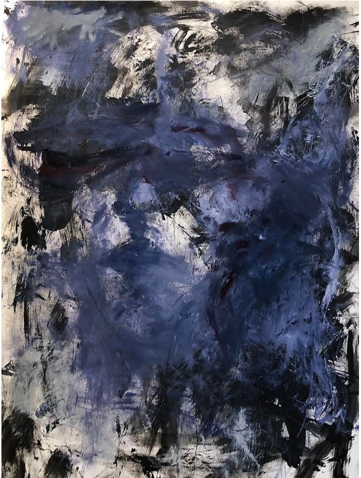
Figure 4: Self Dimension .3