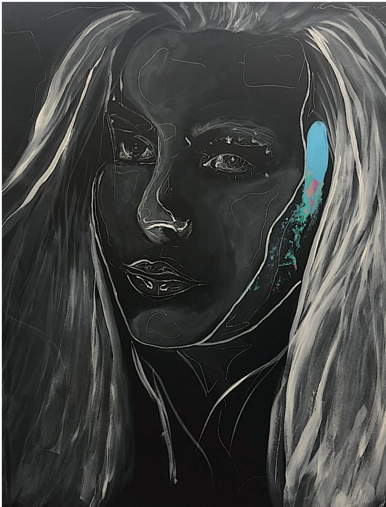
Figure 7: Self Dimension 2.2