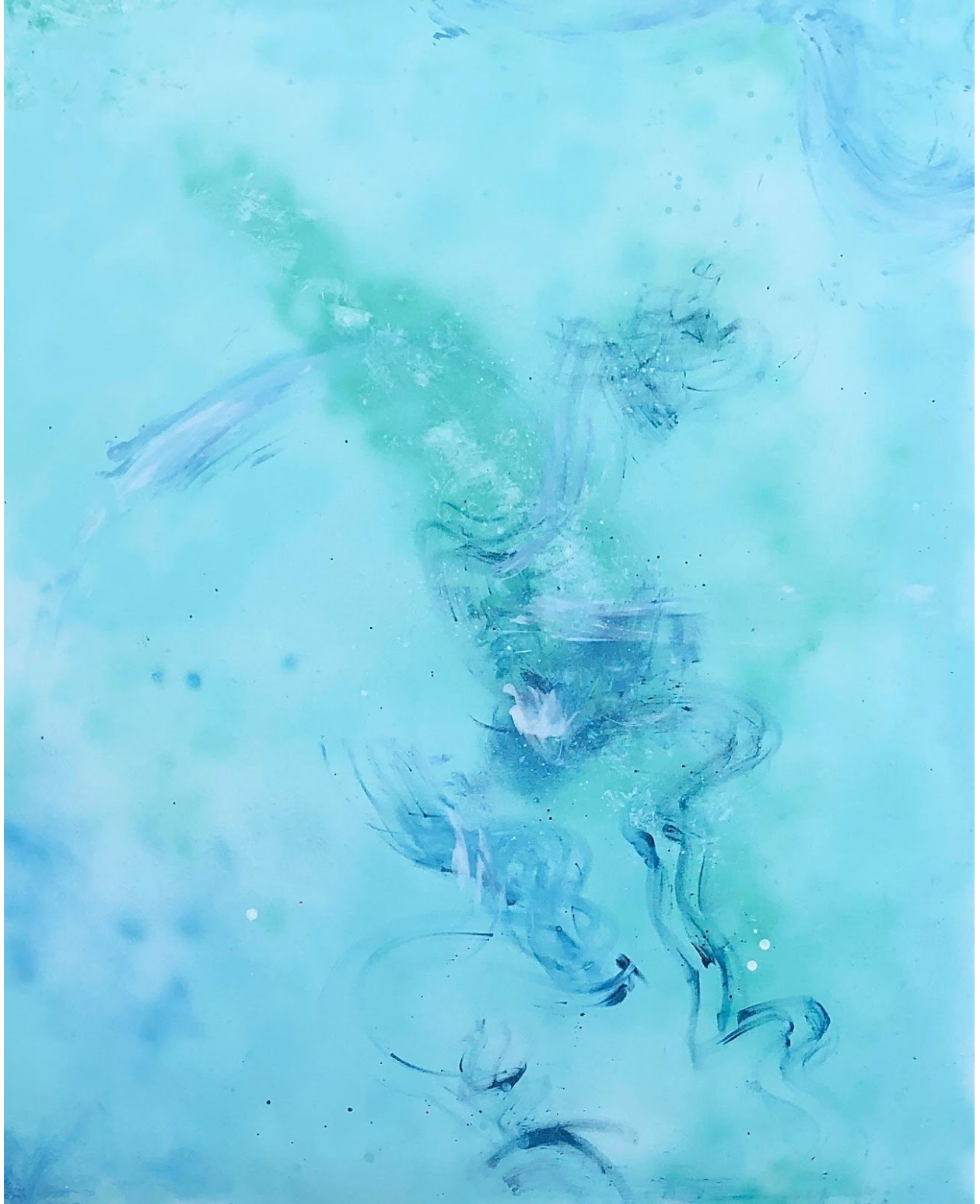
Figure 9: Movements