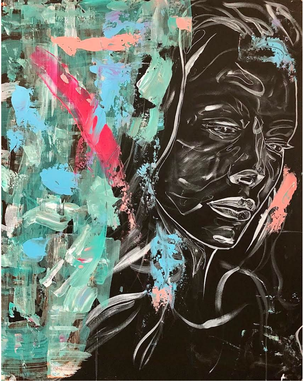
Figure 6: Self Dimension 2.1