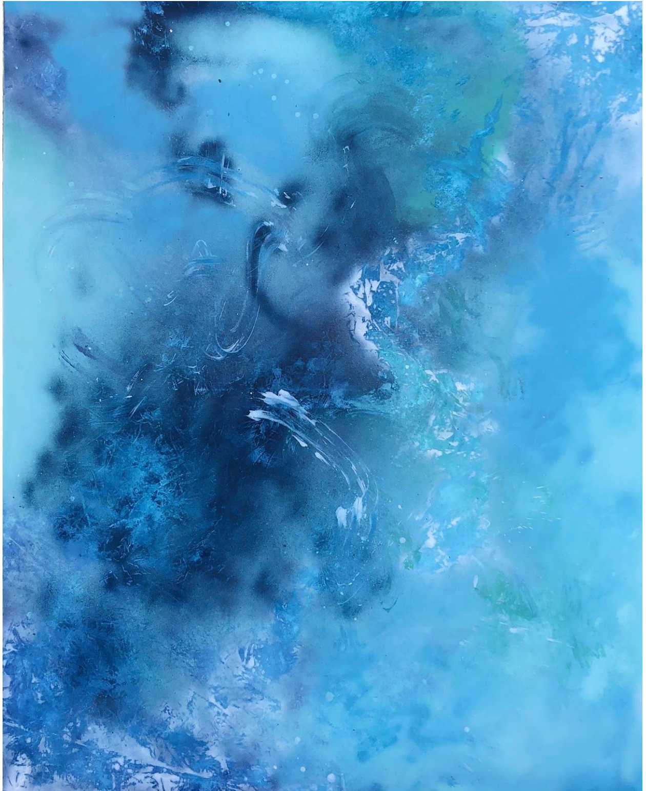
Figure 10: Controls