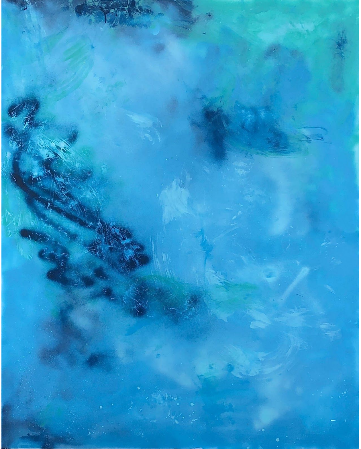
Figure 8: Afterhours