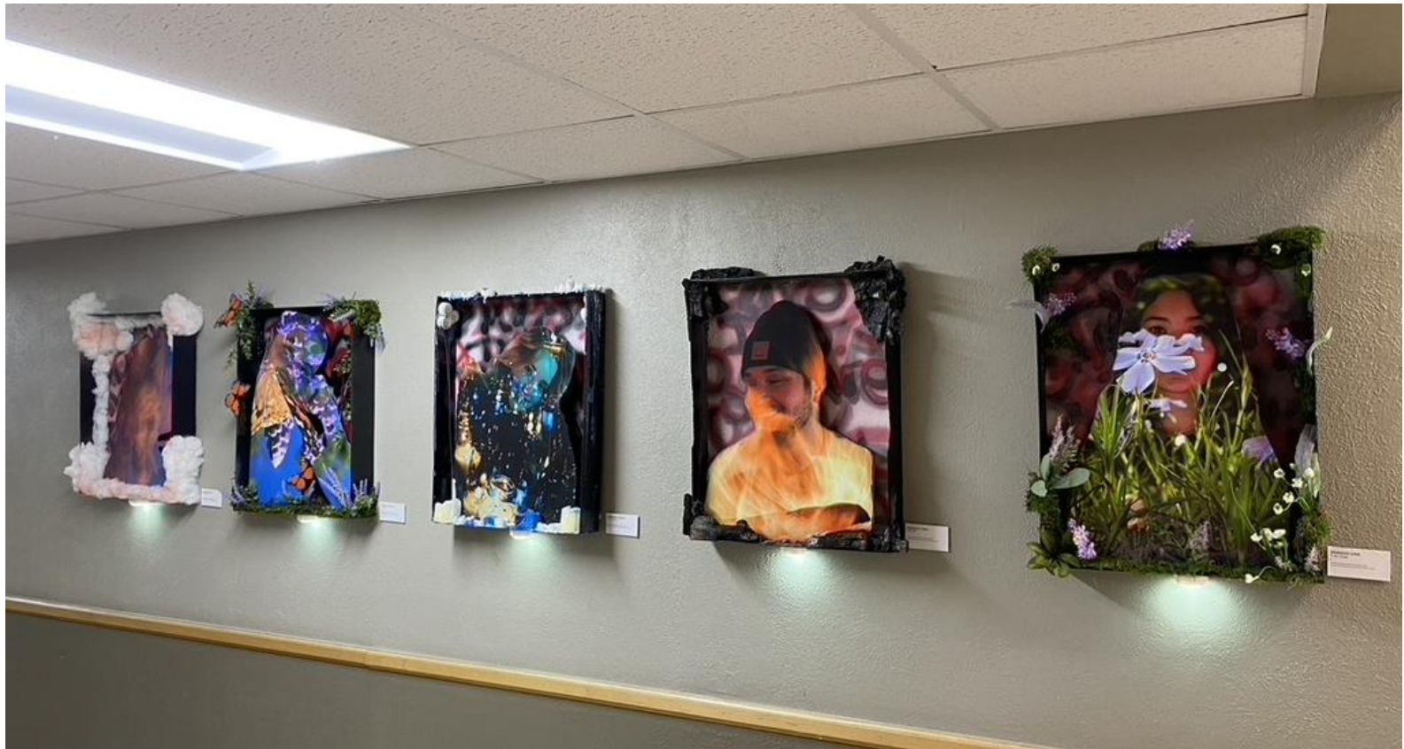
Figure 1: First Impressions