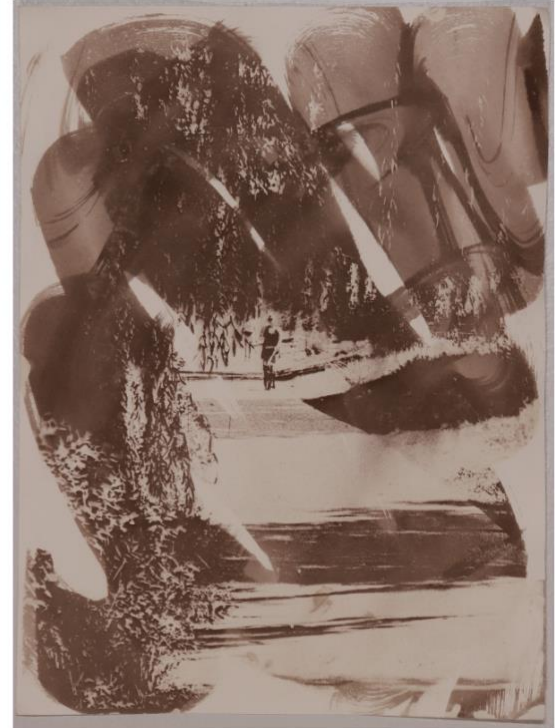
Figure 3: Alternative Process