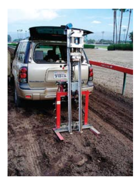
Track Testing Device measures both impact and shear properties of the racetrack.

private funding for scientific research specifically to benefit horses, has provided $15.5 million to fund some 240 projects at three dozen universities over the past 25 years.