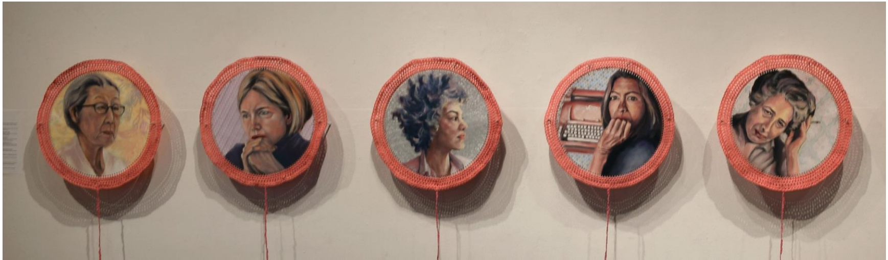
Figure 2: Not alone (paintings)