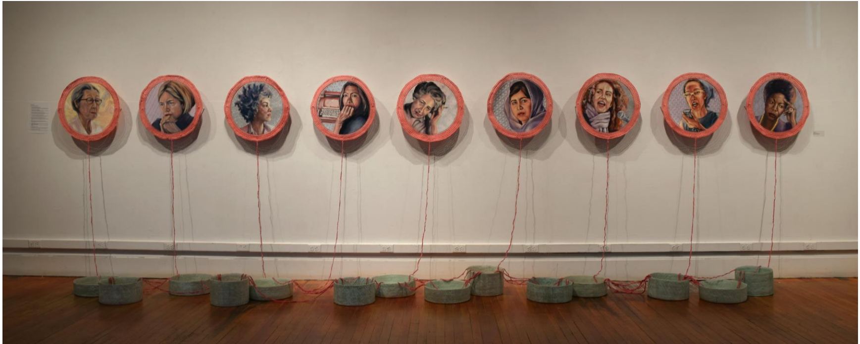
Figure 1: Not alone