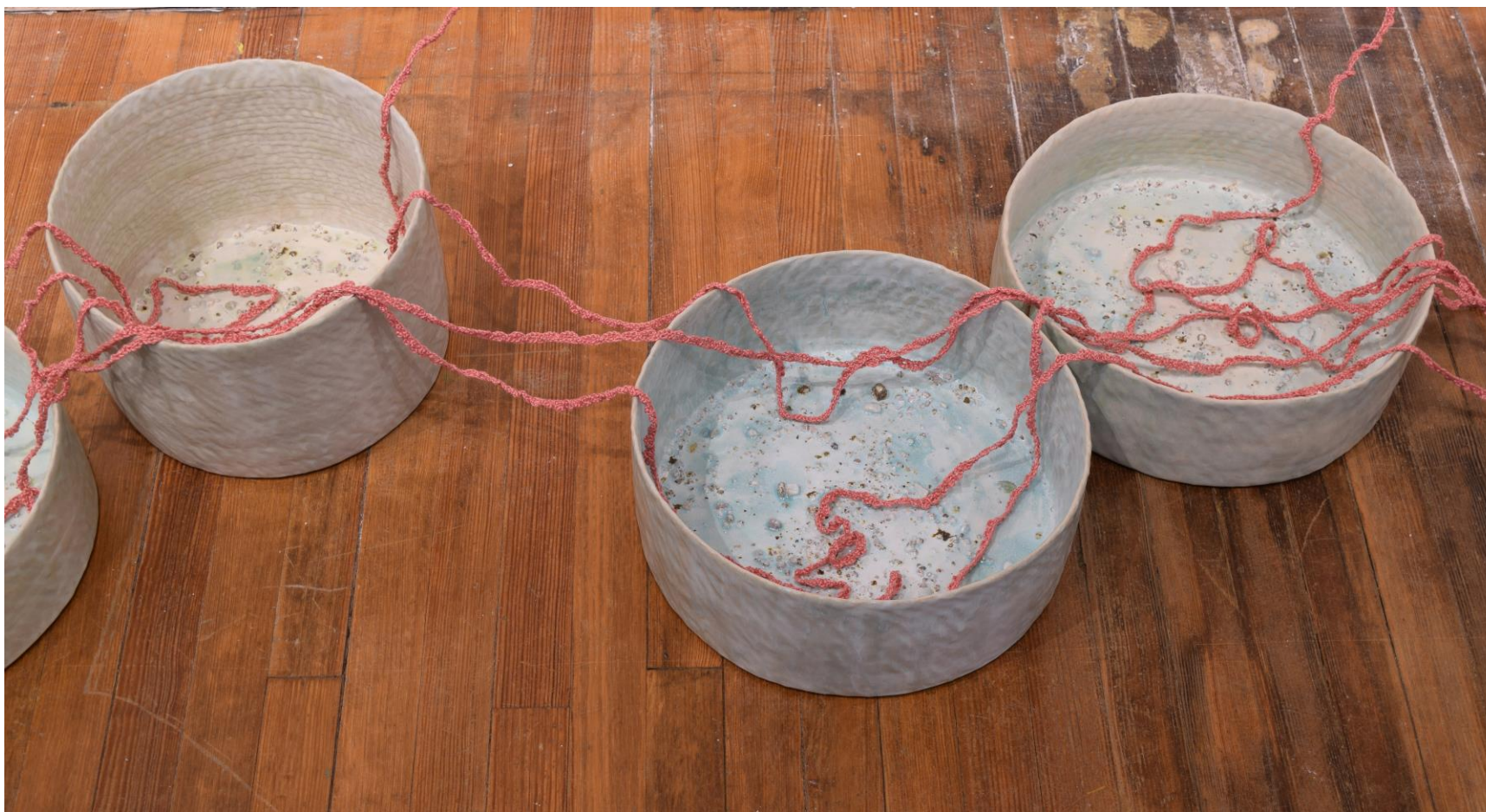
Figure 4: Not alone (ceramics)