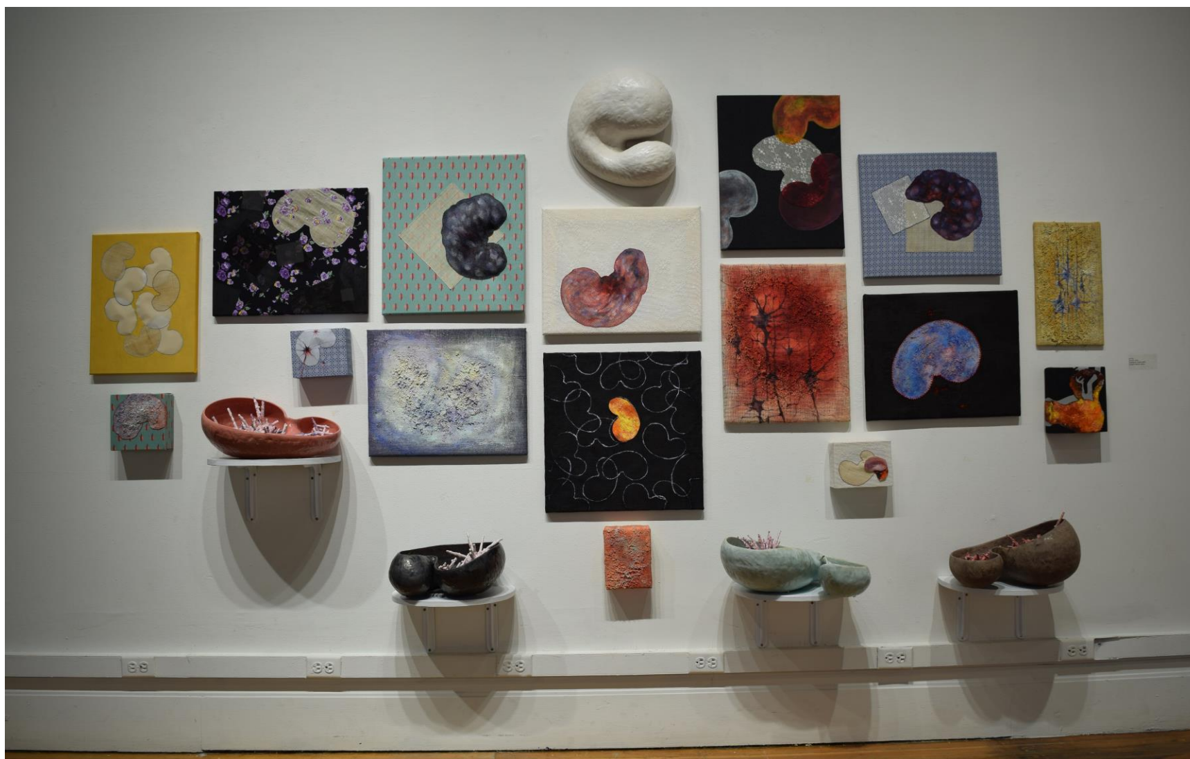
Figure 5: ab intra