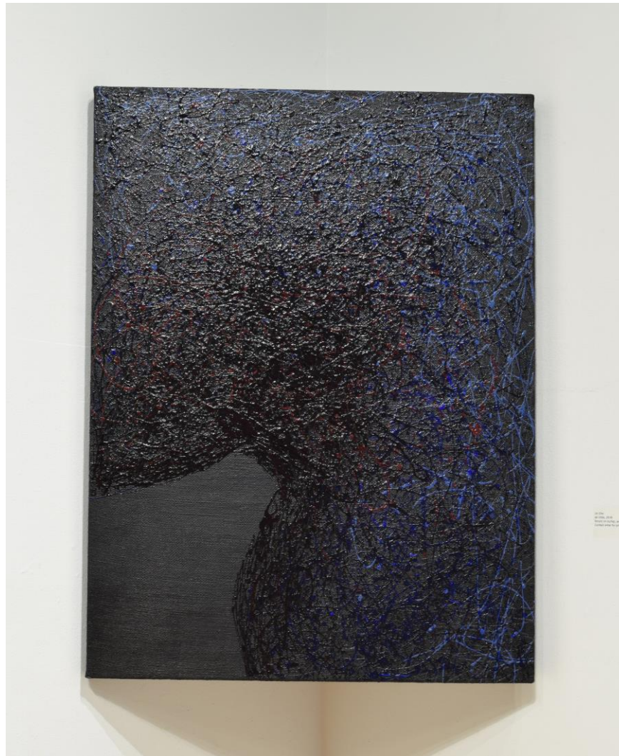
Figure 9: ab initio (painting)