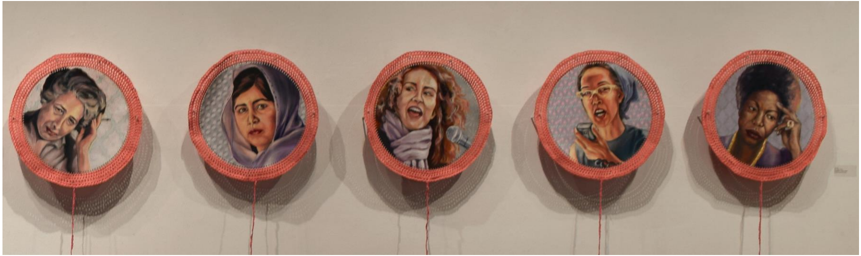
Figure 3: Not alone (paintings)