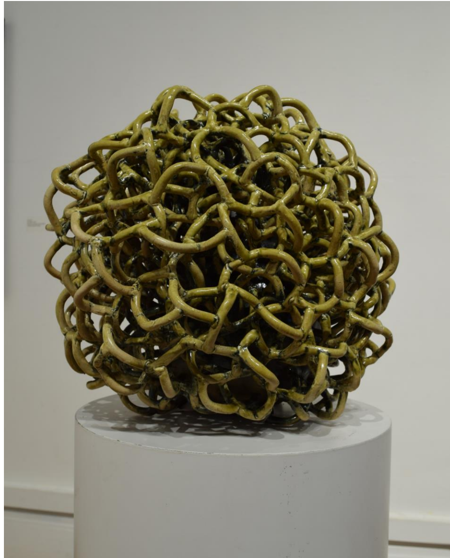
Figure 10: ab initio (ceramics)