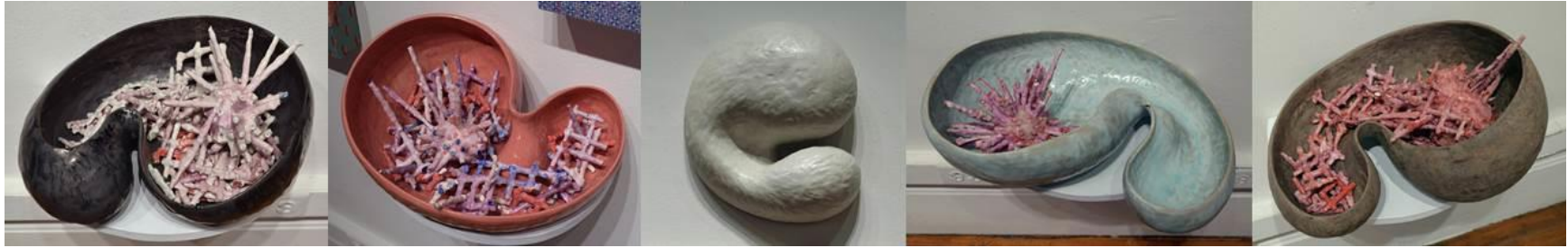
Figure 7: ab intra (ceramics)