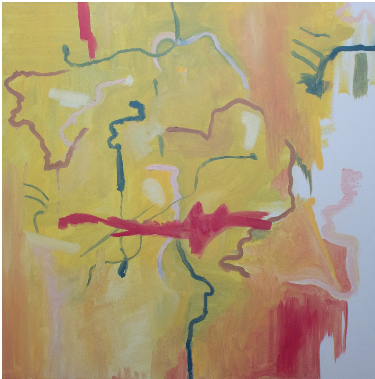
Figure 8: Haven