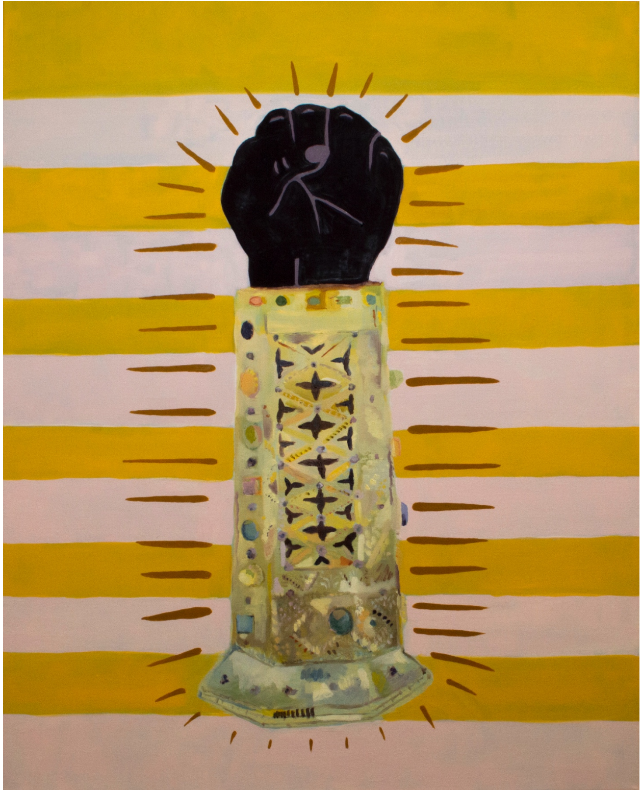
Figure 5: Fist Reliquary