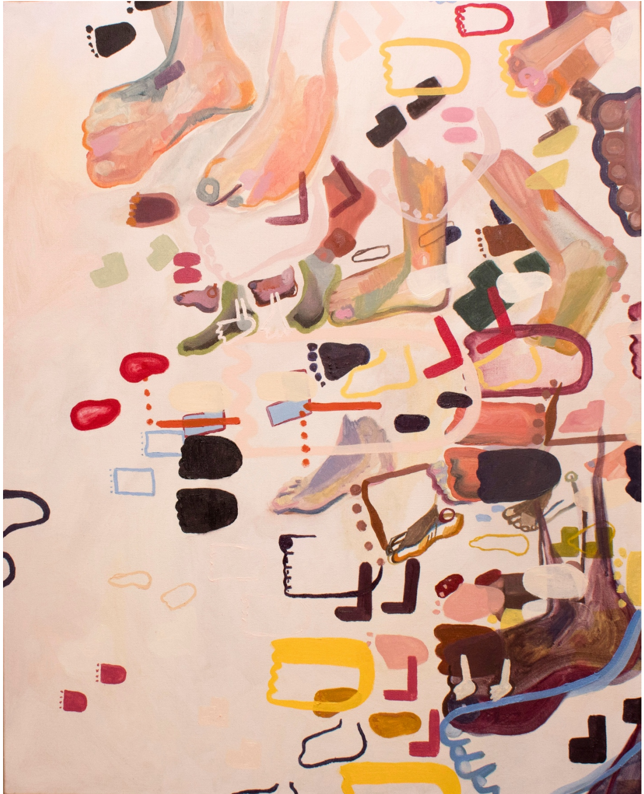
Figure 4: Feet