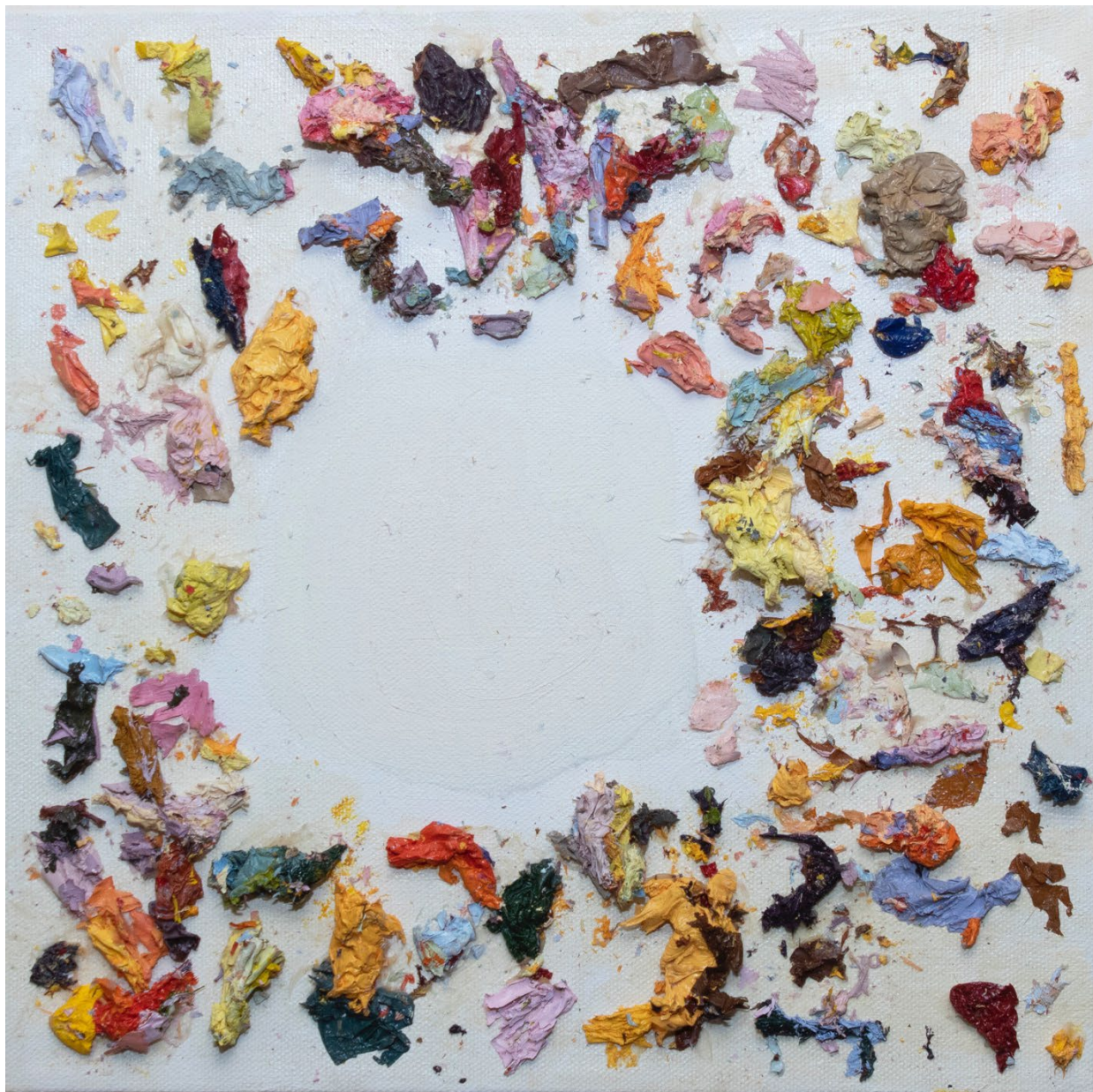
Figure 7: Self-Portrait