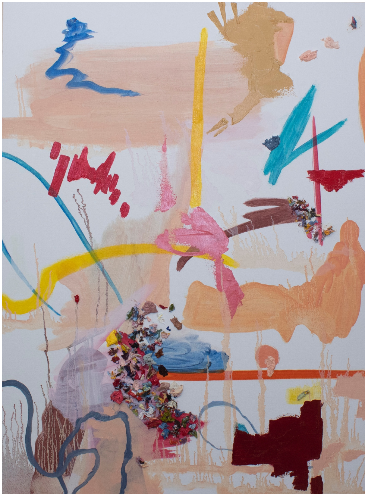
Figure 1: And that's how it makes you feel