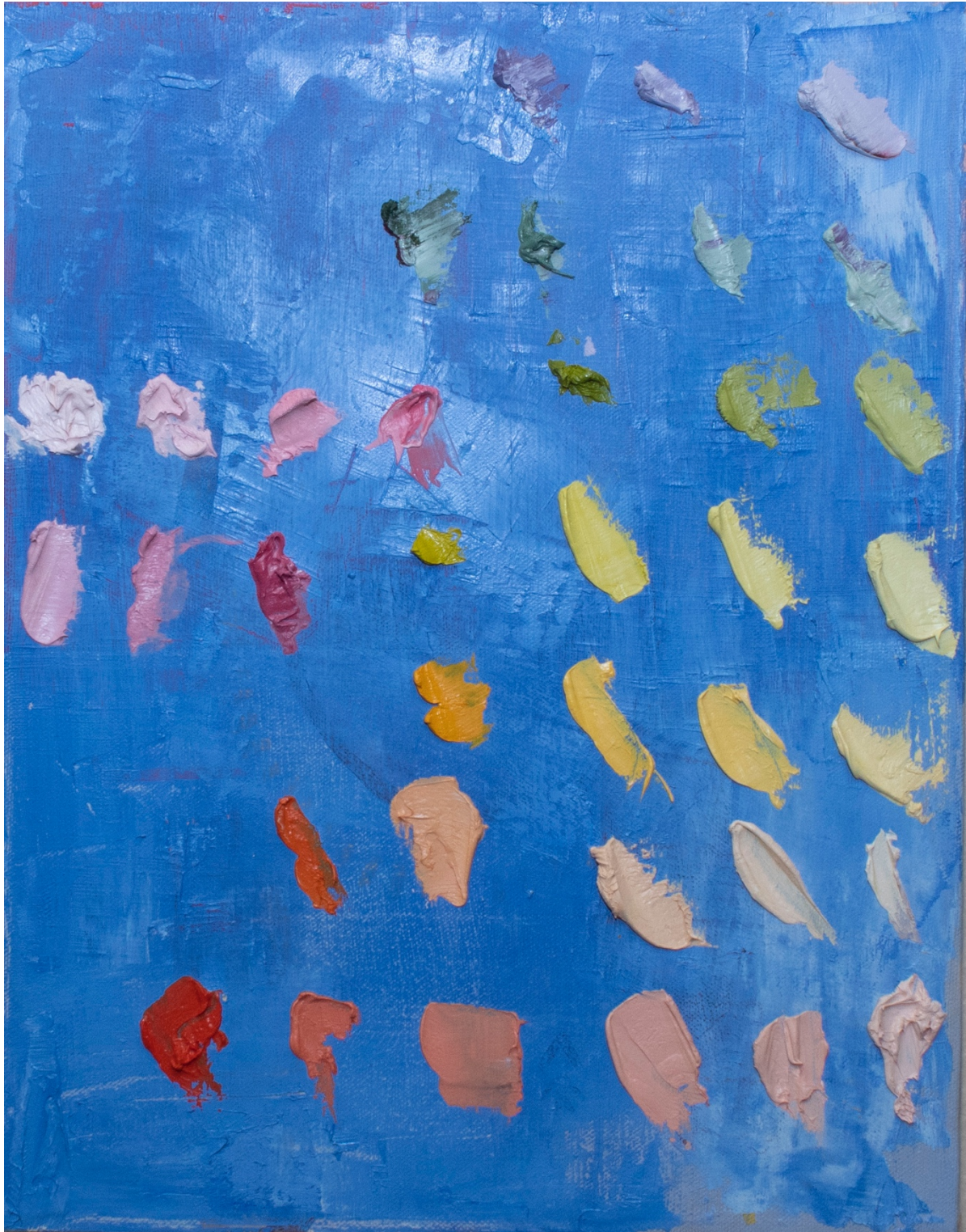
Figure 9: Building Blocks