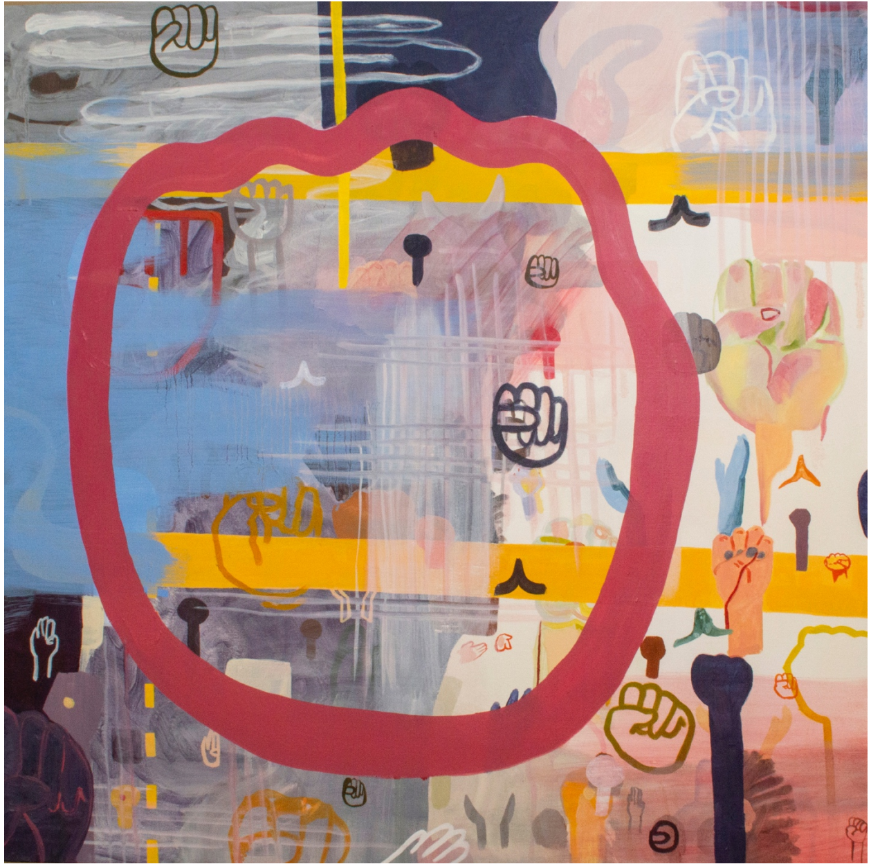
Figure 3: In the Streets