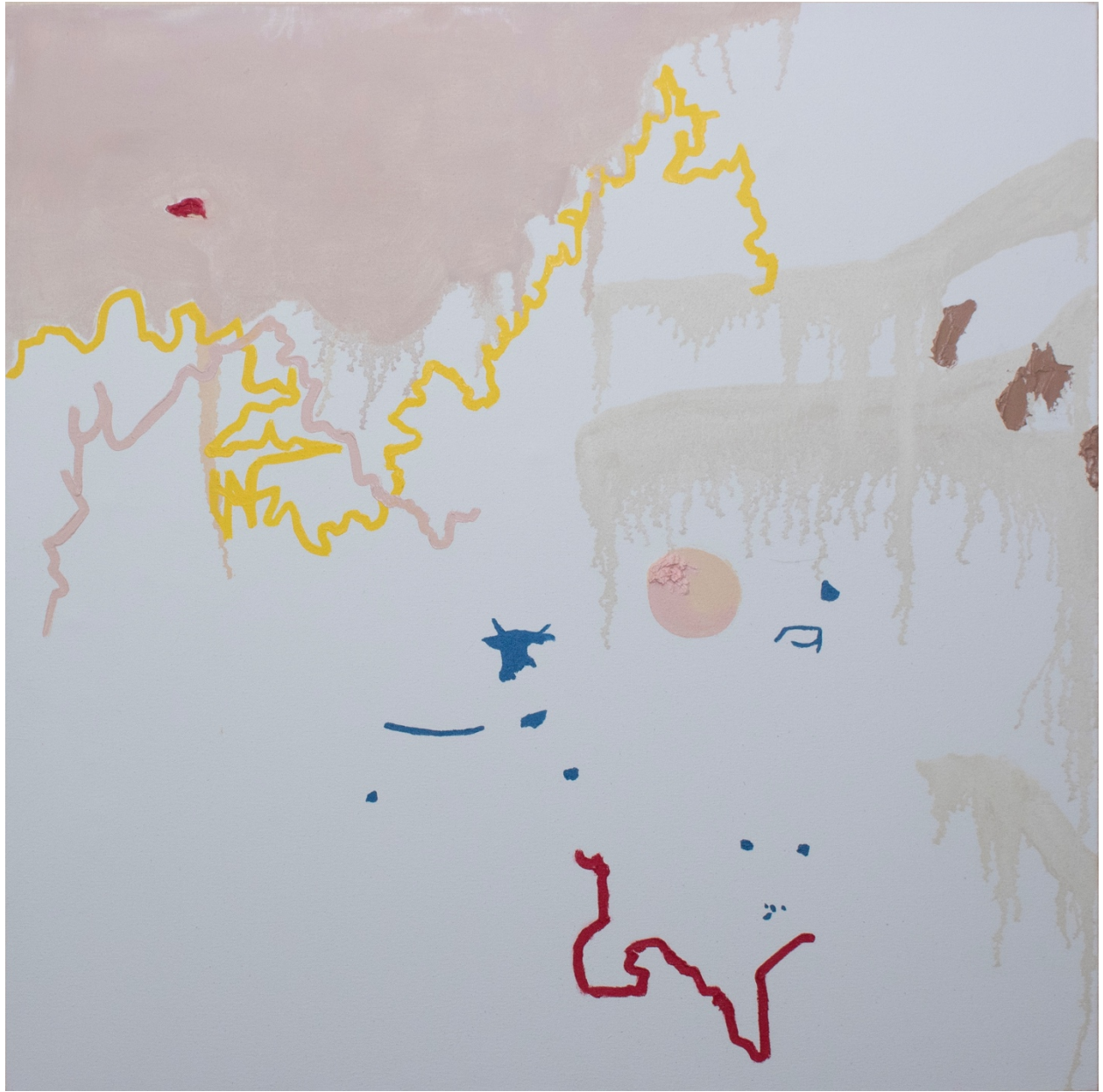
Figure 2: Mirage