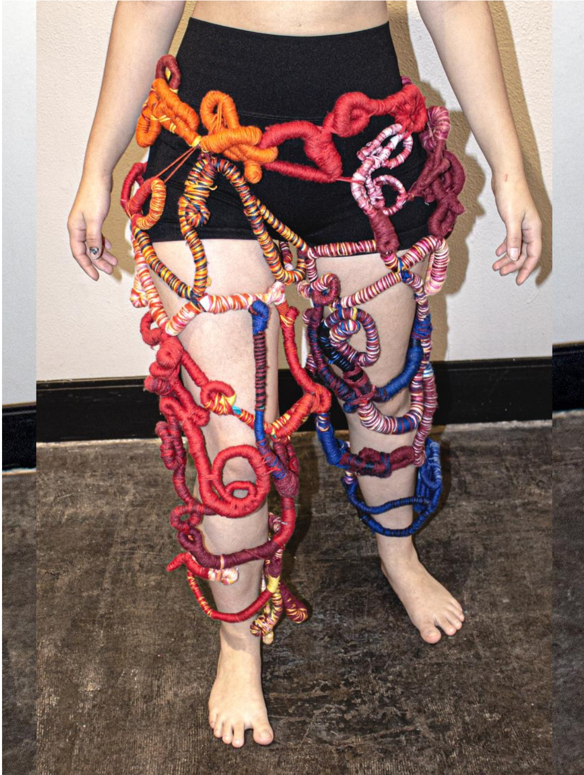
Figure 1: Grounded Roots in Loosing Touch