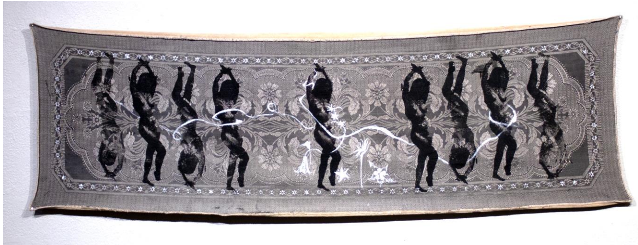
Figure 4: Flourishing & Fading Physicalities of Ikebana