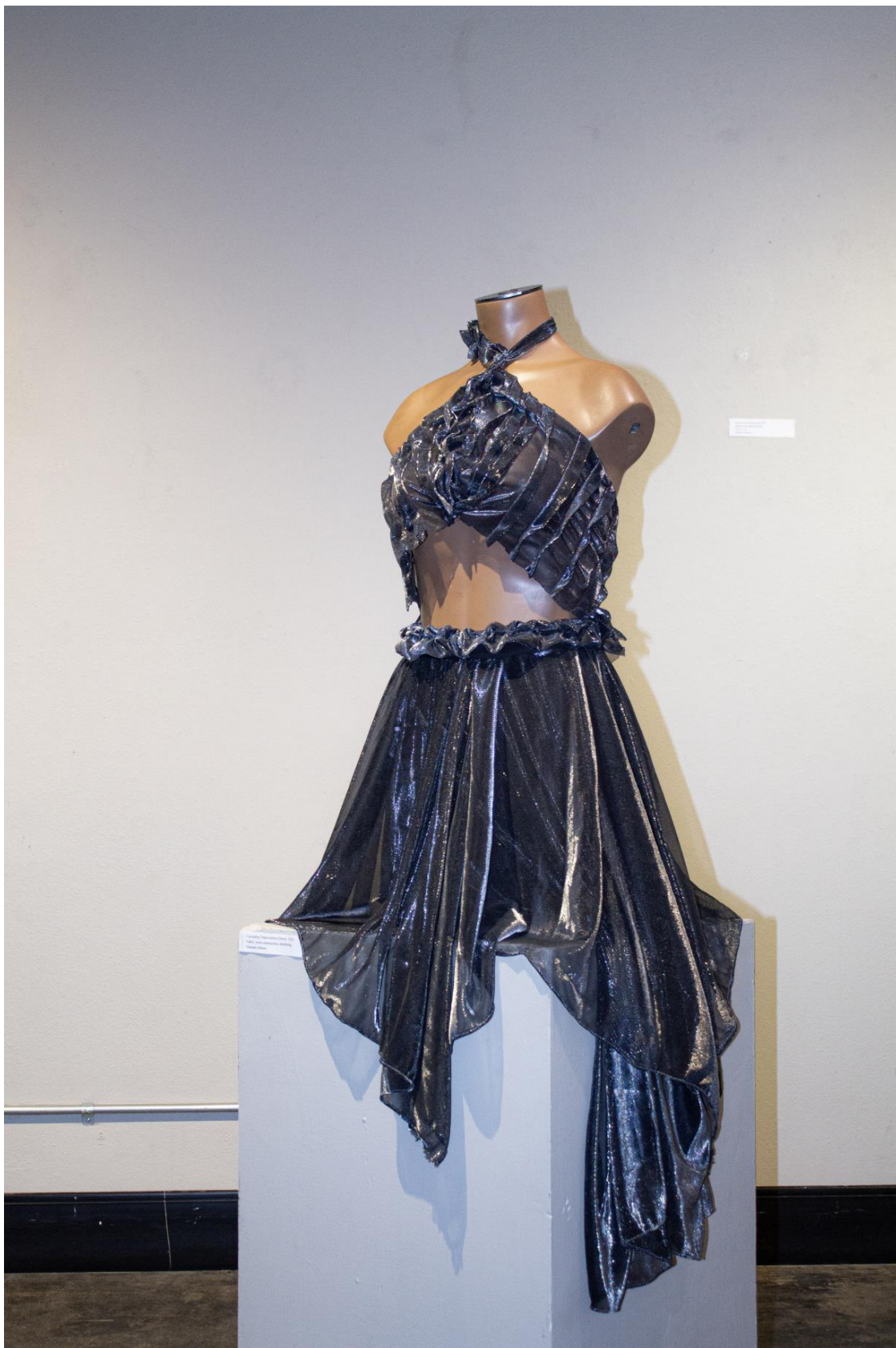
Figure 2: Cascading Temporalities