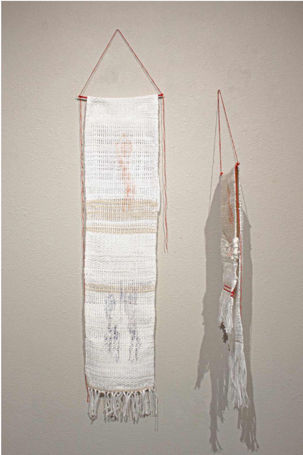
Figure 3: Woven Physicalities